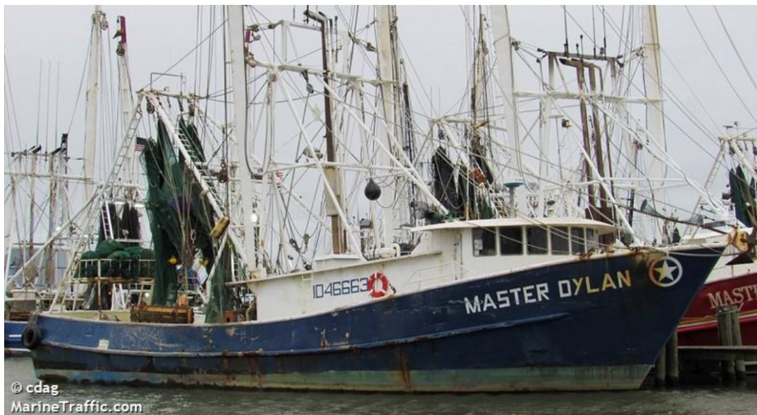
The Master Dylan before the accident.

About 0745 on December 1, 2020, the fishing vessel Master Dylan was trawling for shrimp in the Gulf of Mexico when an explosion occurred in the engine room. Attempts to fight the subsequent fire from on board the vessel were unsuccessful, so the crew abandoned ship to a Good Samaritan vessel. The fire was eventually extinguished by other responding vessels, and the Master Dylan was taken under tow. However, during the tow, the stricken vessel ran aground, the fire re-flashed, and the vessel later sank. The vessel was a total constructive loss with an estimated value of at $300,000.