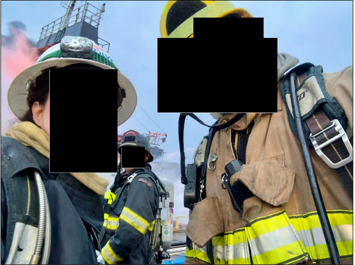
Figure 3 - Strong work from the PNW Firefighting Strike Team!