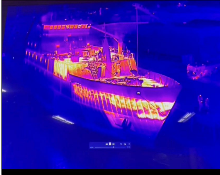
Figure 1 - Day One...