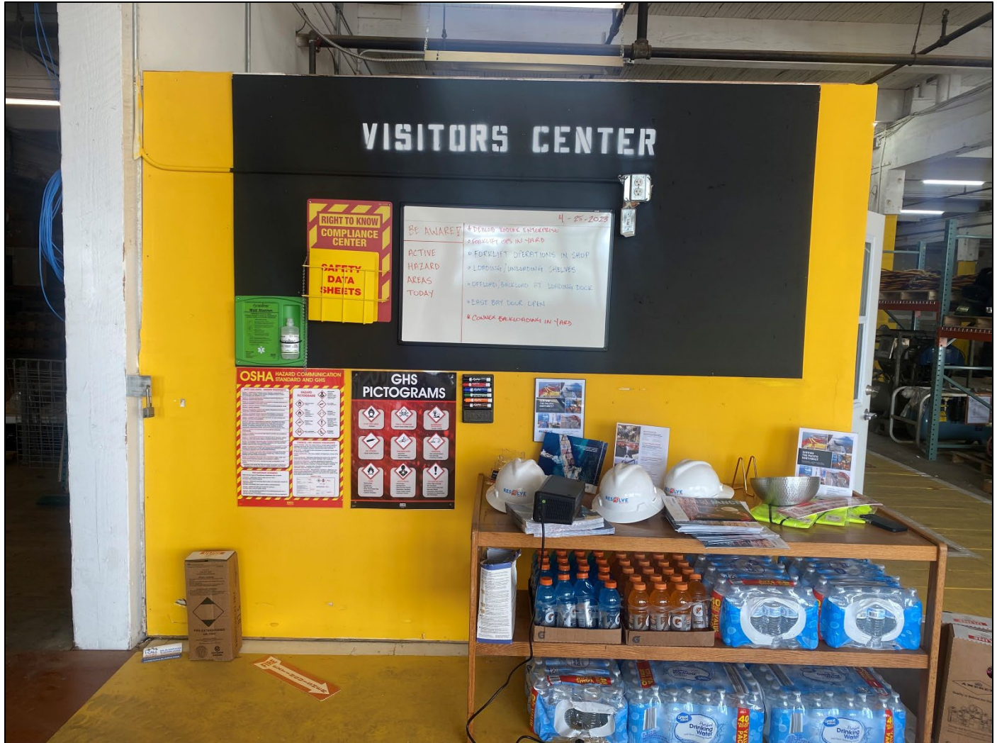
Figure 3 - Safety First - Visitors center in Tacoma Warehouse