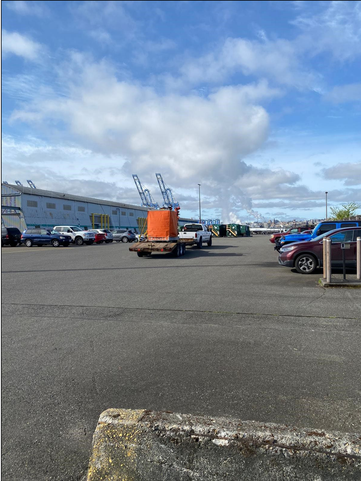
Figure 5 - Fire pump returning to the warehouse