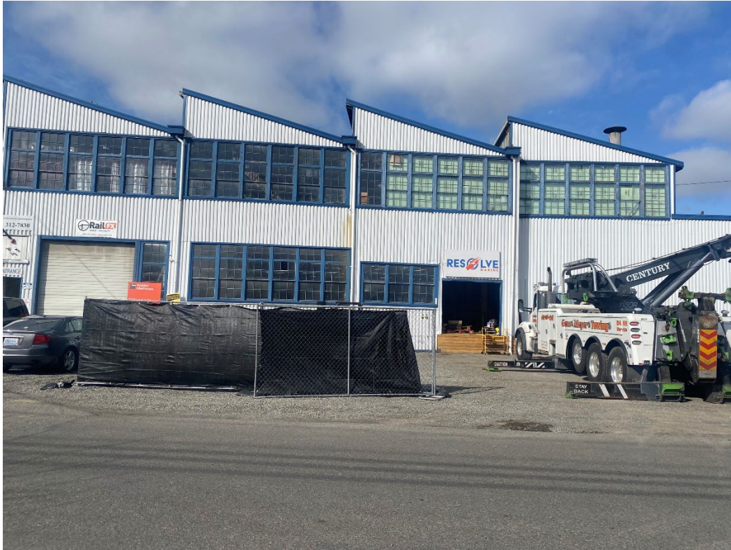
Figure 1 - Tacoma Warehouse receiving demobilized gear