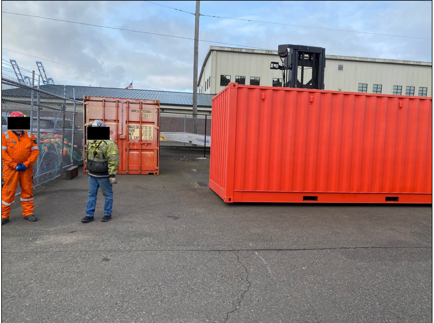
Figure 4 - Demobilizing equipment