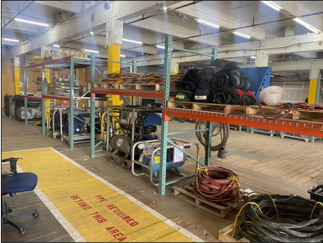
Figure 2 -Dive gear ready to go back to work