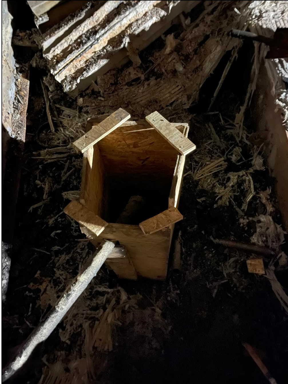
Figure 2 - box patch constructed around the transducer