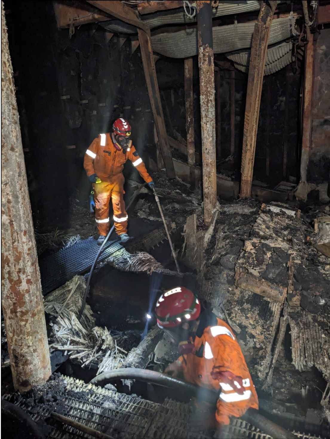
Figure 4 - defueling crew stinging tanks and voids