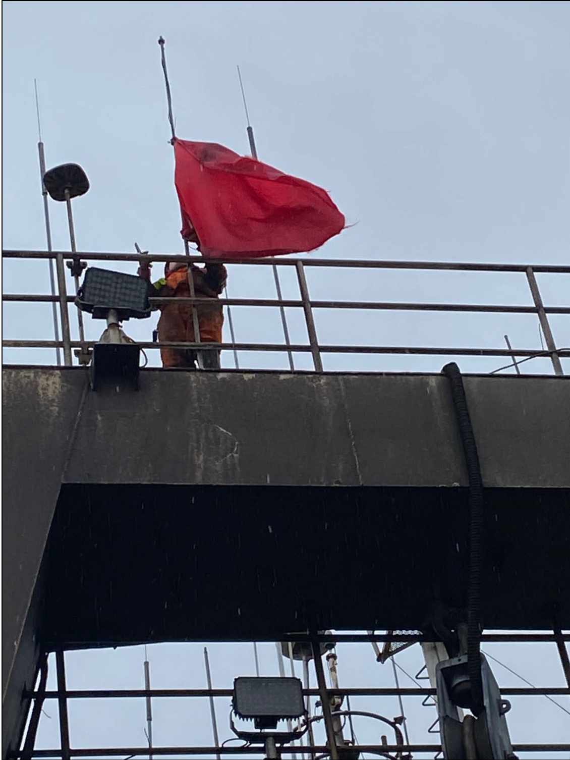
Figure 6 - Lowering the Bravo flag