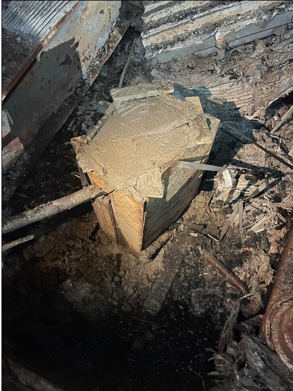
Figure 3 - box patch completed and filled with quick dry cement