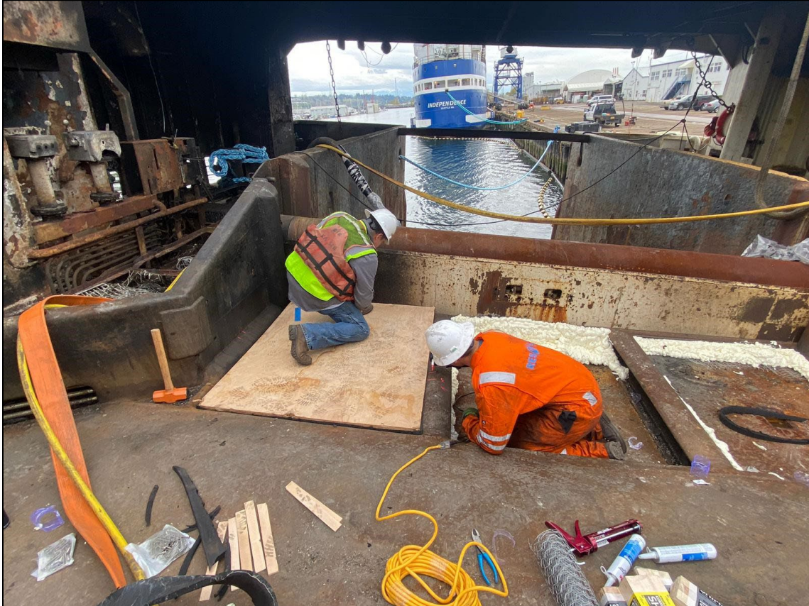
Figure 1 - Onboard patching operations