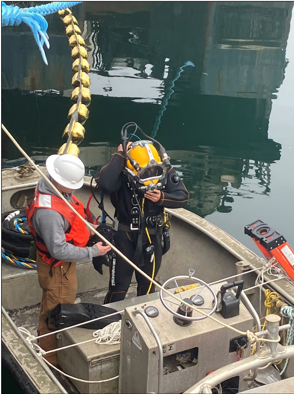
Figure 5 - Diver preparing for patching dive