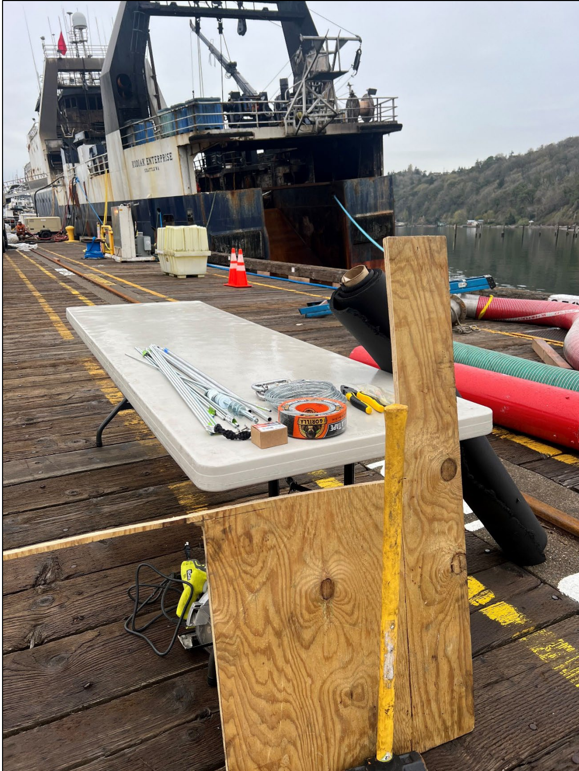
Figure 3 - Materials for building patches to be installed on the next dive