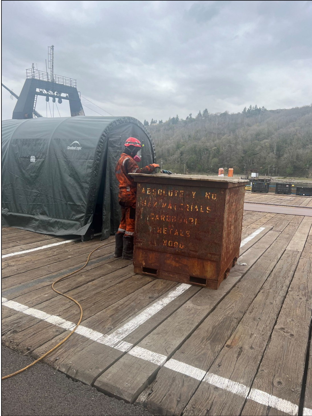
Figure 5 - Crew beginning the end of shift decon process