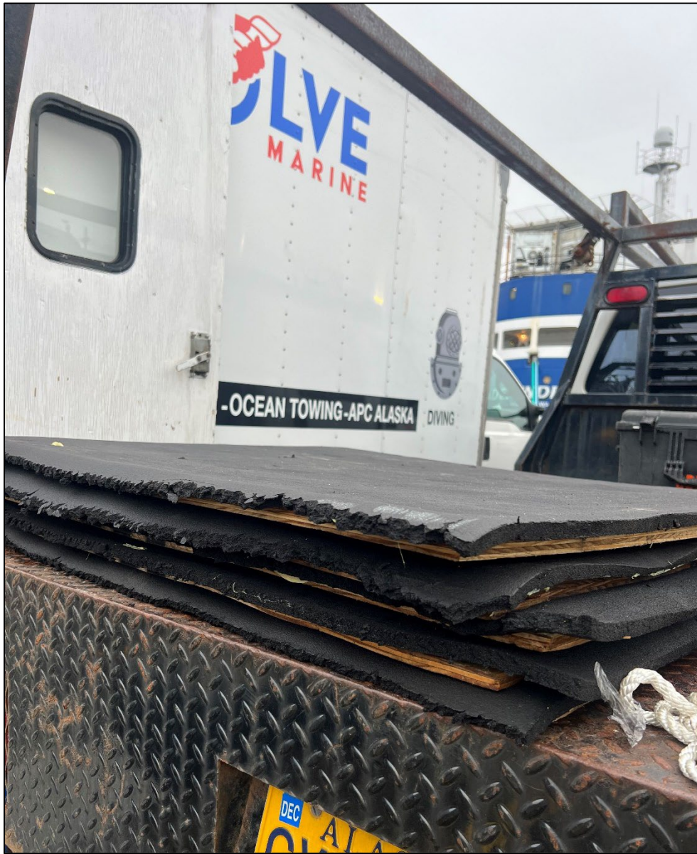
Figure 4 - Patches ready to install