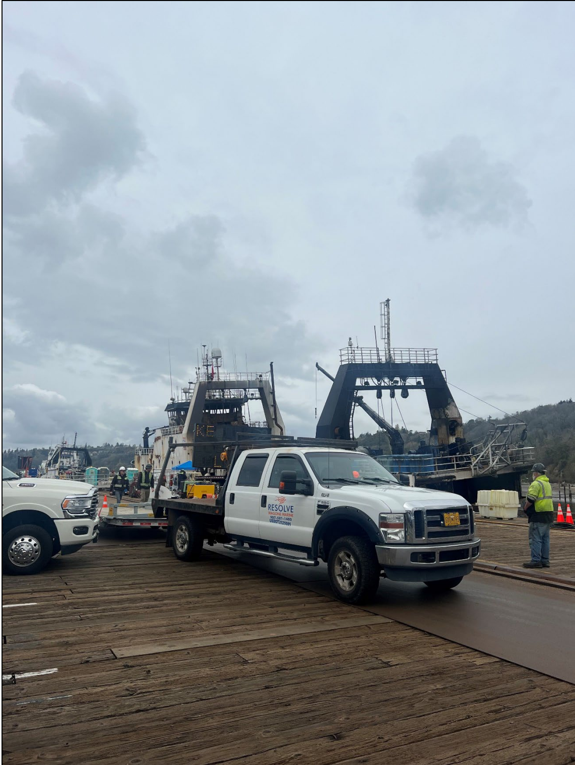
Figure 2 - Beginning the demobilization process; returning equipment to the Tacoma warehouse