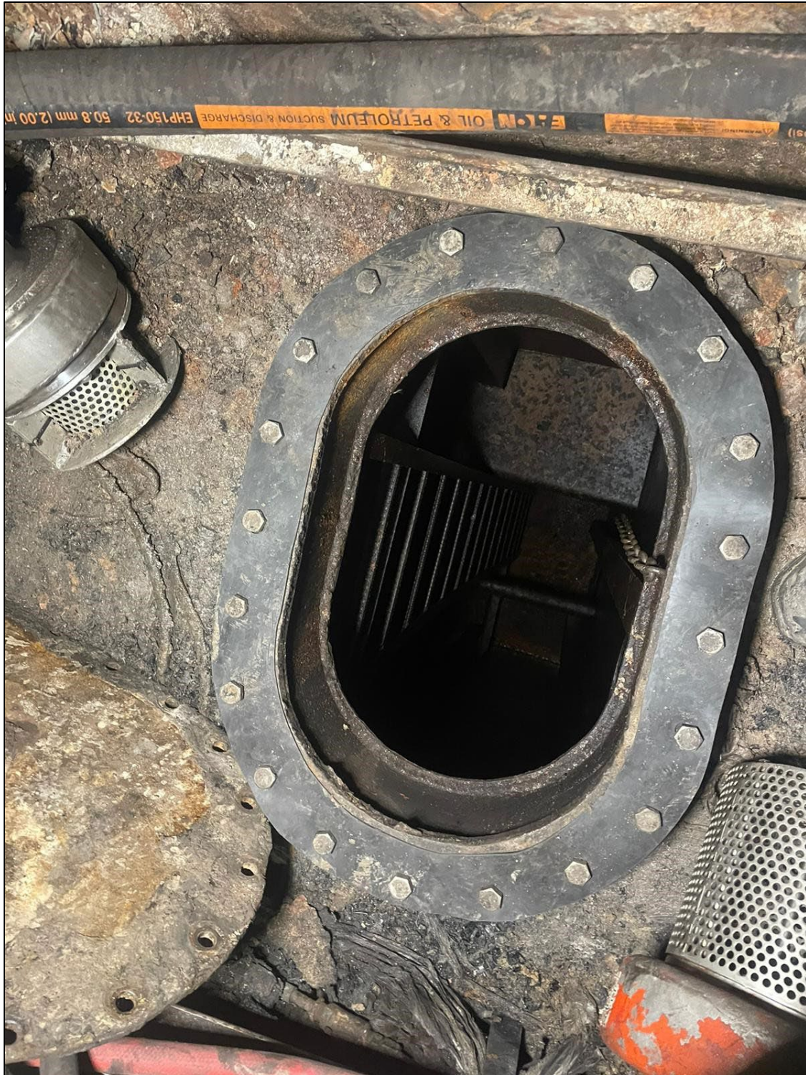
Figure 6 - Each tank is visually inspected and then resealed once empty