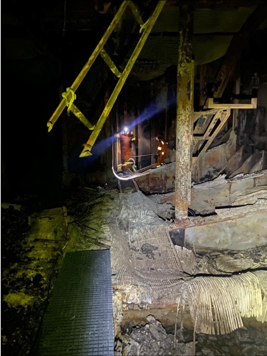
Figure 3 - Crew accessing tanks for defueling operations