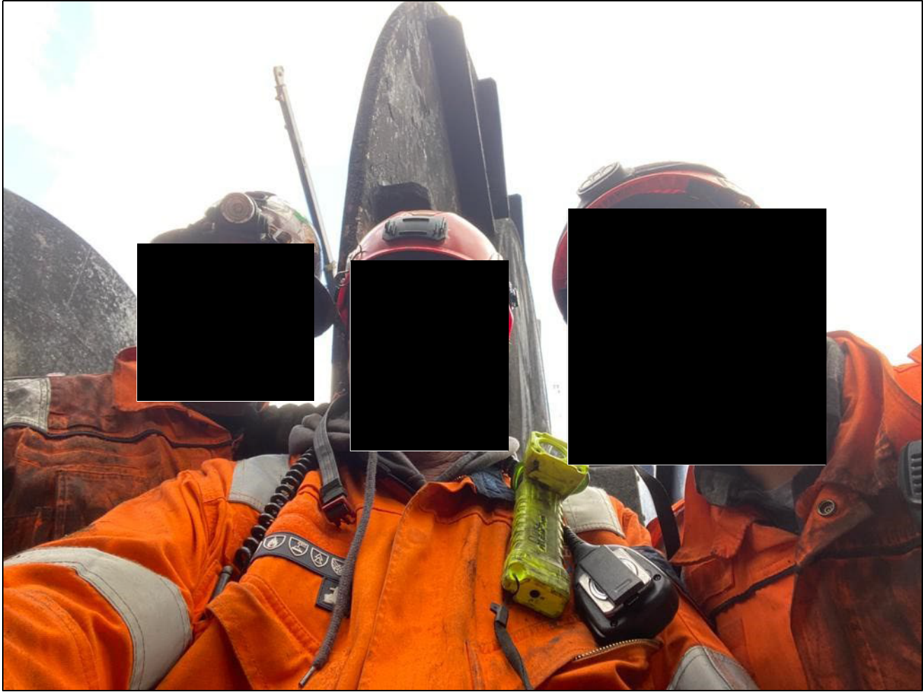
Figure 5 - It must be the home stretch; they're all taking selfies.