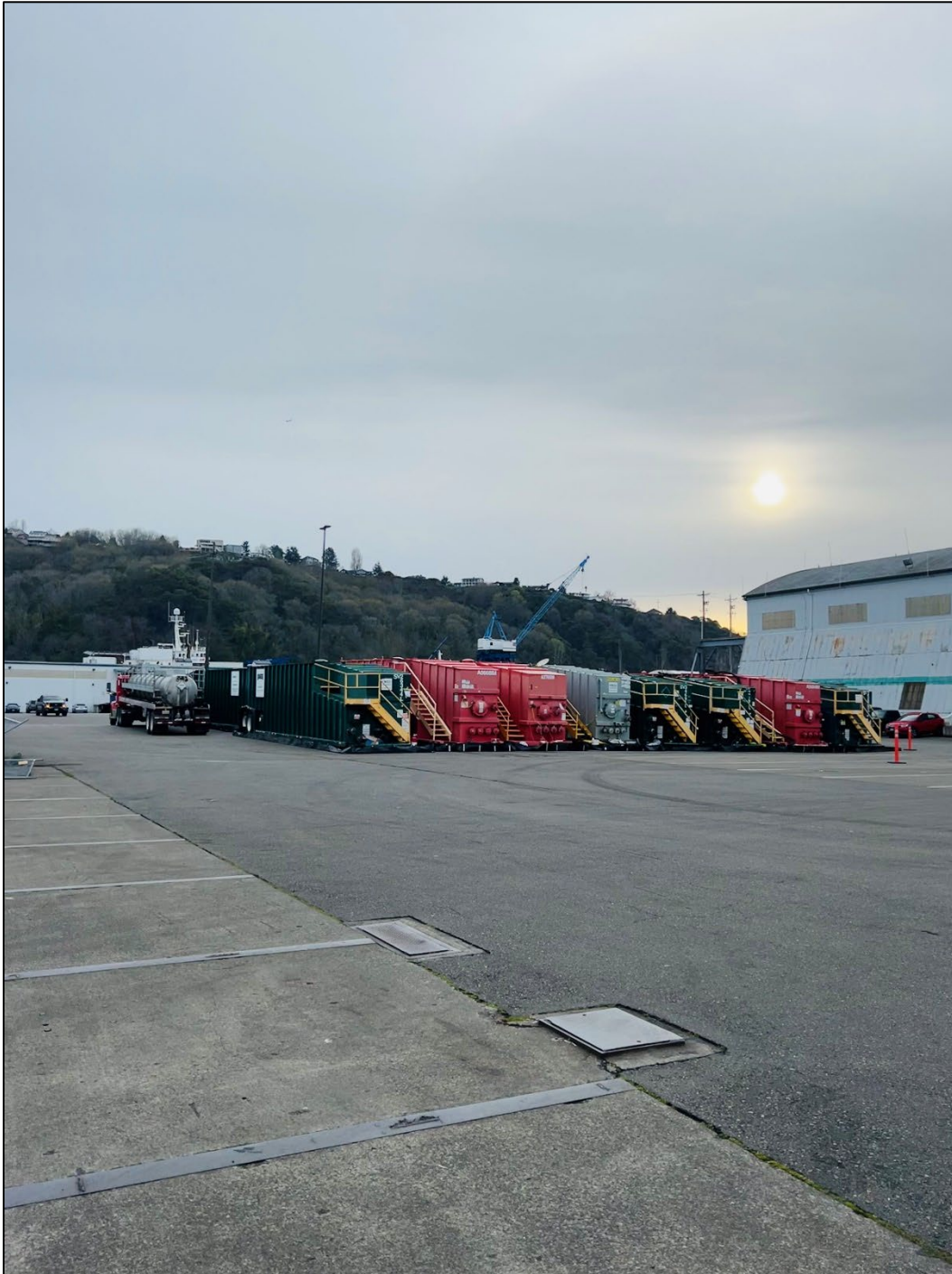
Figure 1 - 14 frac tanks in containment and standing by for fuel and oily water transfer