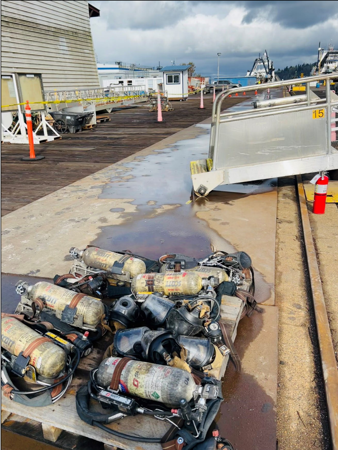
Figure 4 - SCBAs standing by near the boarding ramp