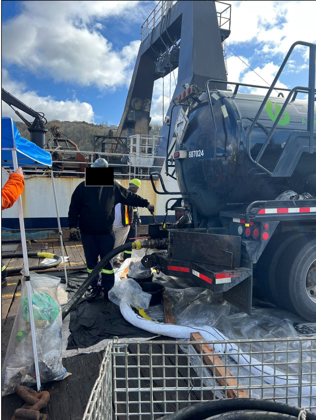
Figure 2 - Vac truck load #100 pumping from #3 fuel tanks