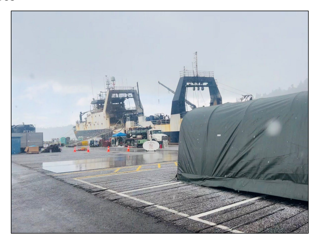
Figure 1 - Springtime in Washington: Hail one minute...