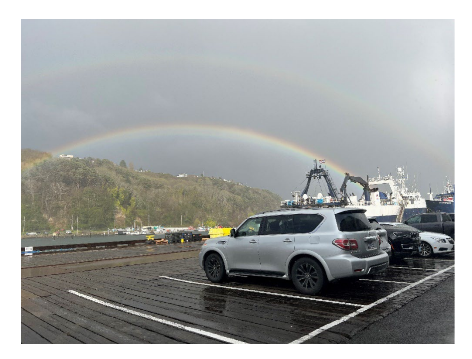
Figure 2- ....and rainbows the next minute.