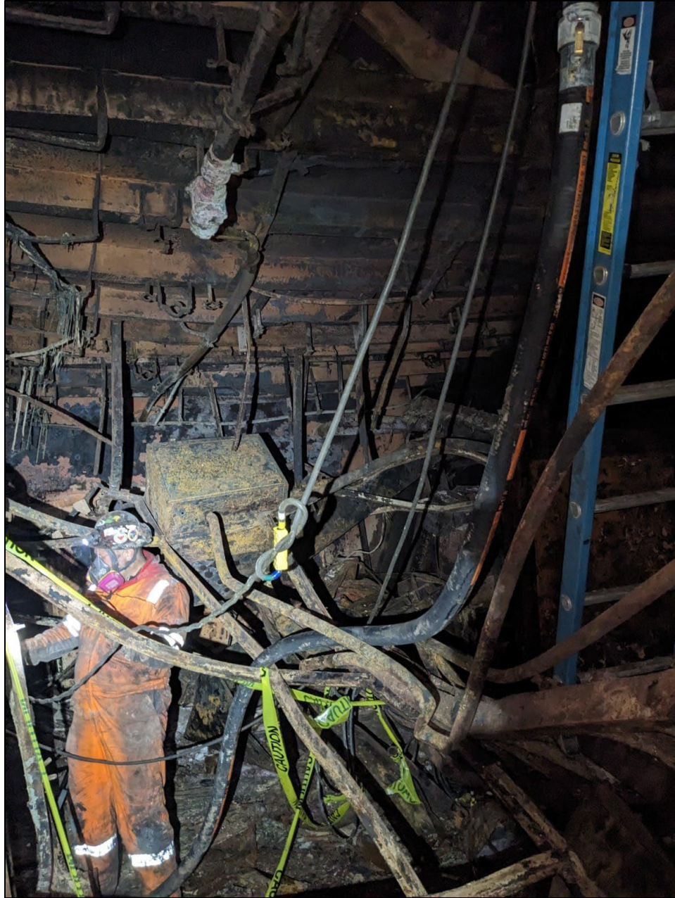
Figure 3 - Placing defueling and dewatering lines