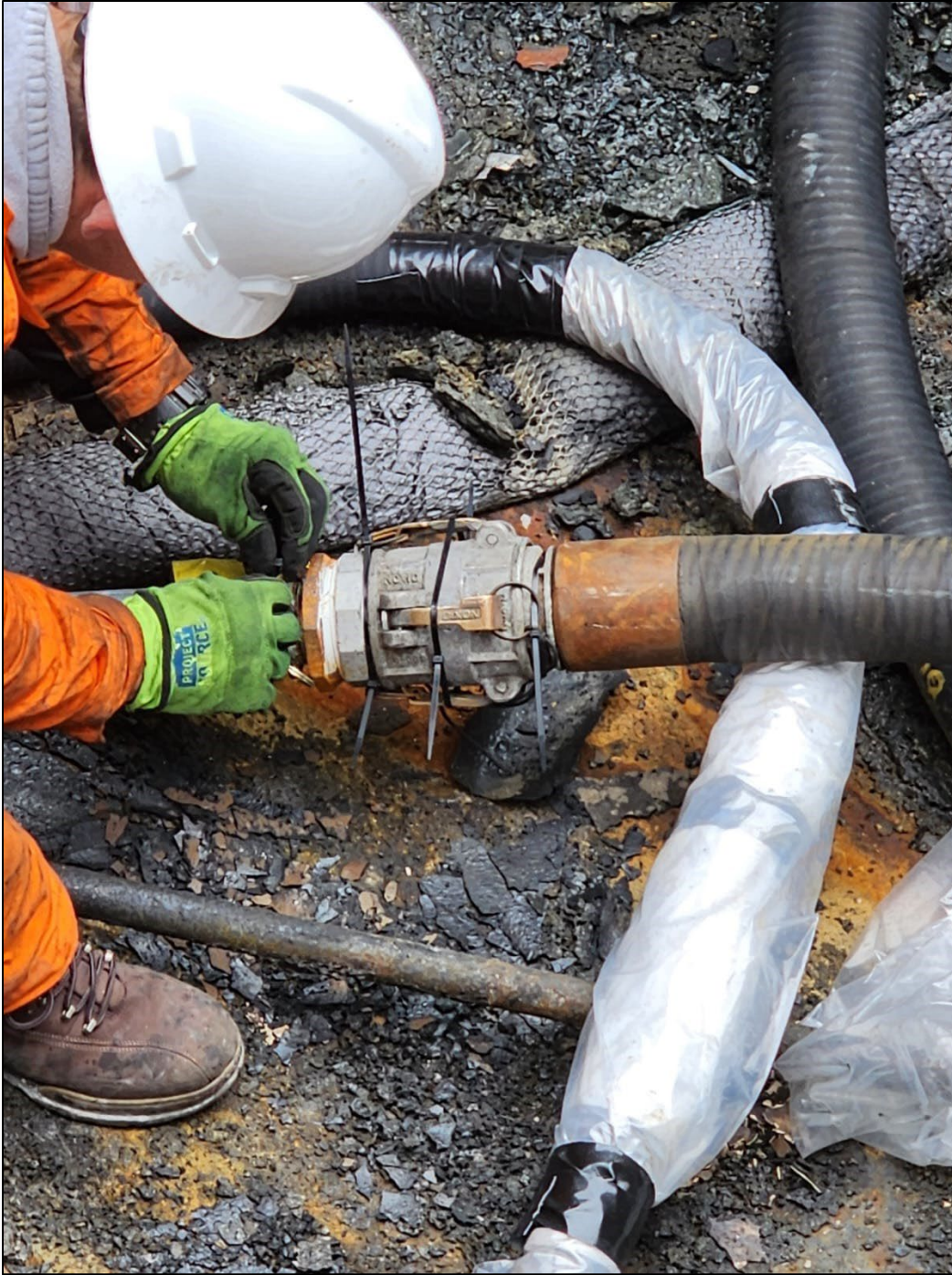
Figure 2 - Preparing for fuel transfer