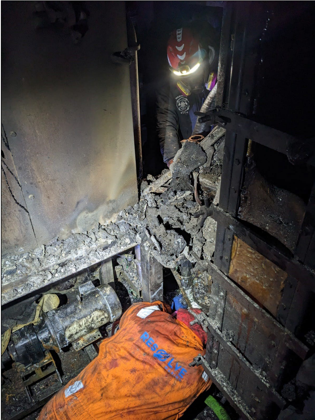
Figure 1 - Leak repairs