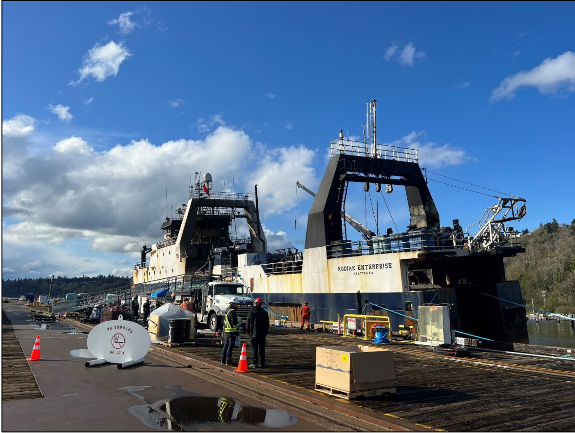
Figure 4 - Fuel transfer - 1st Vac truckload