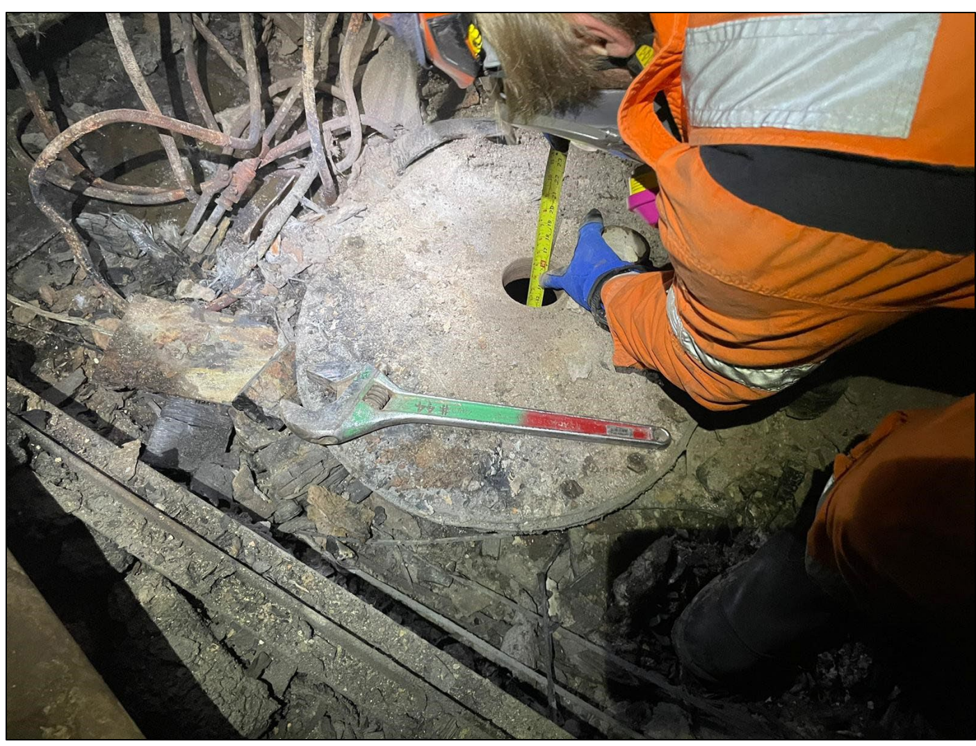
Figure 3 - Naval Architect taking soundings for the Salvage Plan