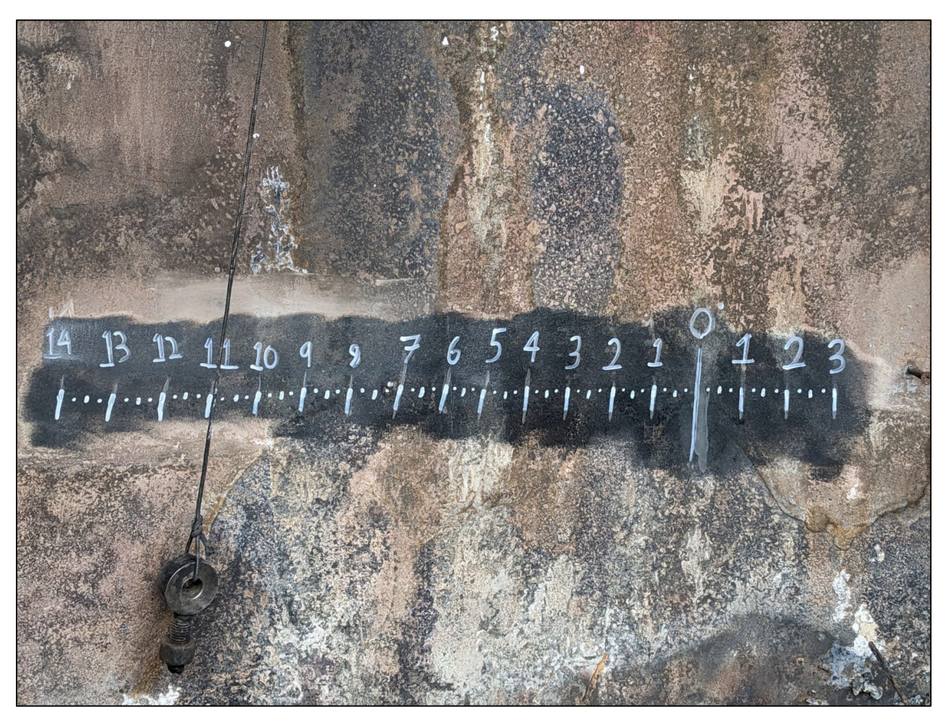
Figure 1 - Homemade inclinometer