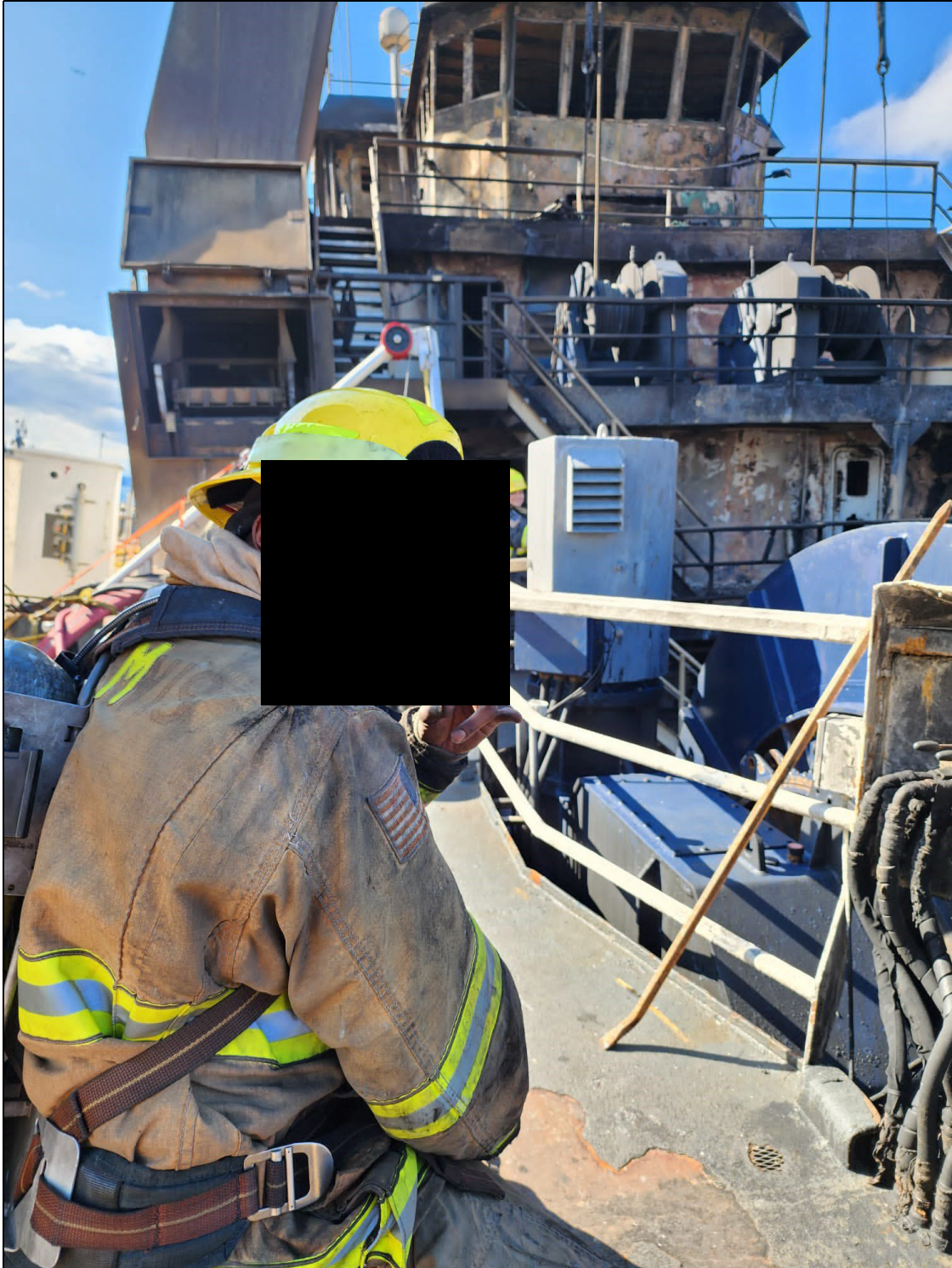
Figure 3 - Lewis Everard, one of the Washington State based firefighters.