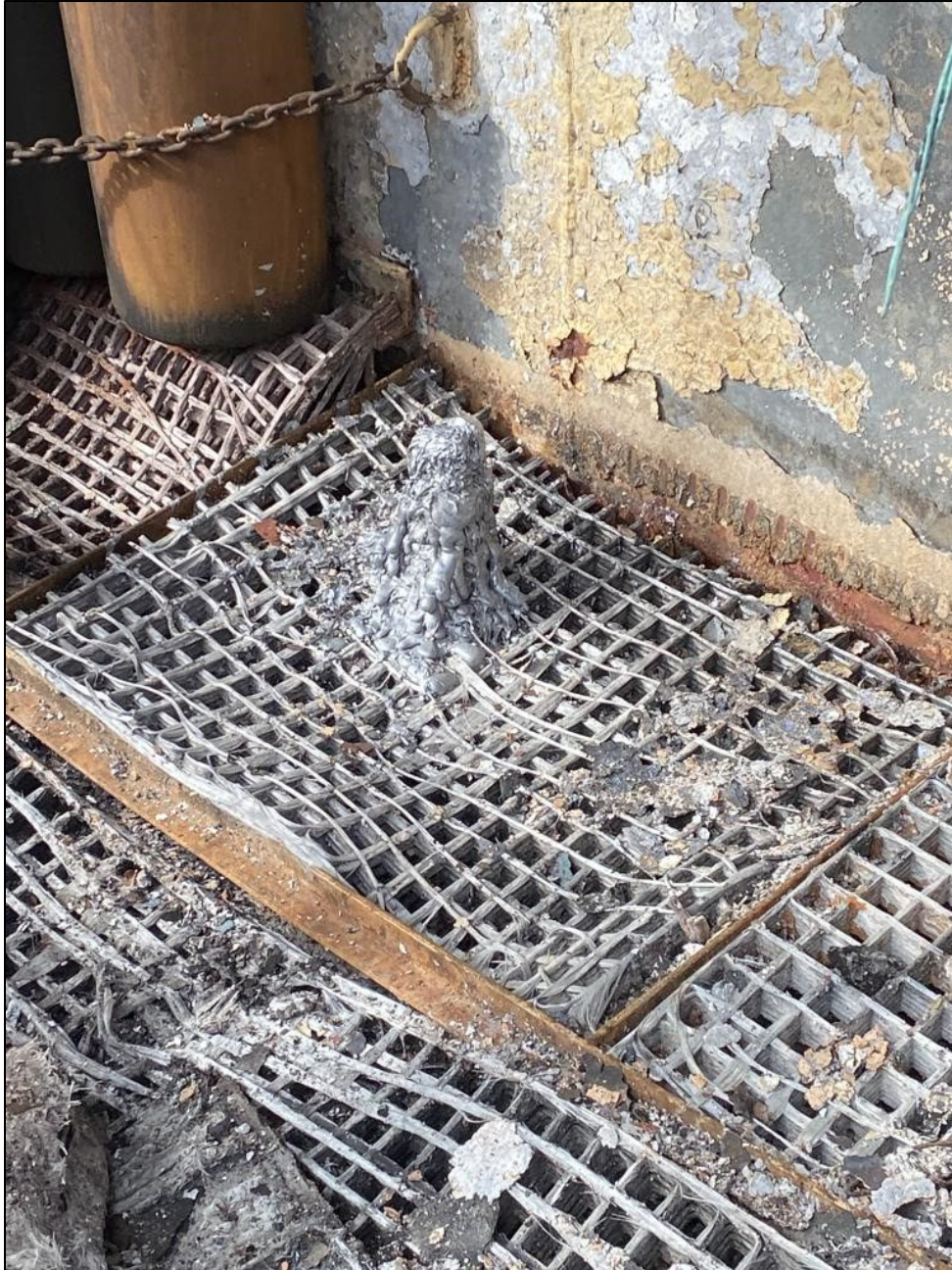
Figure 1 - Melted aluminum on the factory deck