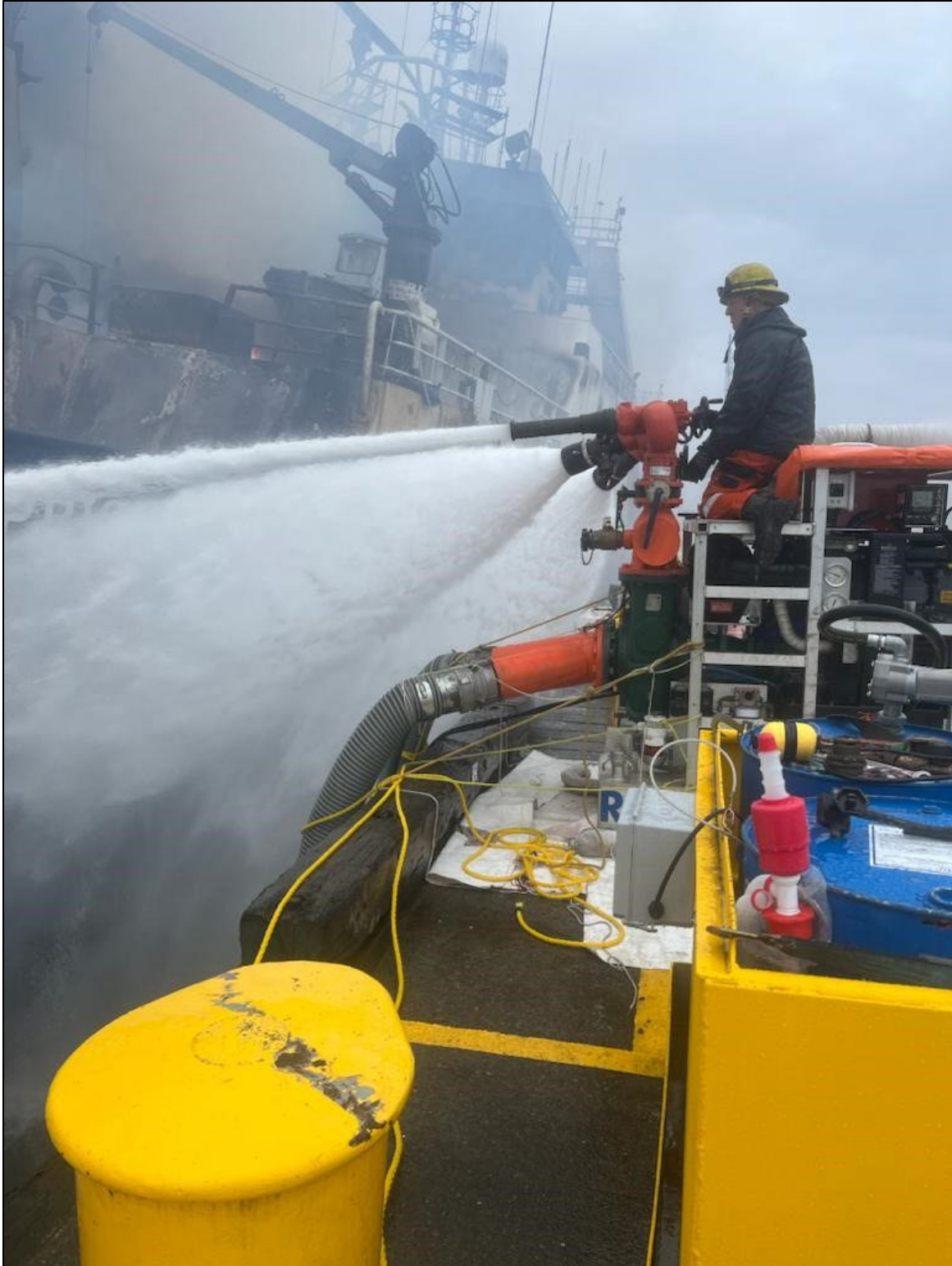
Figure 1 - Resolve fire pump cooling the hull