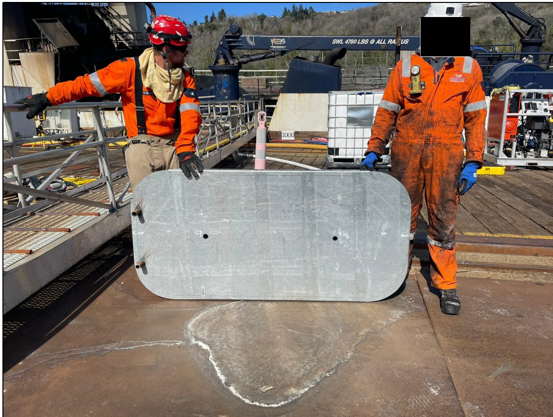
Figure 4 - Hatch progress