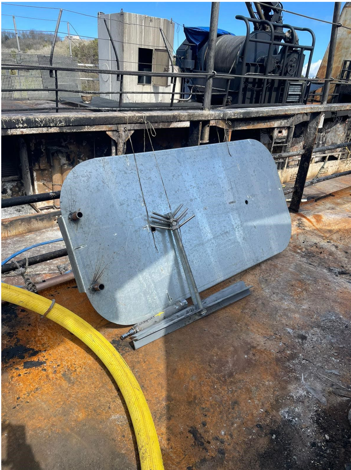
Figure 5 - Completed hatch