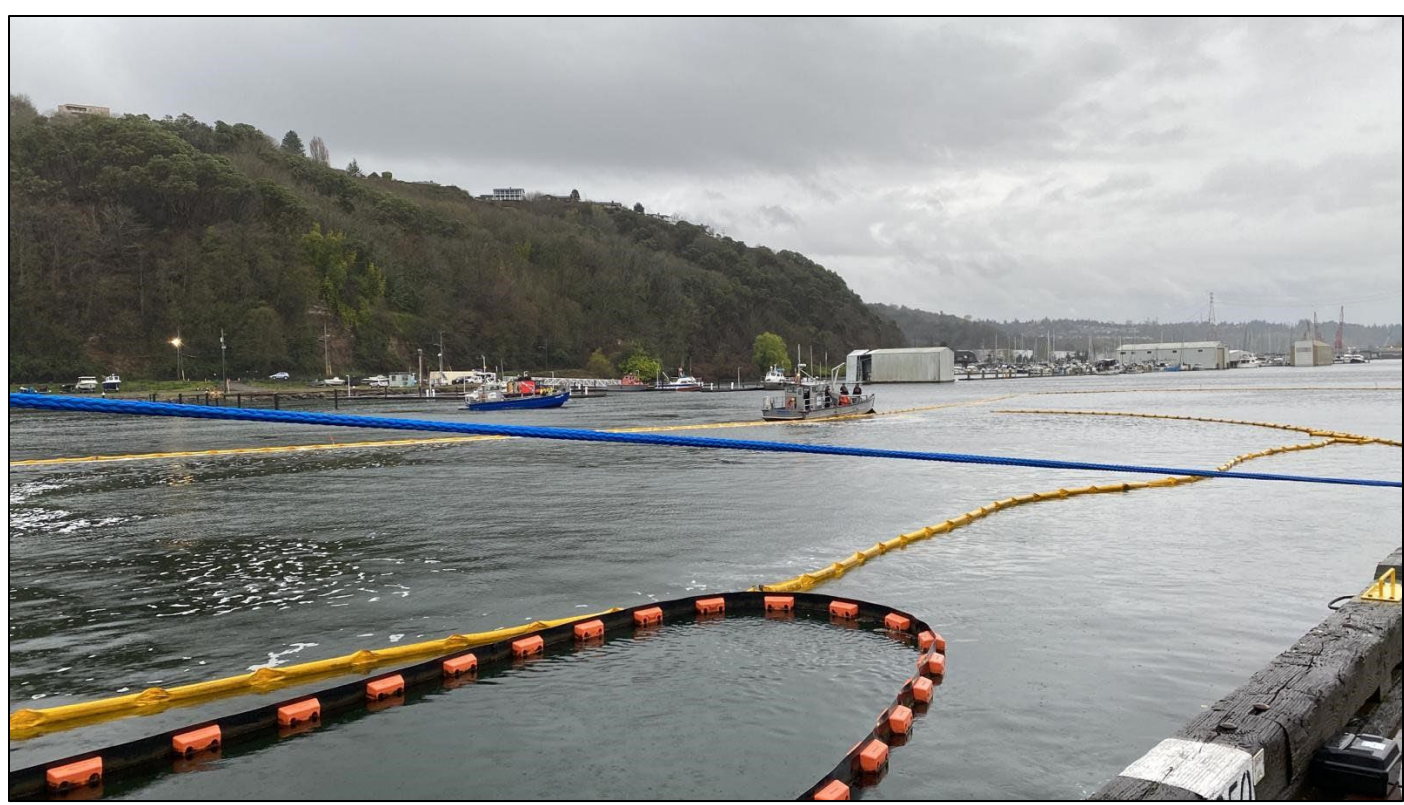
Figure 2 - MSRC crew adjusting containment boom.