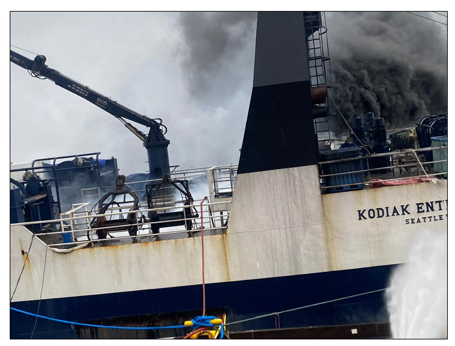
Figure 1 - Smoke on deck of the vessel