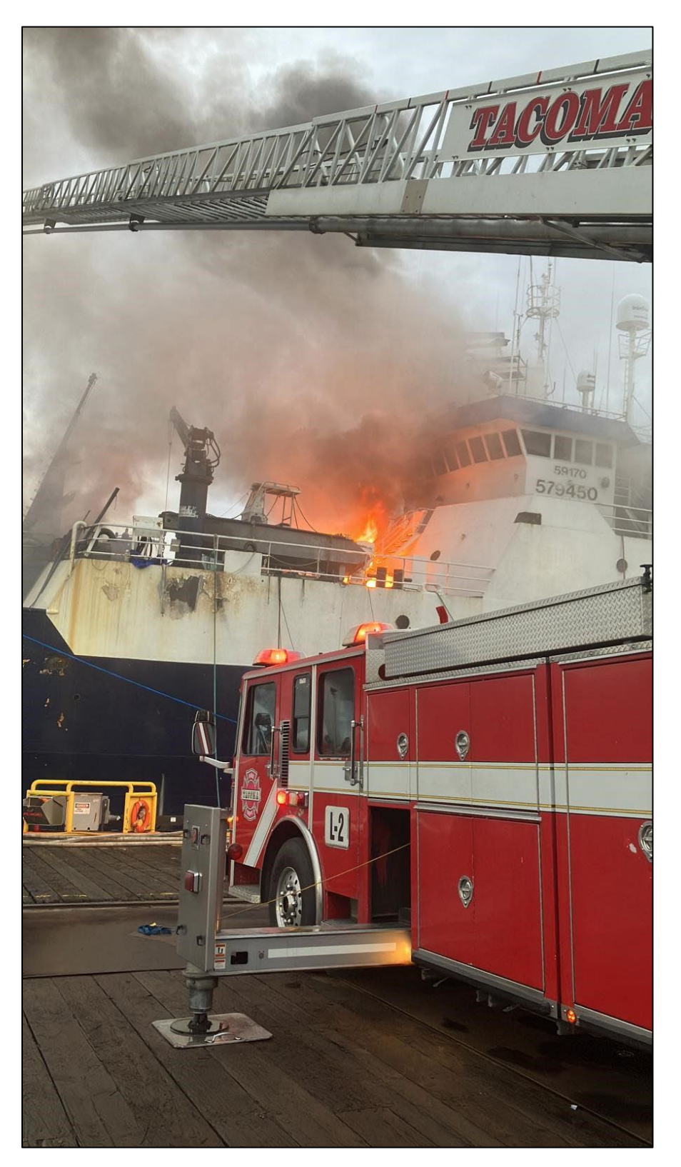
Figure 2 - Tacoma Fire Department on scene.

23-EN02 Daily Progress Report No. 001 Date: 8 April 2023