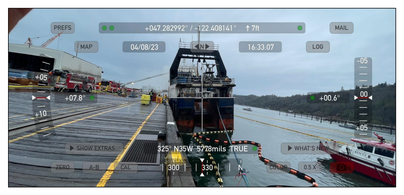
Figure 10-1 Initial readings of vessel list.