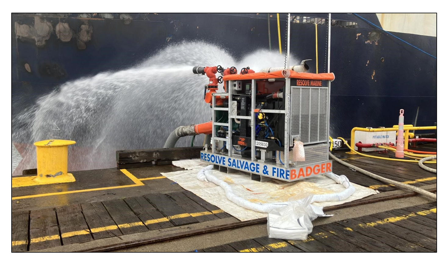
Figure 3 Resolve Fire Pump fired up.