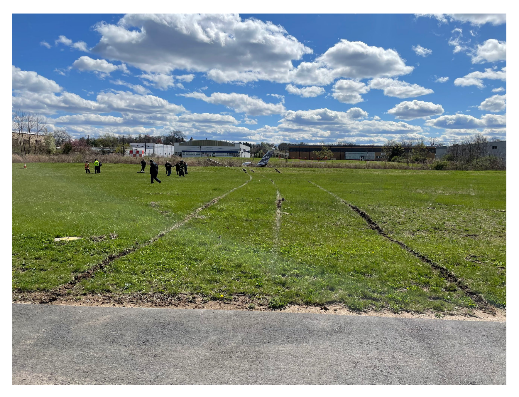
Photo 1 – Photo of skid marks leading off the active runway into a ditch.