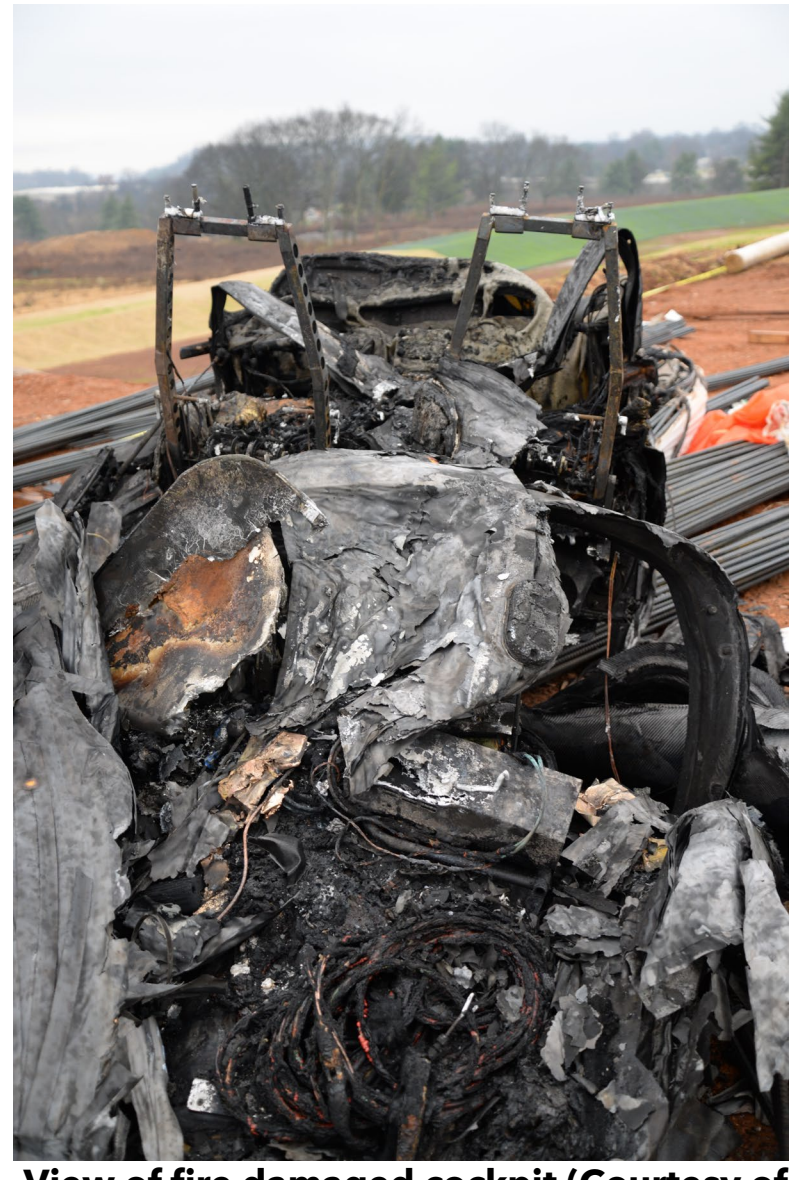
Photograph 5 - View of fire damaged cockpit