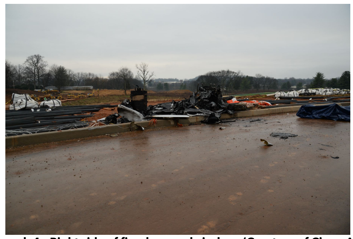
Photograph 4 - Right side of fire damaged airplane