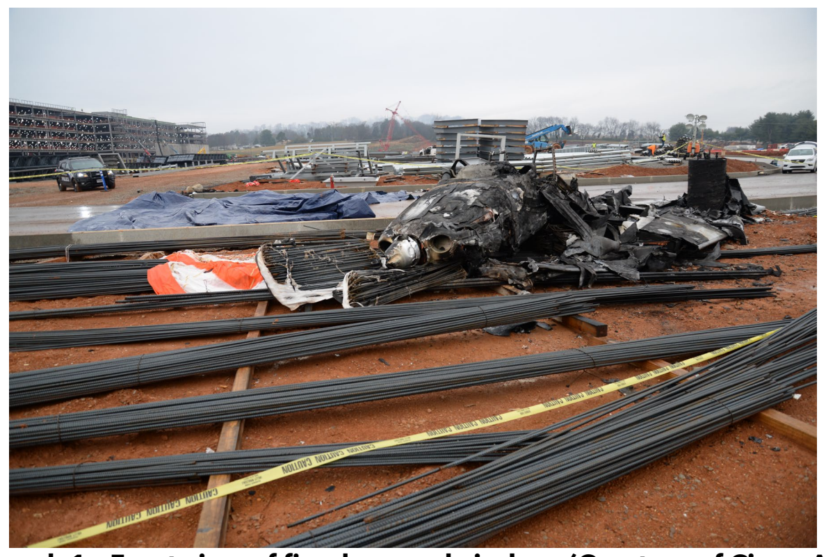
Photograph 1 - Front view of fire damaged airplane