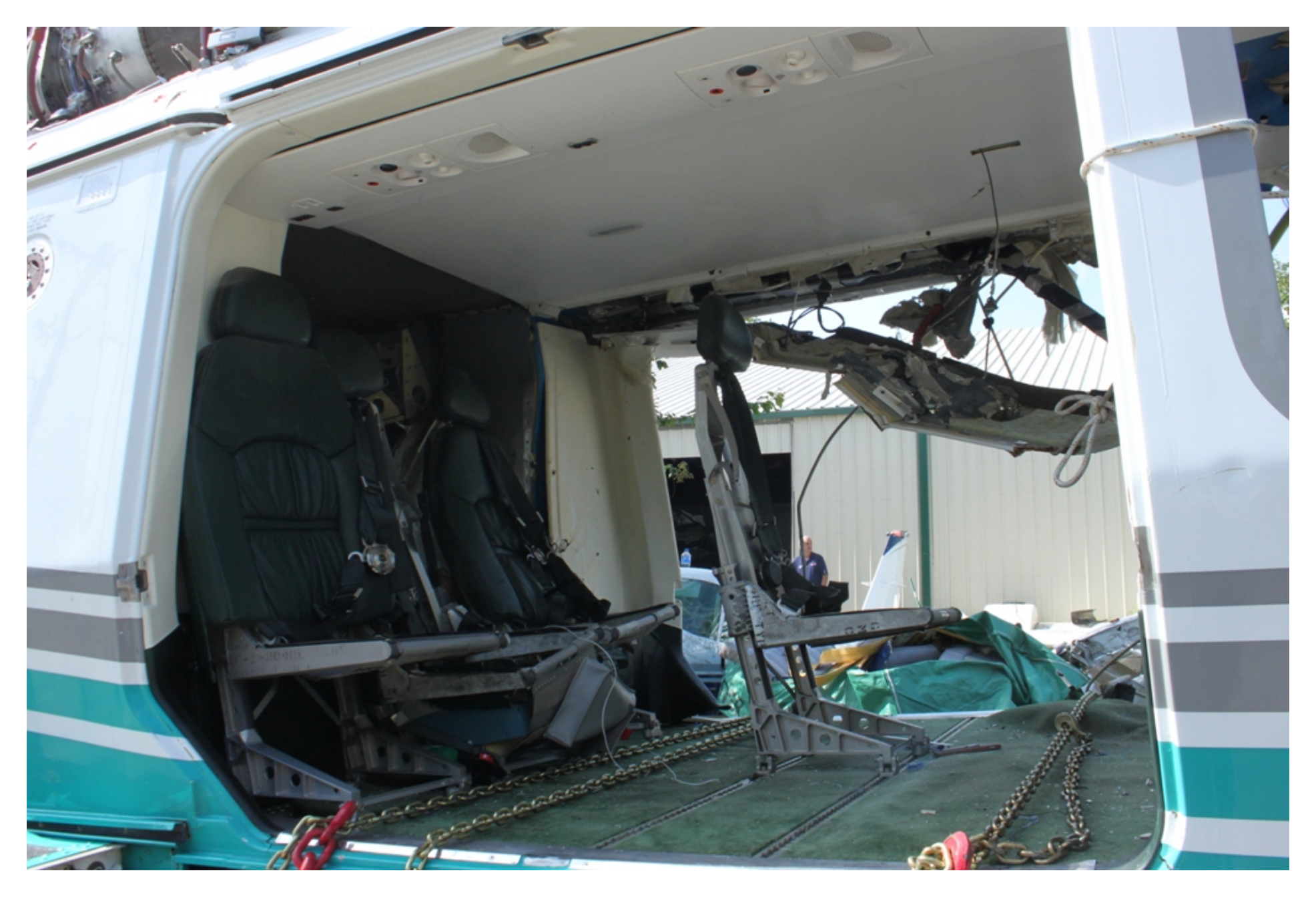
Photo 8 - NTSB Digital Photograph. Right Side View of the Aft Row Seats Remaining Installed Following Recovery.