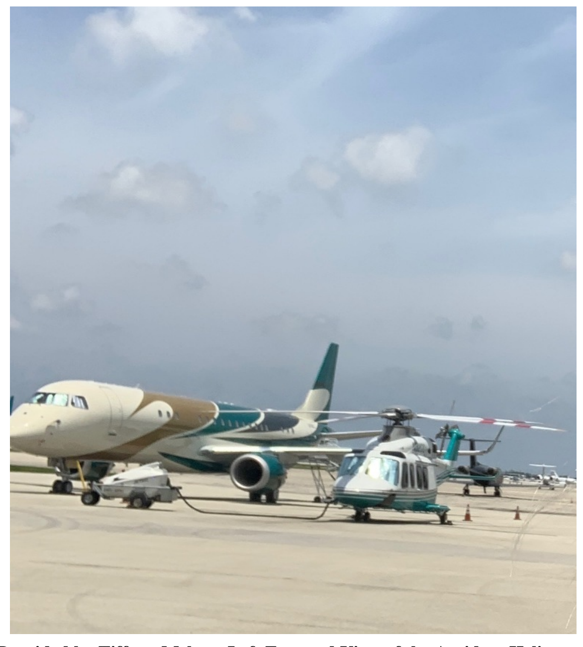
Photo 1 – Left Forward View of the Accident Helicopter Taken July 3, 2019 at 1355 EDT.