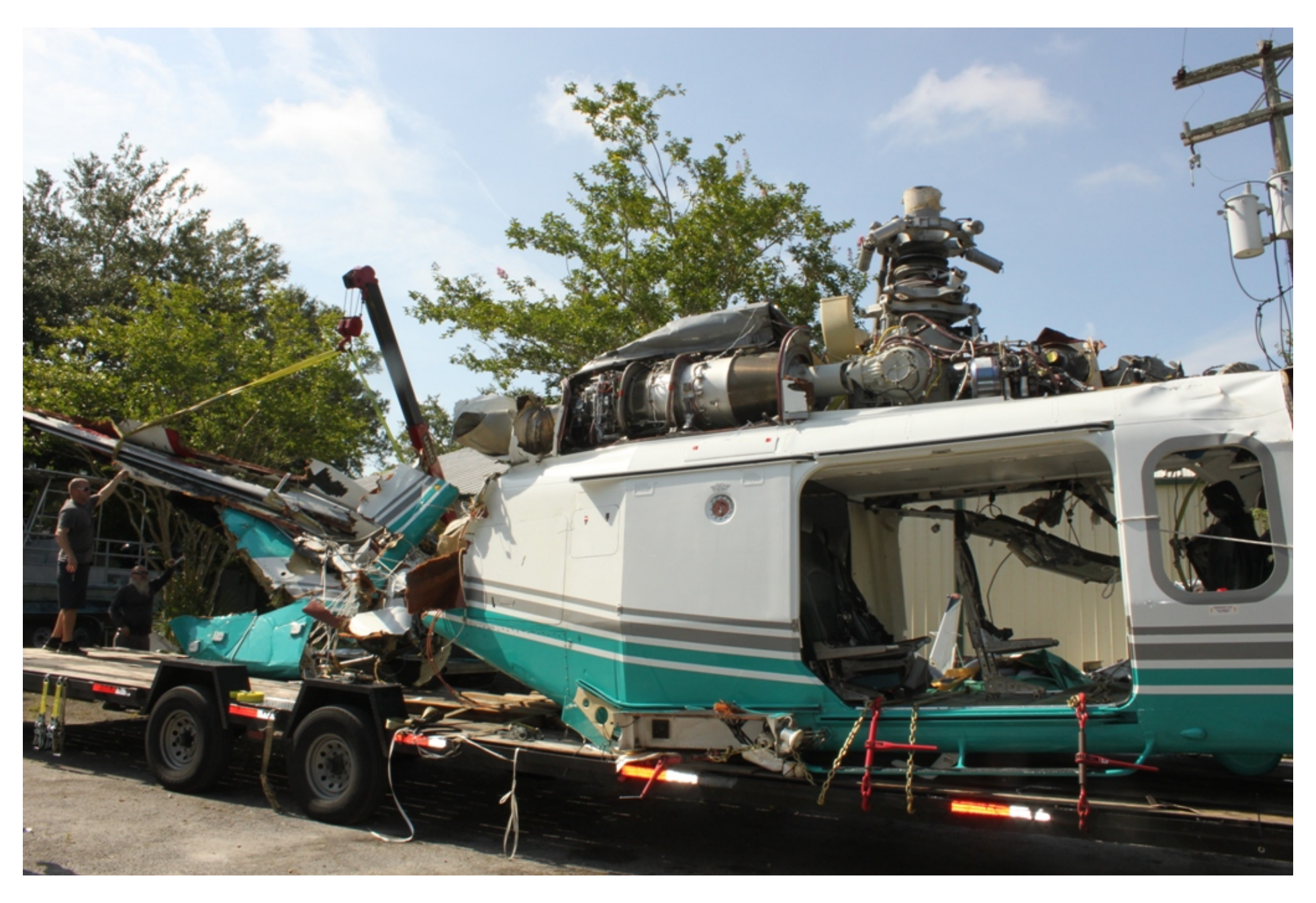
Photo 6 - NTSB Digital Photograph. Right Side View of the Fuselage Following Recovery.