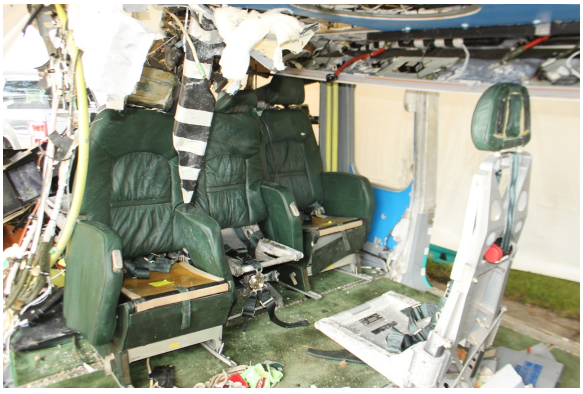
Photo 9 - Left Side View of the Middle Seat and Forward Row Seats Installed Following Recovery.