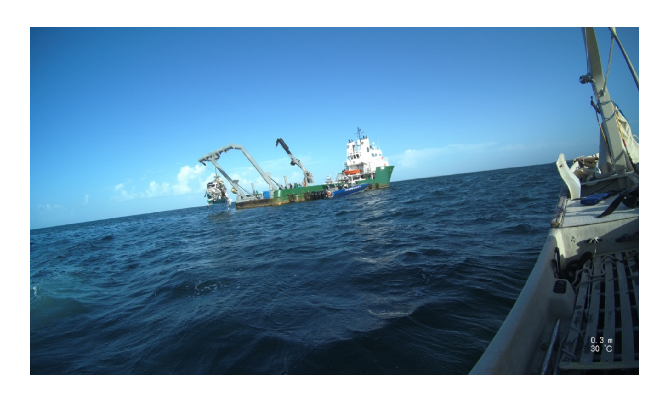
Photo 3 - View Depicting the Fuselage During Recovery.