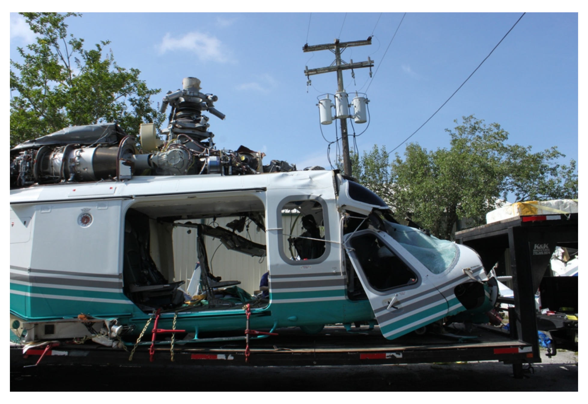
Photo 7 - NTSB Digital Photograph. Right Side View of the Fuselage Following Recovery.