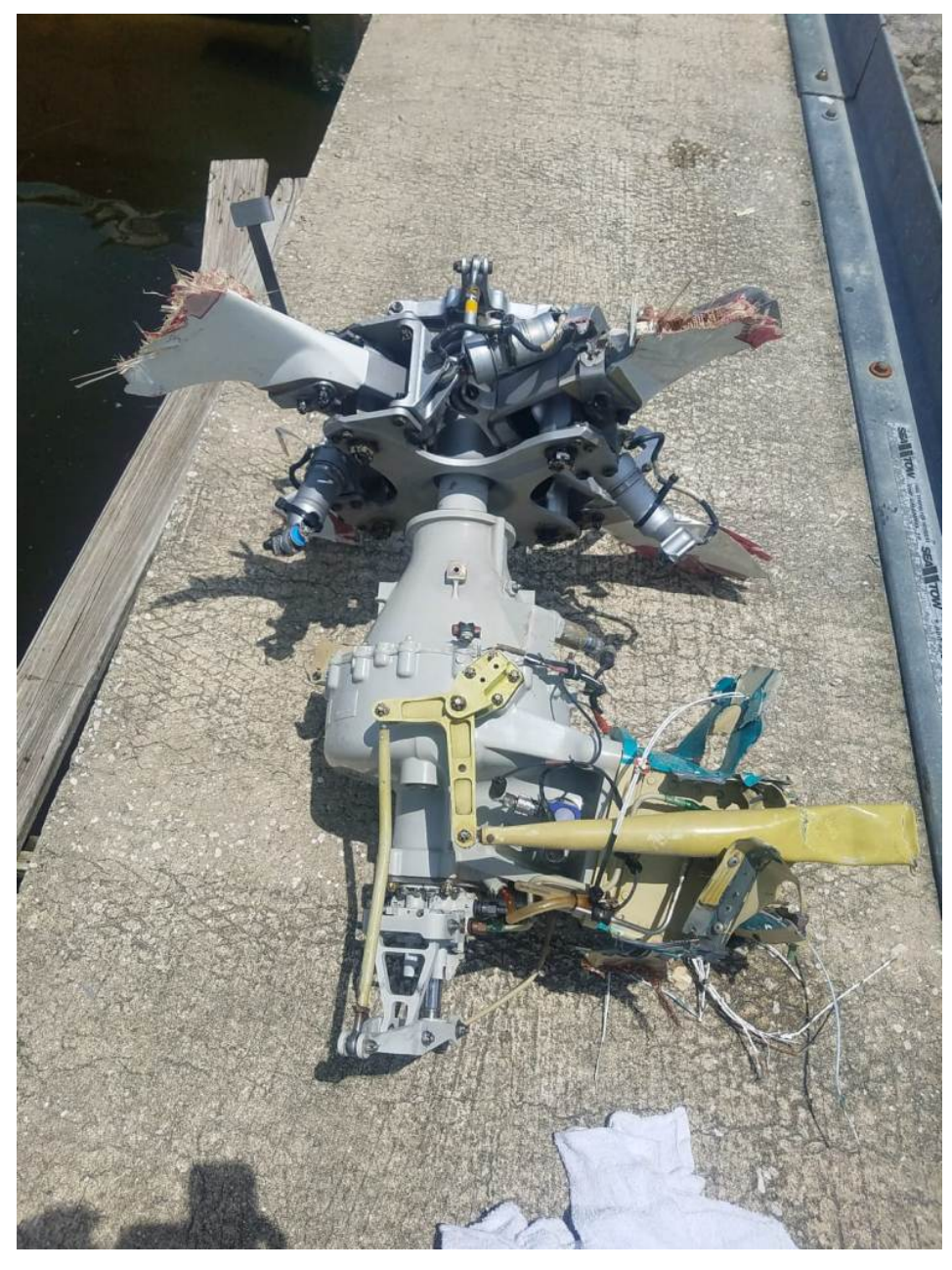
Photo 10 - View of the Recovered Tail Rotor Assembly. Note the Fractured Tail Rotor Blades.