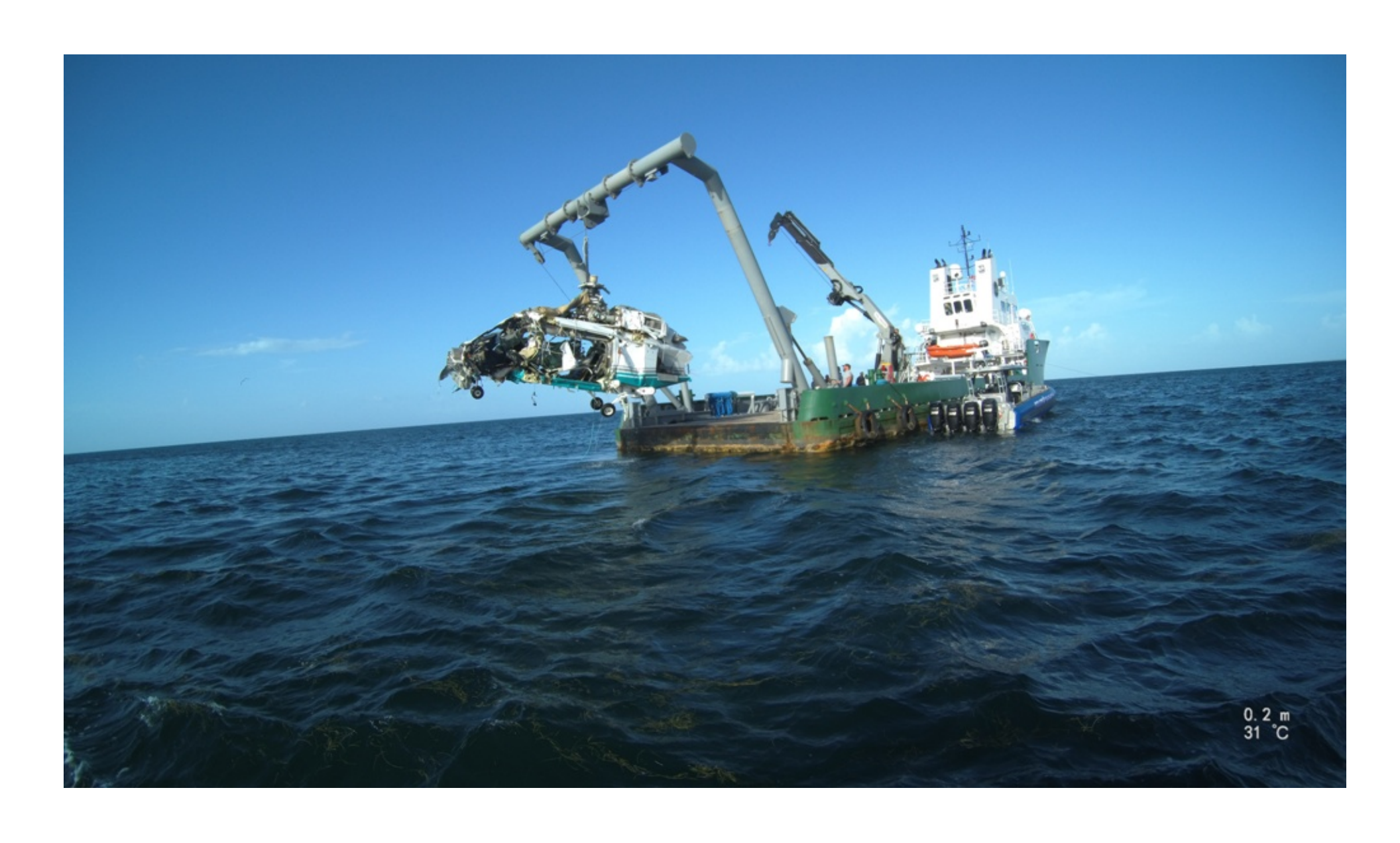
Photo 4 Left Side View of the Fuselage During Recovery.