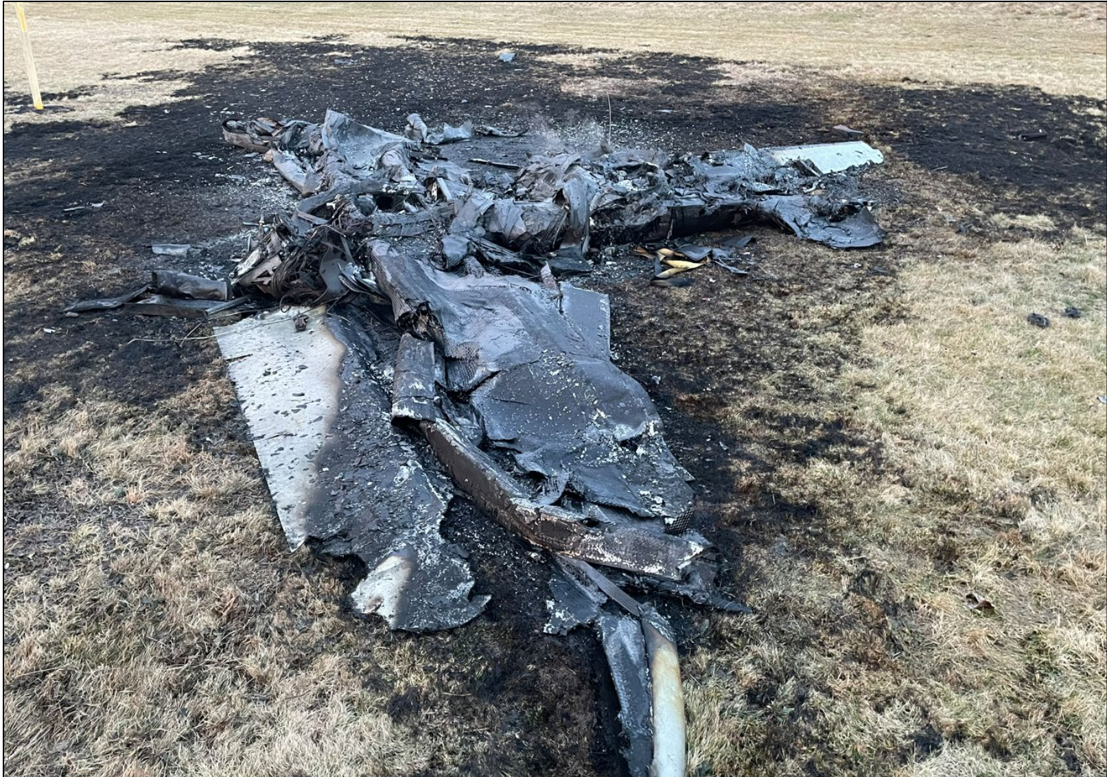
Photograph 4 - View of the thermally damaged fuselage and wings