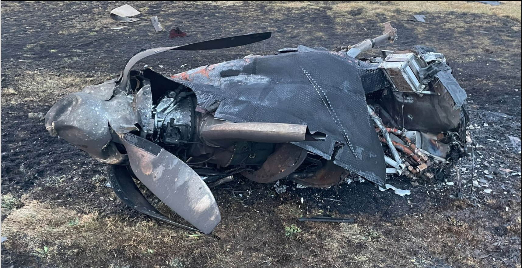
Photograph 3 - View of the engine and propeller