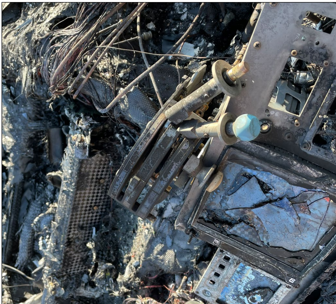
Photograph 6 - View of the throttle quadrant