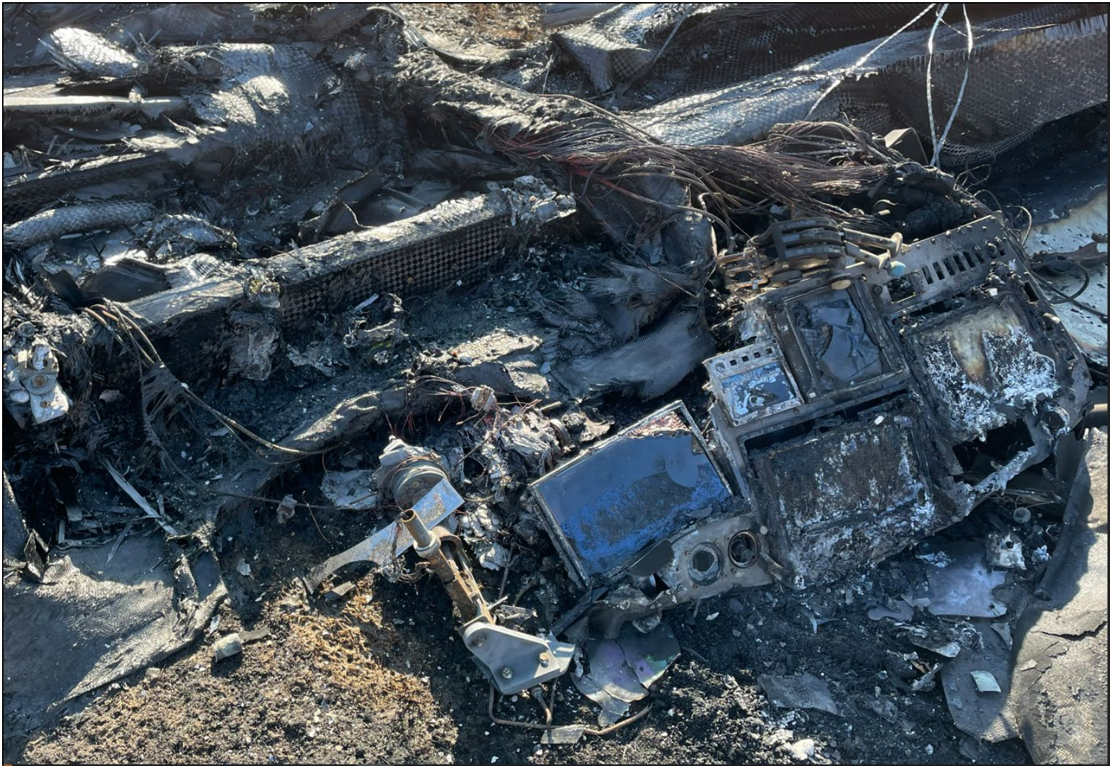
Photograph 5 - View of the thermally damaged cockpit panel