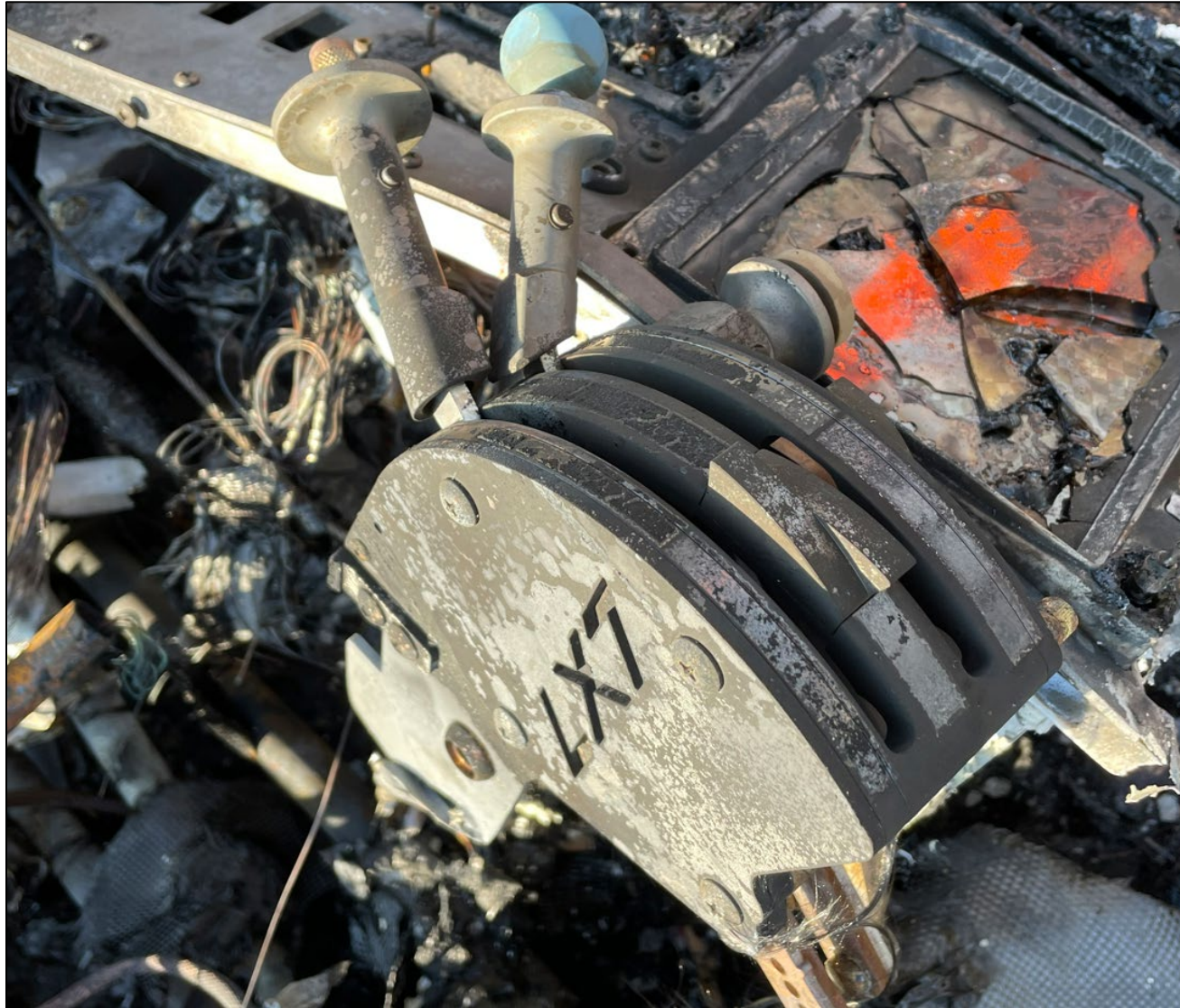
Photograph 7 - Additional view of the throttle quadrant