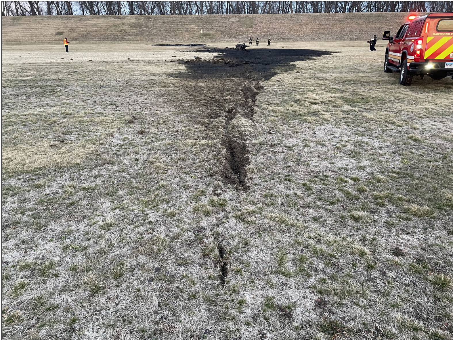
Photograph 1 - View of the accident site