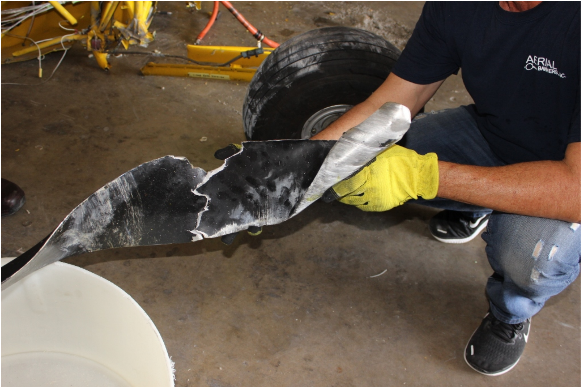
Photo 12 - NTSB Digital Photograph. View of the Fractured Propeller Blade. Note the Heavy, Course Chordwise Scratches and Curling.