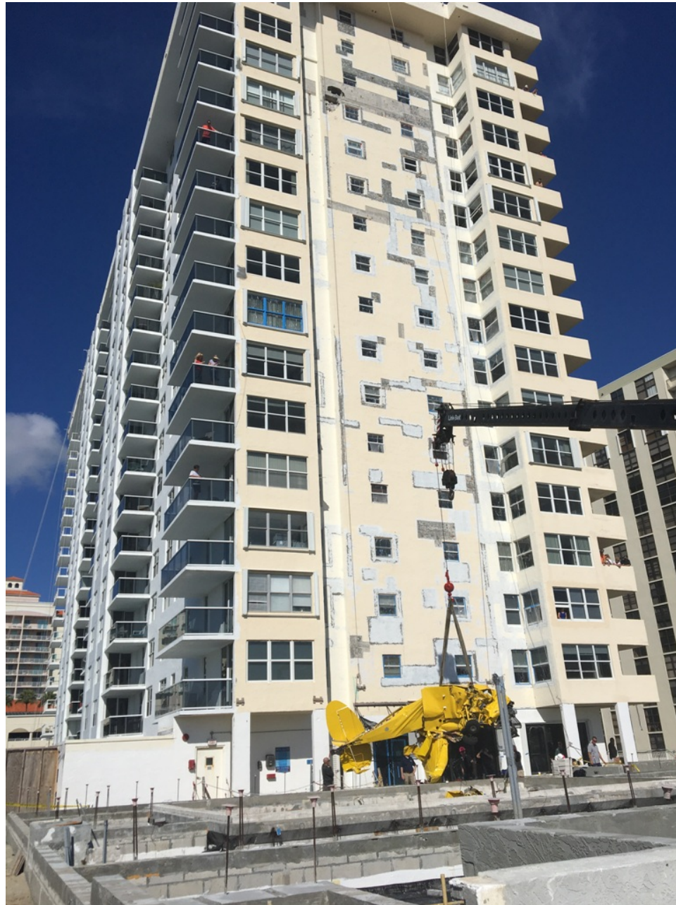
Photo 8 - NTSB Digital Photograph. View of the Airplane During Recovery.