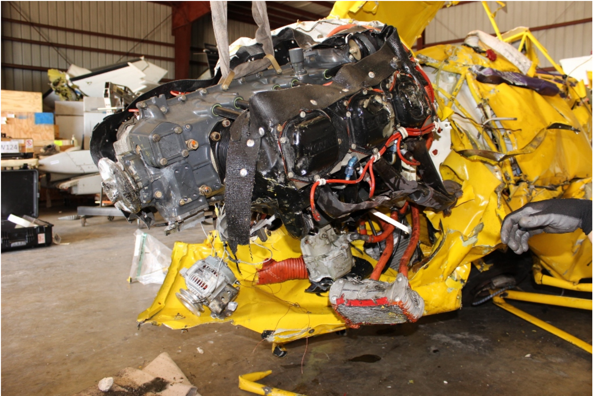
Photo 9 - NTSB Digital Photograph. View of the Left Side of the Engine Assembly.