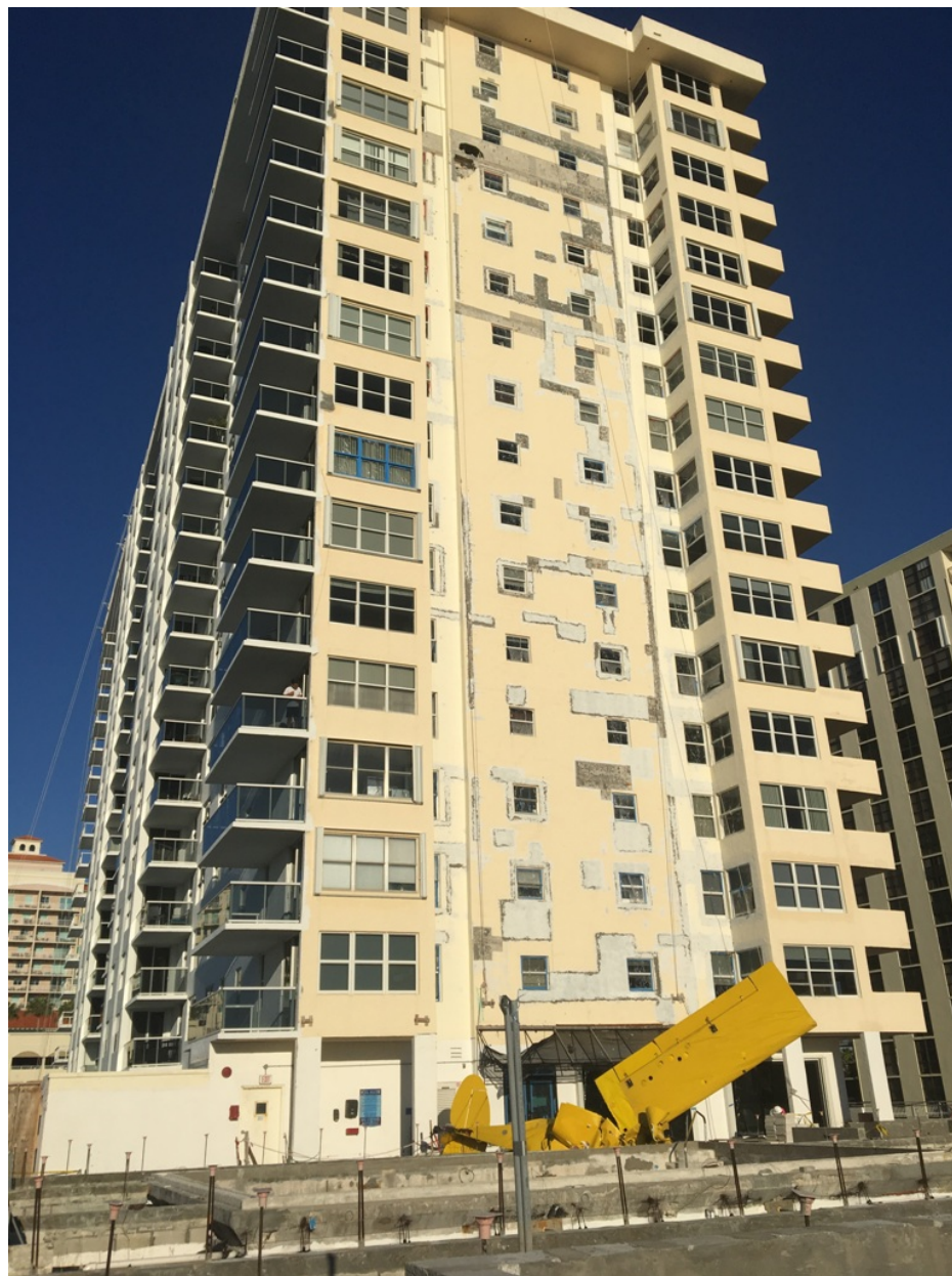
Photo 1 – NTSB Digital Photograph. View of the As-Found Position of the Airplane Adjacent to the Impacted Building.