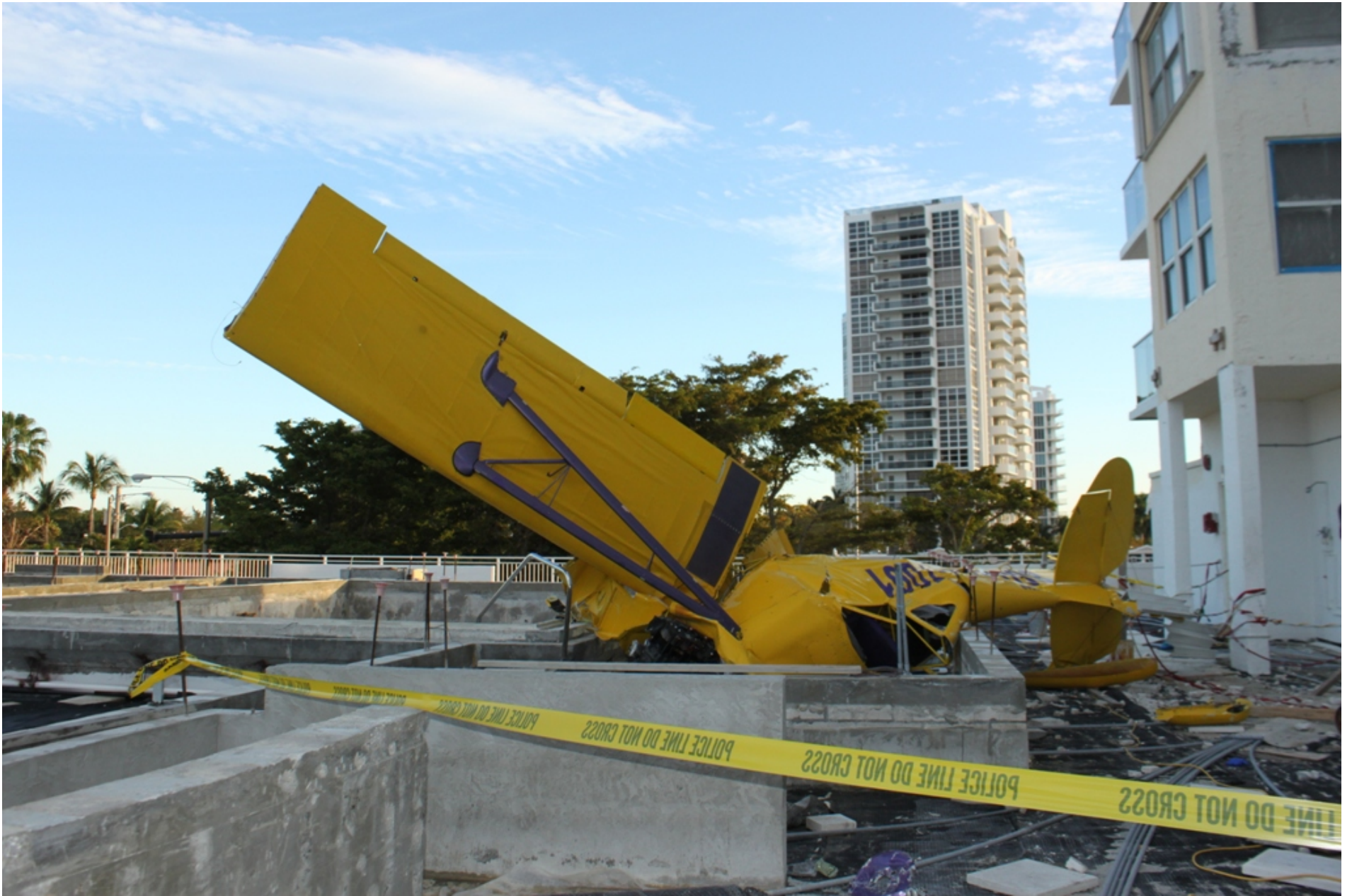
Photo 5 - NTSB Digital Photograph. View of the Resting Position of the Airplane Where it Came to Rest.