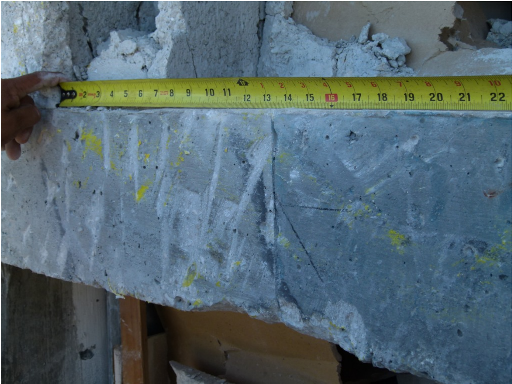
Photo 4 – Digital Photograph From SRI Consultants, Inc. View Depicting Gouges on the East Face of the Impacted Building.