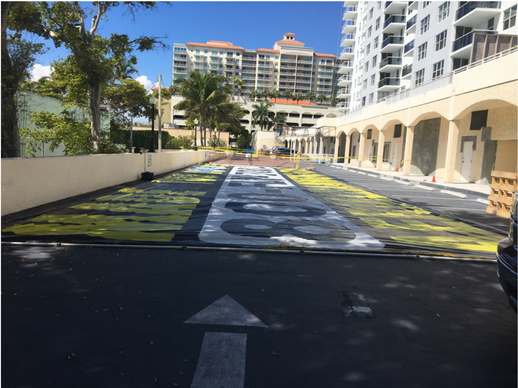
Photo 7 - View of the Banner Assembly.