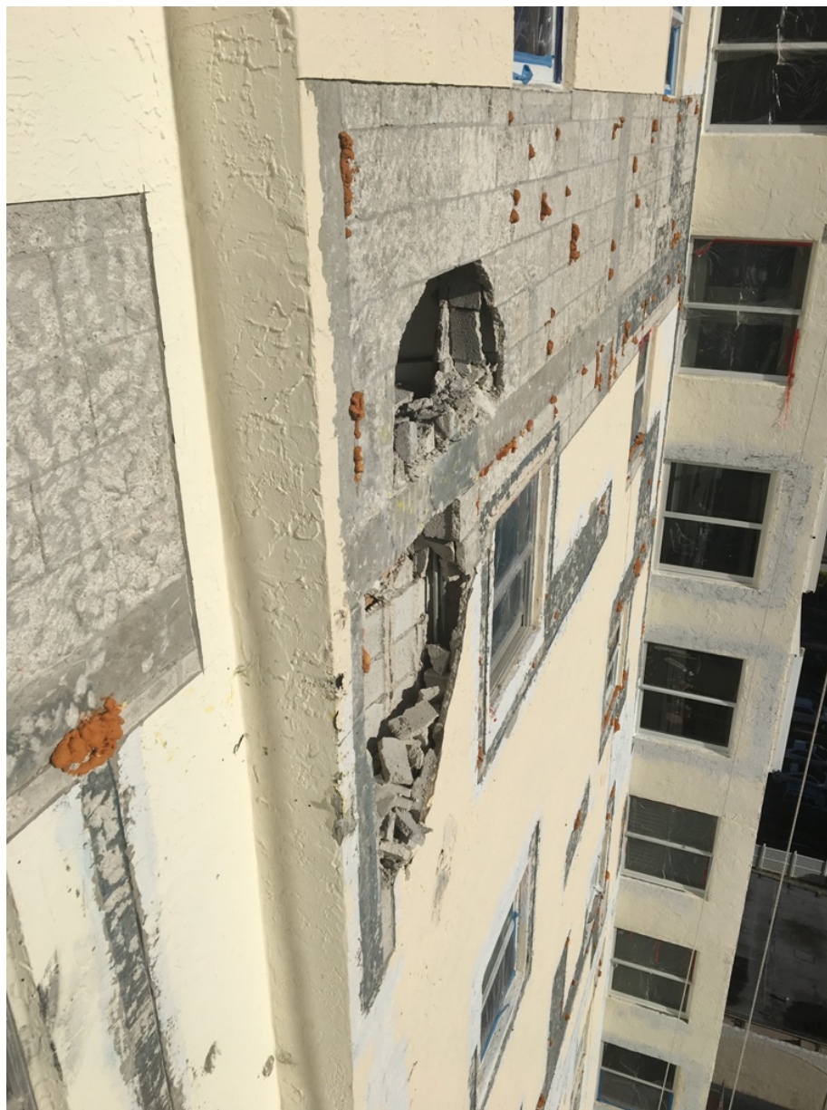
Photo 3 - NTSB Digital Photograph. View of the Damage to the East Face of the Impacted Building.