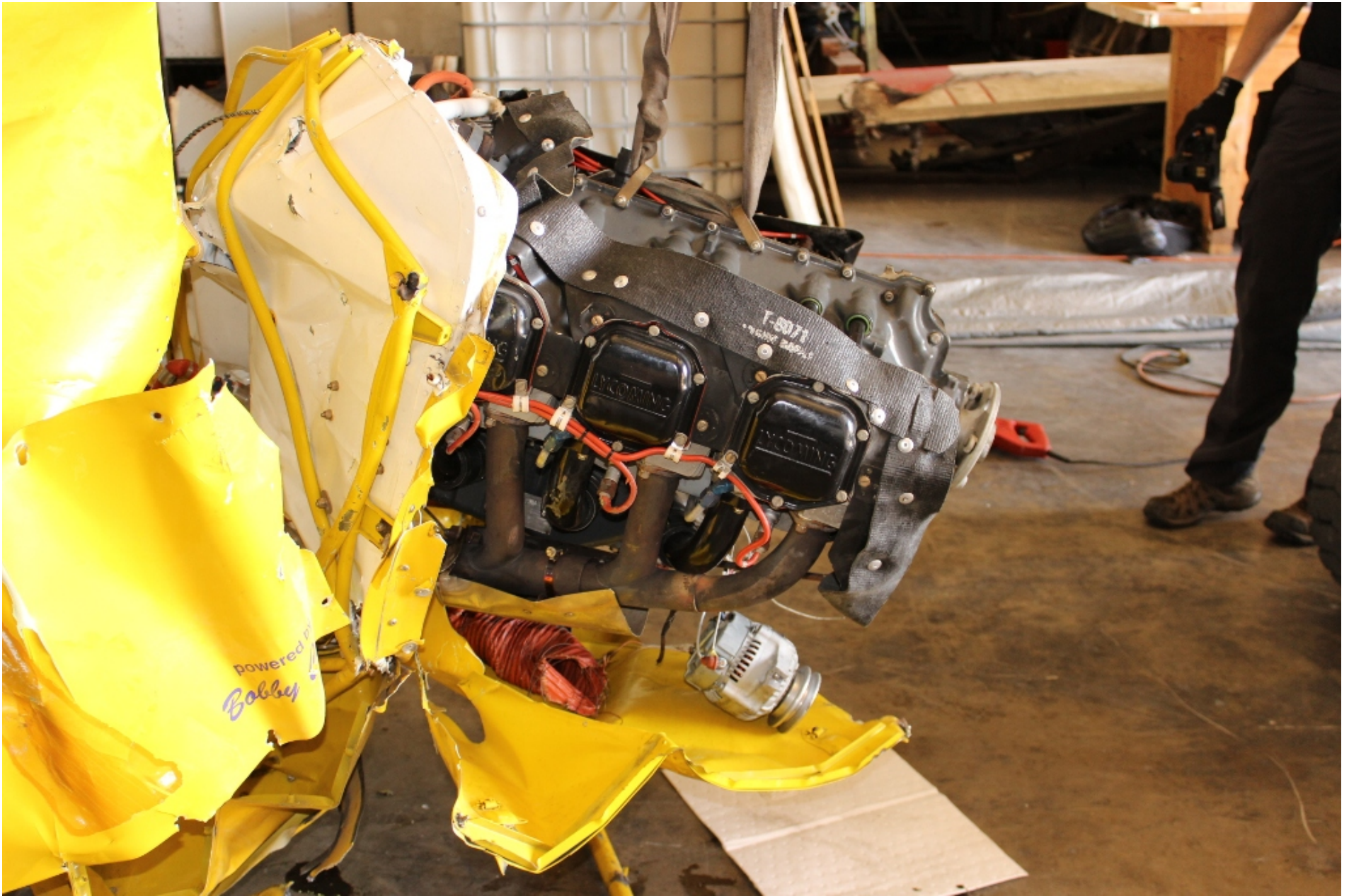
Photo 10 - NTSB Digital Photograph. View of the Right Side of the Engine Assembly.