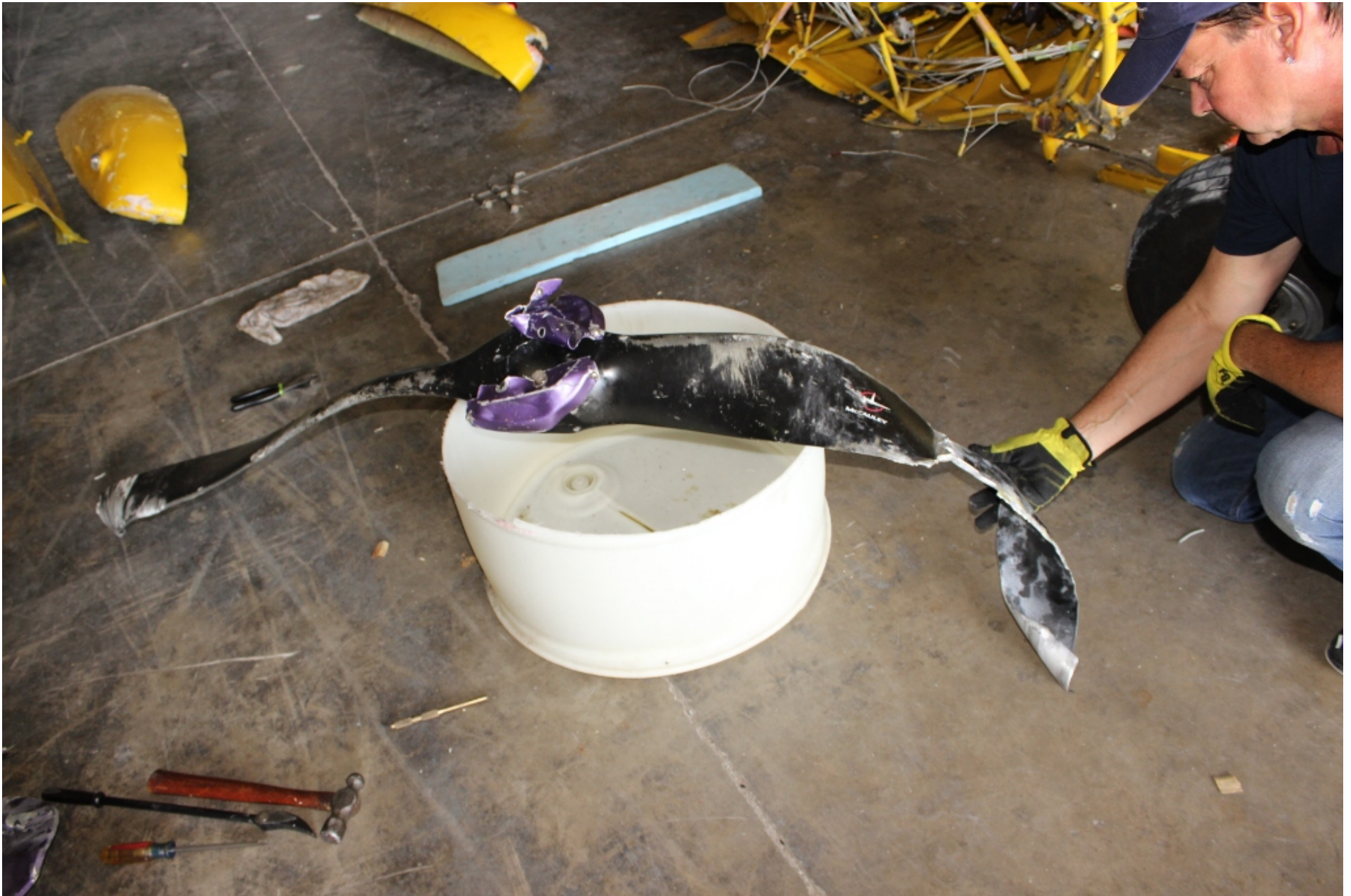
Photo 11 - View of the Propeller Assembly. Note the Placement of the Fractured Propeller Blade.