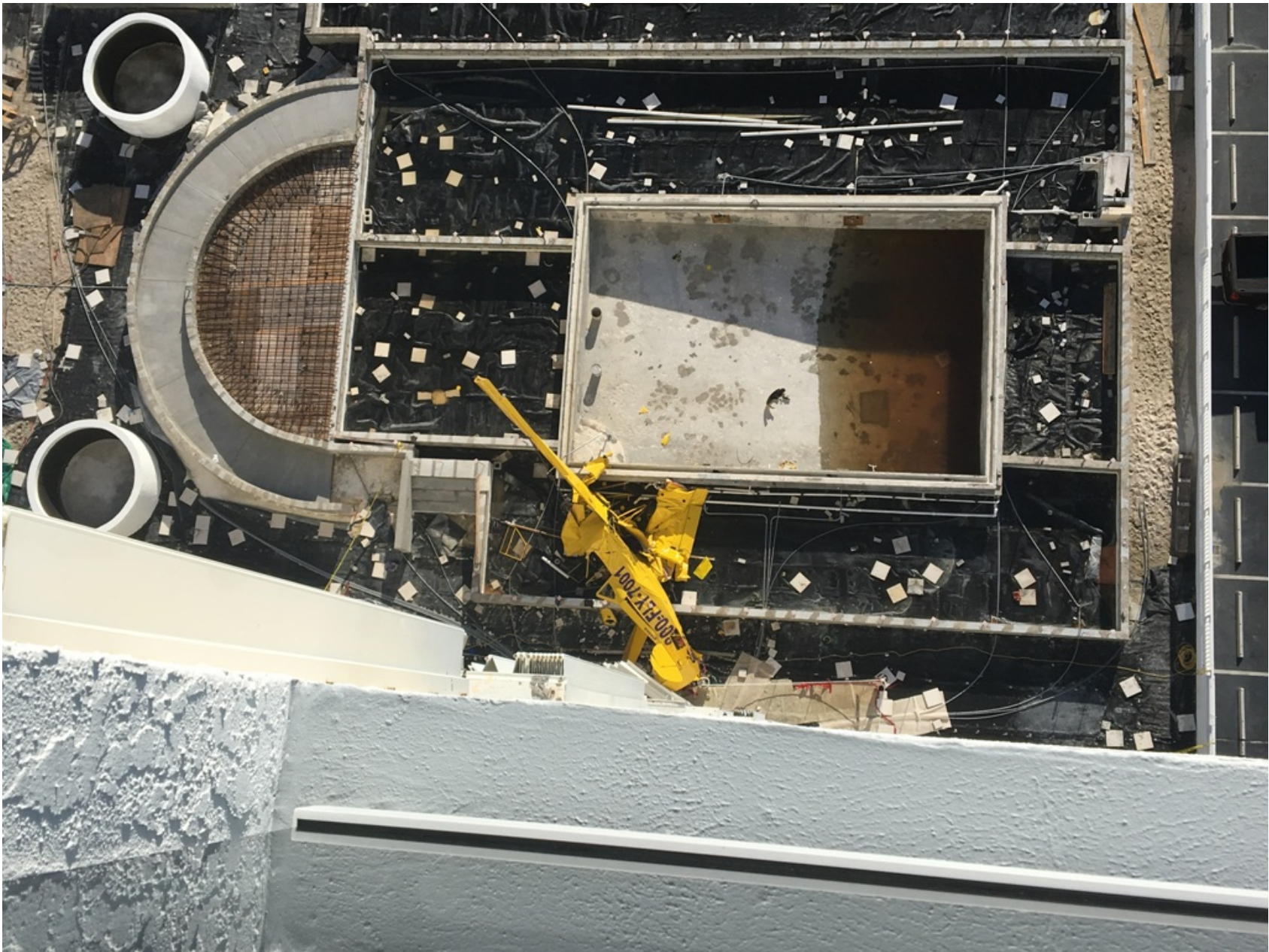
Photo 2 - NTSB Digital Photograph. View of the Airplane From One of the Impacted Units.