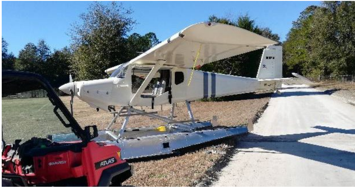
Photograph 1 1 – Accident airplane – left side view.

Peter Wentz Air Safety Investigator Eastern Region Aviation