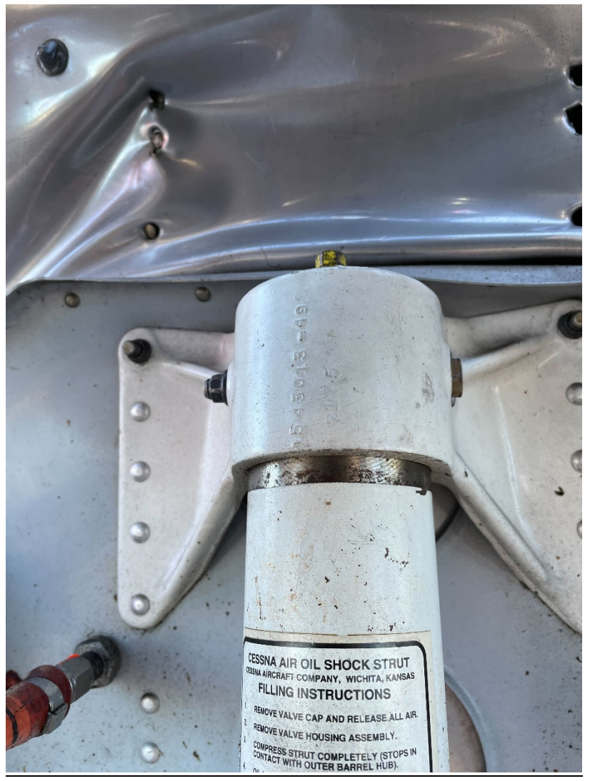
Photograph 1 – Accident airplane – Firewall damage.