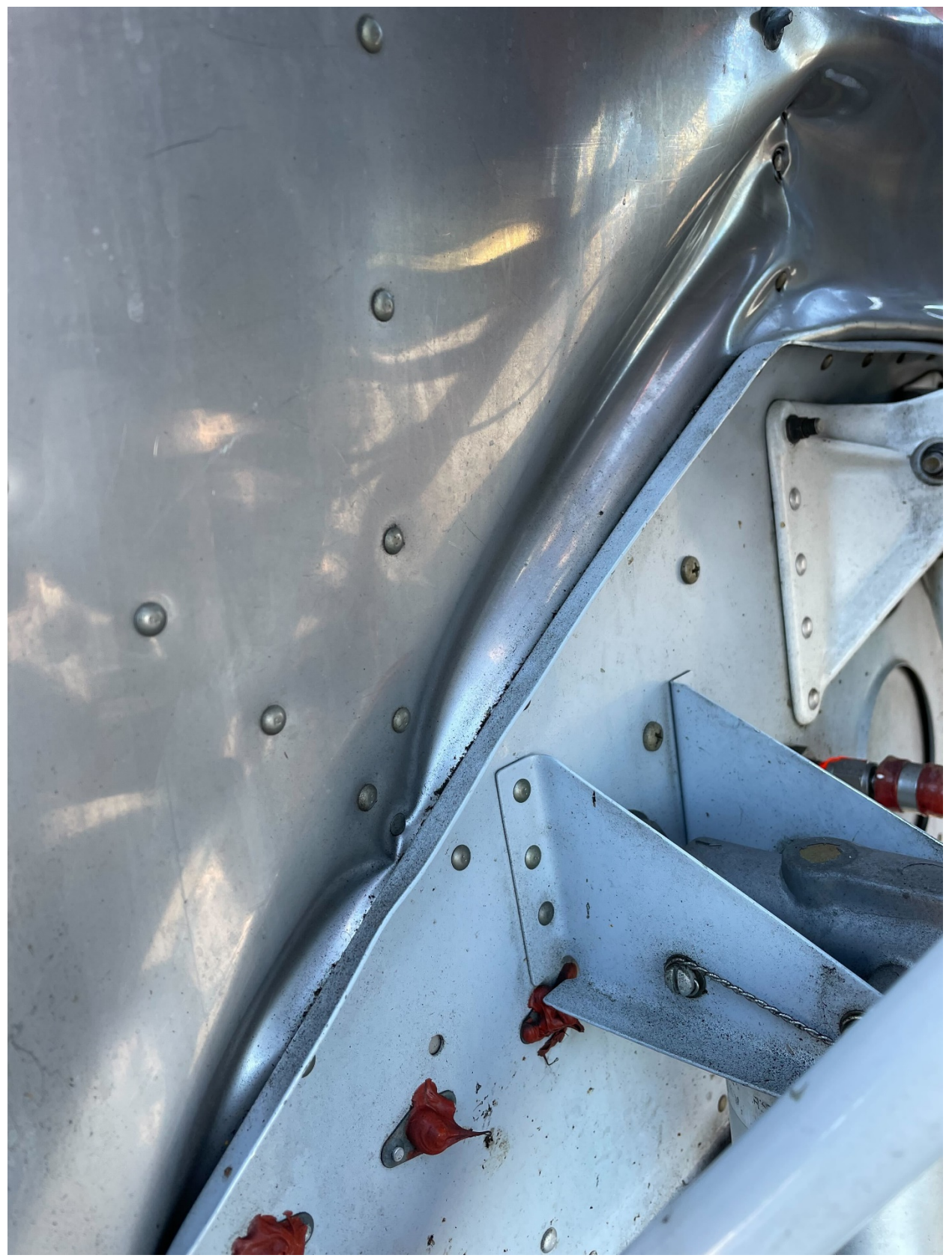
Photograph 3 – Accident airplane – Firewall damage.