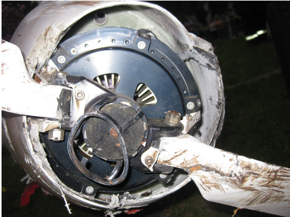
Photograph 3 3 – Damaged propeller.