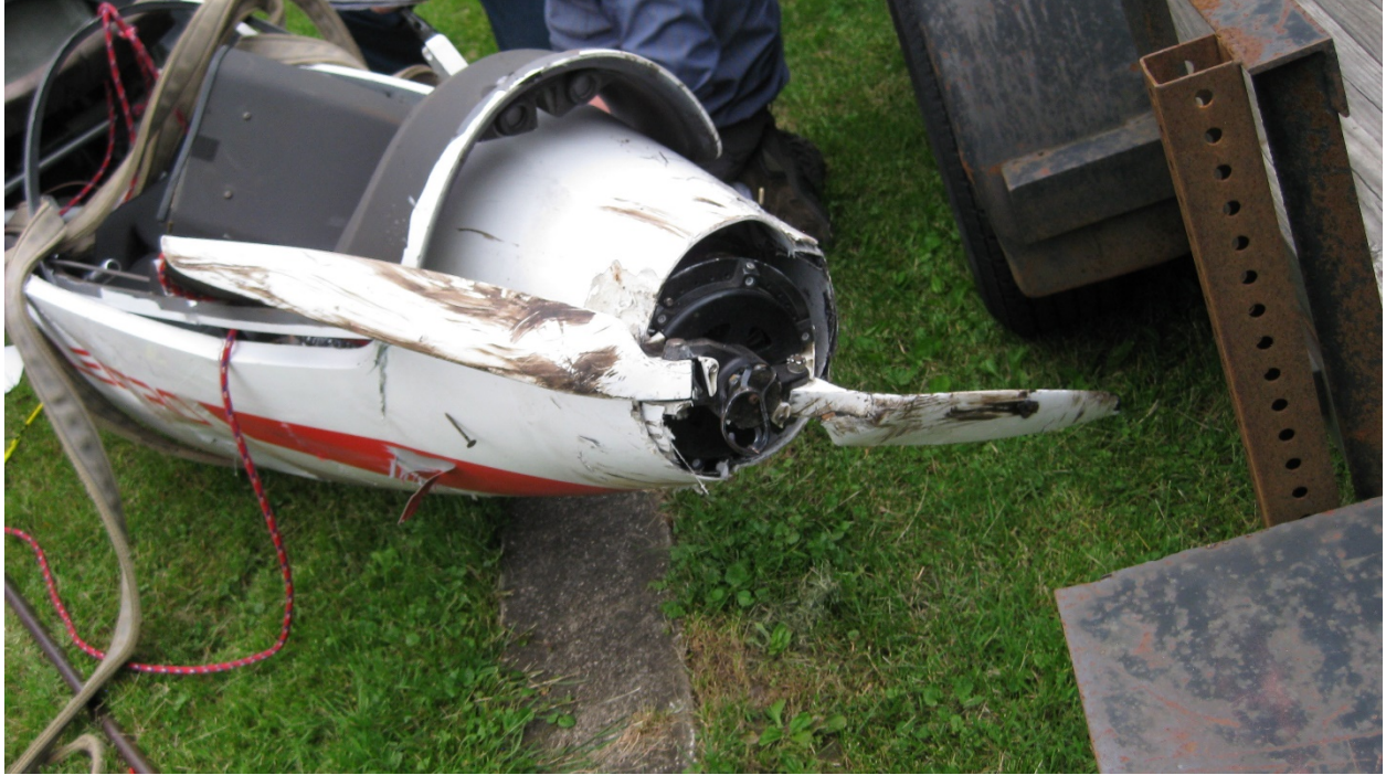
Photograph 2 2 – Damaged nose and propeller.