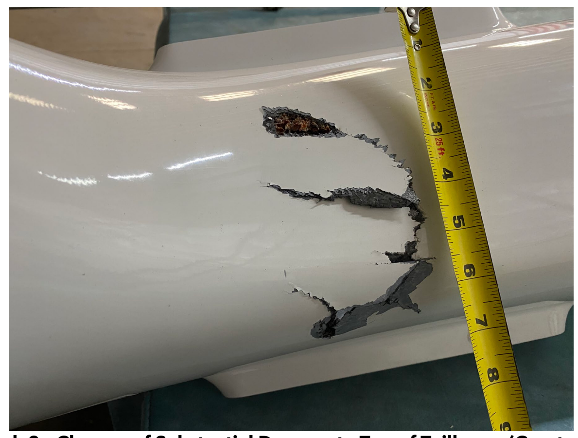
Photograph 3 - Closeup of Substantial Damage to Top of Tailboom