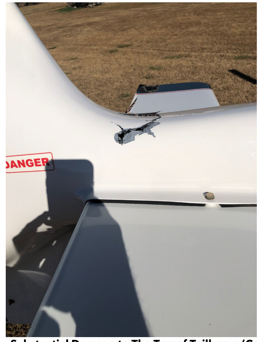
Photograph 2 - Substantial Damage to The Top of Tailboom