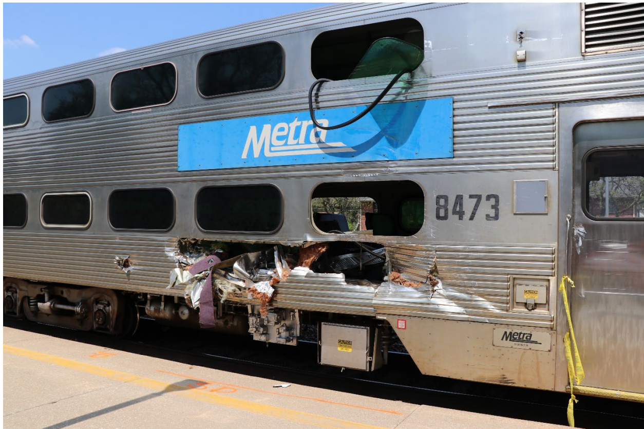
Figure 5. Exterior damage to the lower-level seating area of the right side of the commuter train's lead cab car. The upper level also sustained window damage.

The truck came to rest in a parking area near the grade crossing and was then engulfed in a postcrash fire. The fire consumed the electrical system of the truck, including the engine control module (ECM). Figure 6 shows the box truck at final rest.