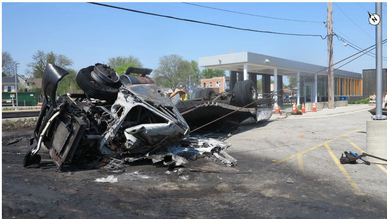
Figure 6. View, facing to the northeast, of the box truck at final rest.

At 8:17 a.m., the first emergency response units were observed arriving on scene near the intersection of South Prospect Avenue and Ann Street. Fire units were dispatched at 8:18 a.m. and the first fire truck was observed in security camera footage arriving at 8:20 a.m. One train passenger seated adjacent to the sidewall where the rear of the box truck struck the train car was fatally injured. This passenger was seated in the lead cab car on the lower level near the sidewall where the truck impacted the cab car. Physical evidence indicated that the truck impact on the cab car sidewall subsequently projected this passenger across the train car and the passenger was then ejected through a train window on the opposite side from the truck impact, coming to rest on the ground on the north side of the train car. Two other train passengers located on the upper level of the cab car and two crew members sustained minor injuries. The truck driver and two truck passengers were not injured.