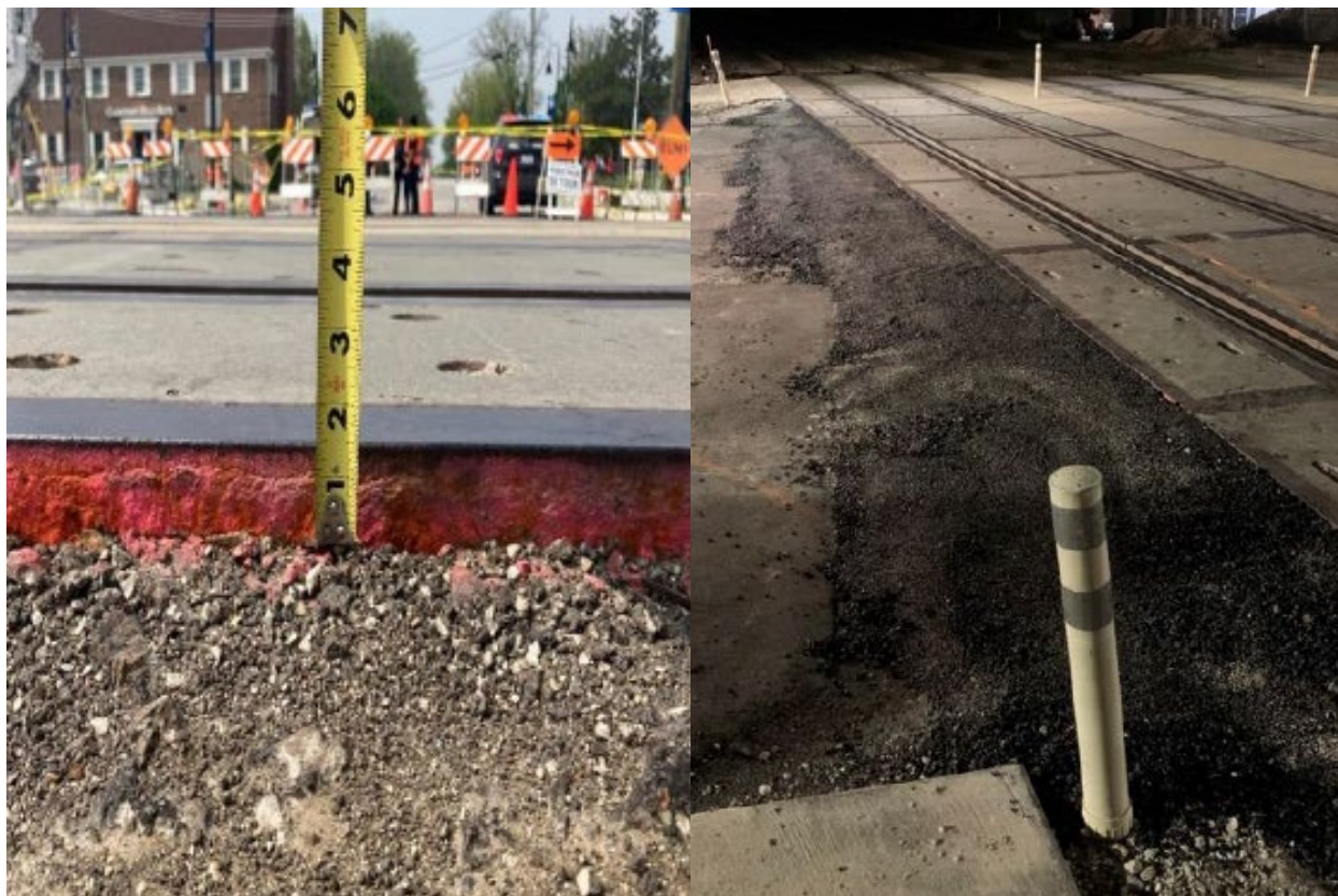
Figure 7. Image of the drop-off at the south end of the grade crossing before the crash with tape measure (left) and a temporary tapered joint installed on May 13, 2022 (right).