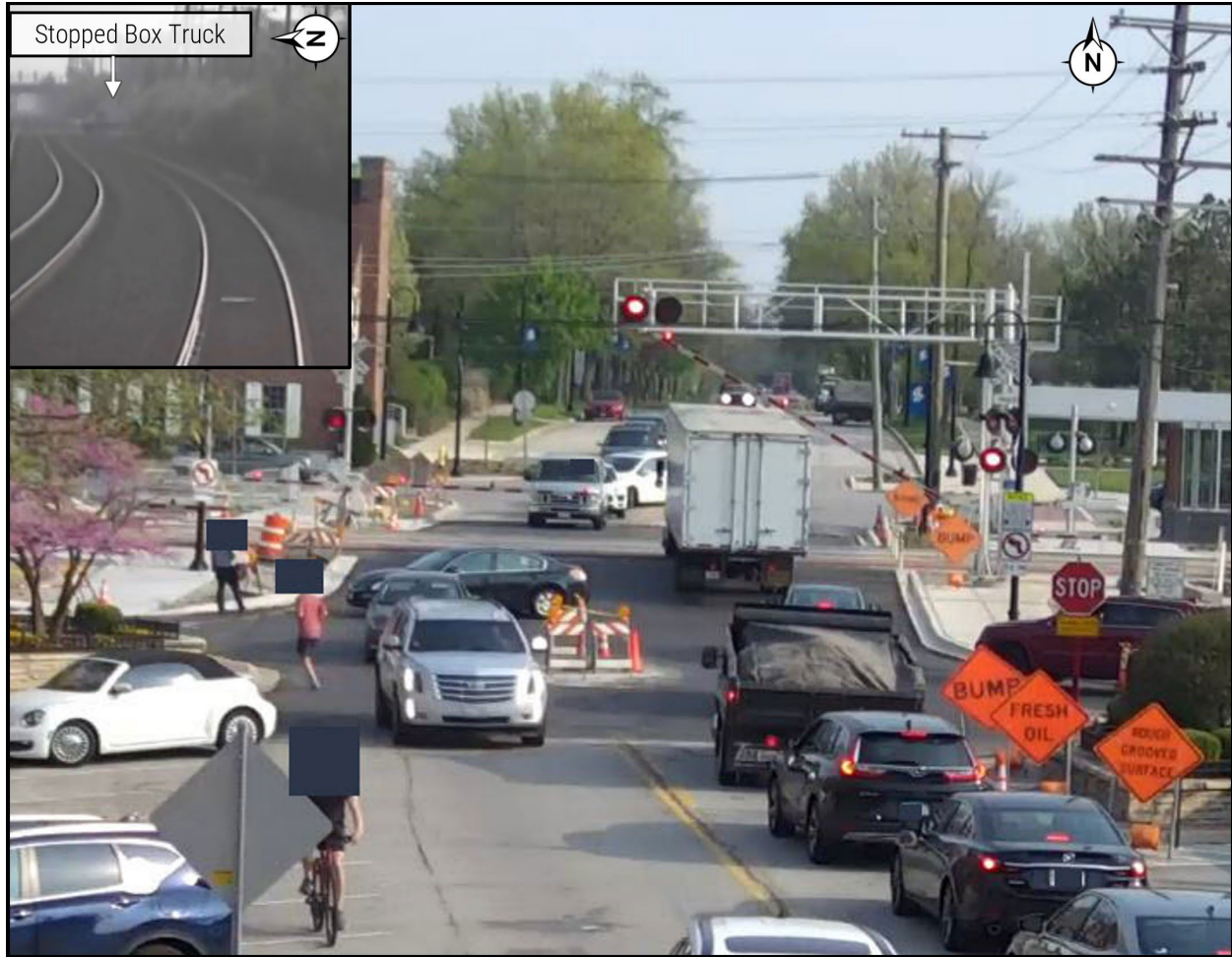
Figure 1. Synchronized images from the north-facing security camera at the Prospect Avenue grade crossing (Source: Village of Clarendon Hills, redacted by NTSB), and the forward camera from the eastbound commuter train on track #3 (Inset, Source: METRA, annotation by NTSB). At the time of these images, the box truck was stopped on the tracks with the occupants still inside the truck. The active crossing warning system was activated, and the gate arm struck the top of the box truck. As shown in the inset, traffic in front of the box truck was clear of the tracks.