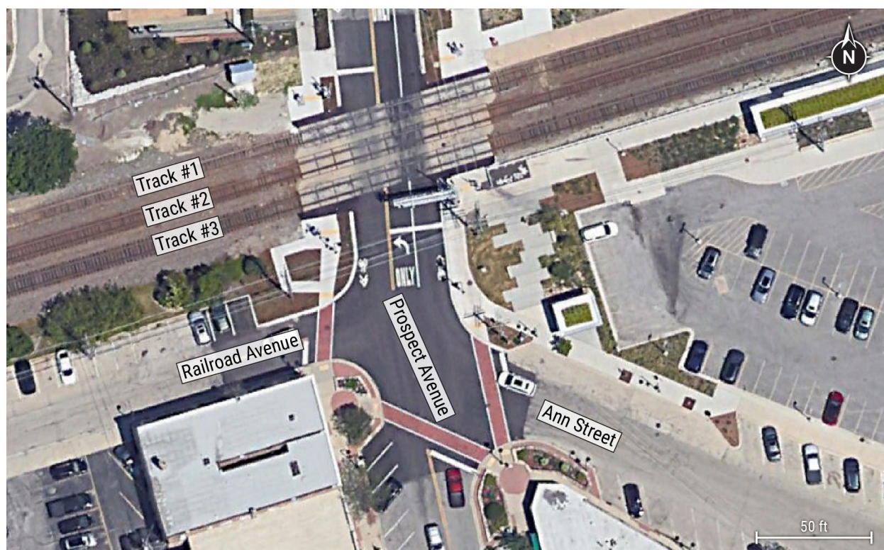
Figure 3. Overhead view of the Prospect Avenue grade crossing with side streets and track numbers annotated.

At the grade crossing, Prospect Avenue consisted of one northbound dedicated left-turn lane, one northbound through lane, and one southbound travel lane. The grade crossing consisted of three BNSF Railway (BNSF) tracks and the three lanes of Prospect Avenue (Figure 3). The roadway grade leading up to the south end of the grade crossing was approximately a 6% upward grade.