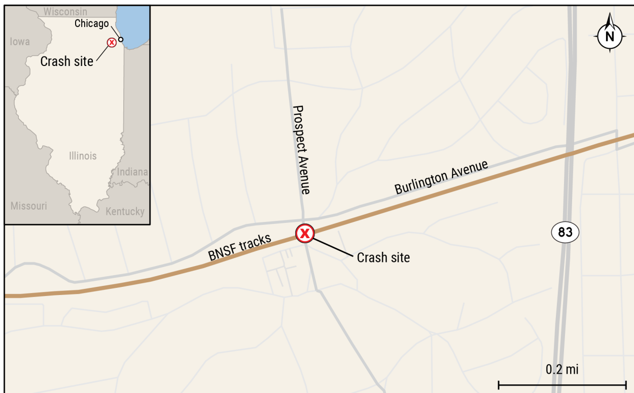
Figure 2. Map showing the crash location in Clarendon Hills, Illinois.