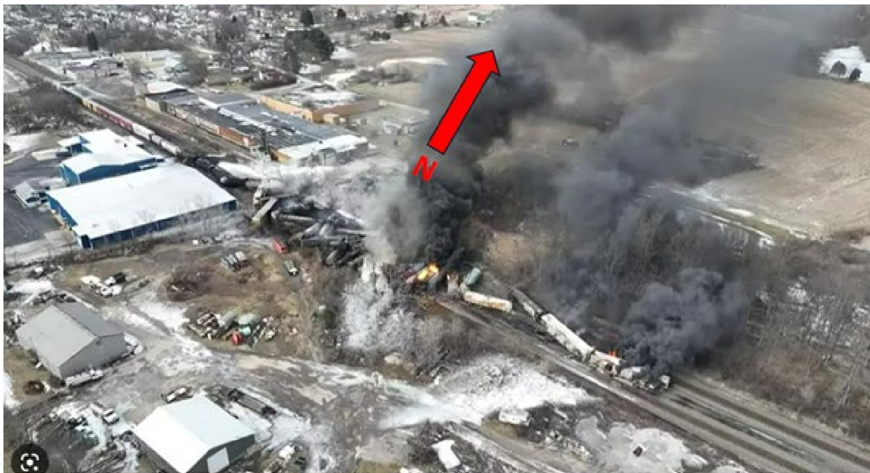
Cars 26-29; 53 Placement of Vinyl chloride Cars