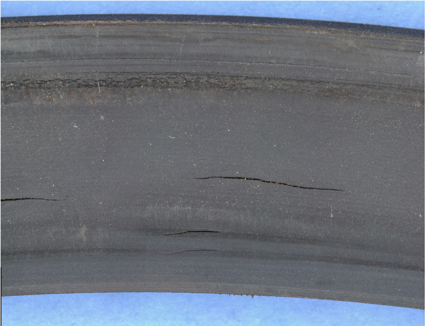
Figure 4. Closeup photograph of surface of exemplar gasket (HMD22LR001-HAZ-005 taken from TILX731779 (line 37))