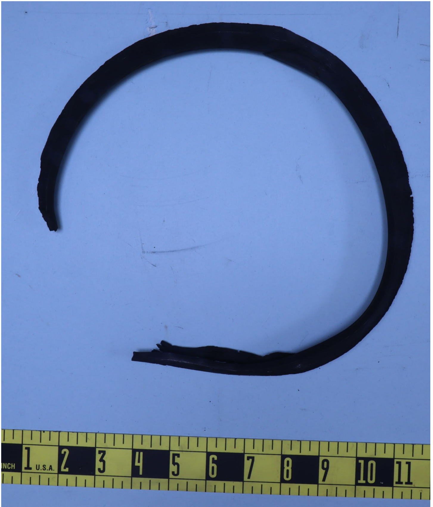
Figure 2. Damaged gasket (HMD22LR001-HAZ-004 taken from TILX731758 (line 65))