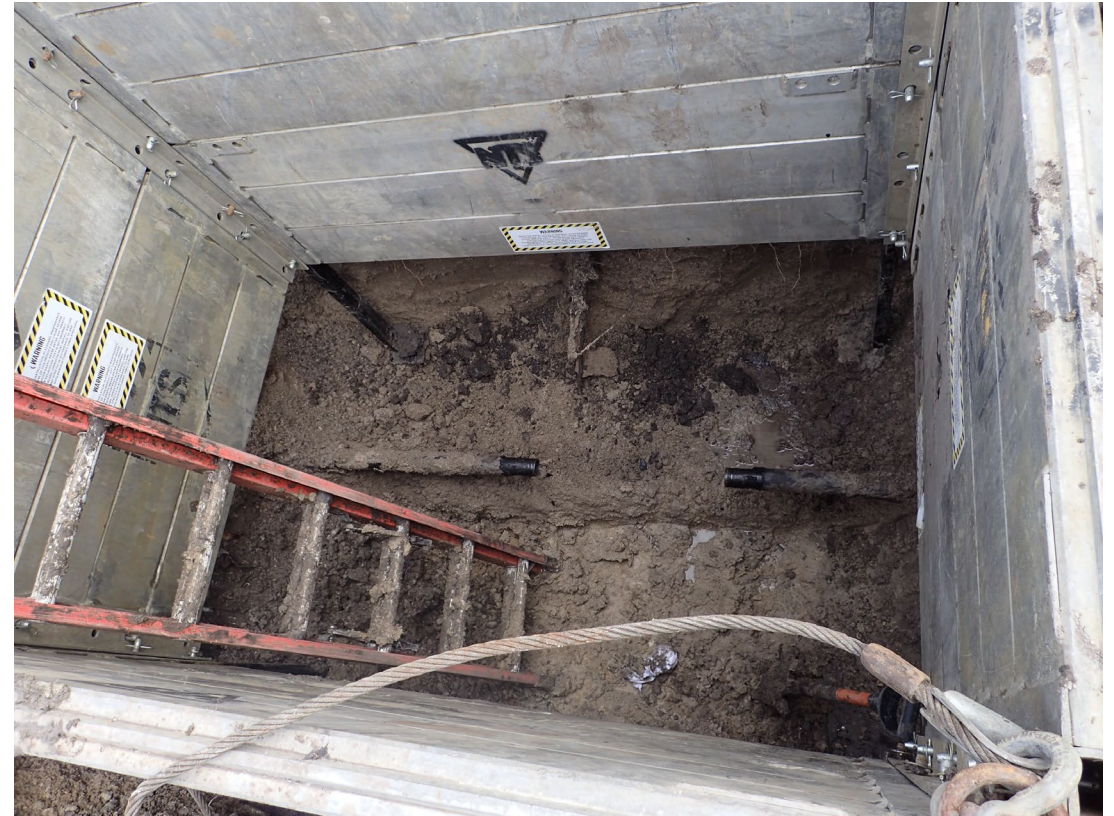
Gas main cut and capped at east end of alley