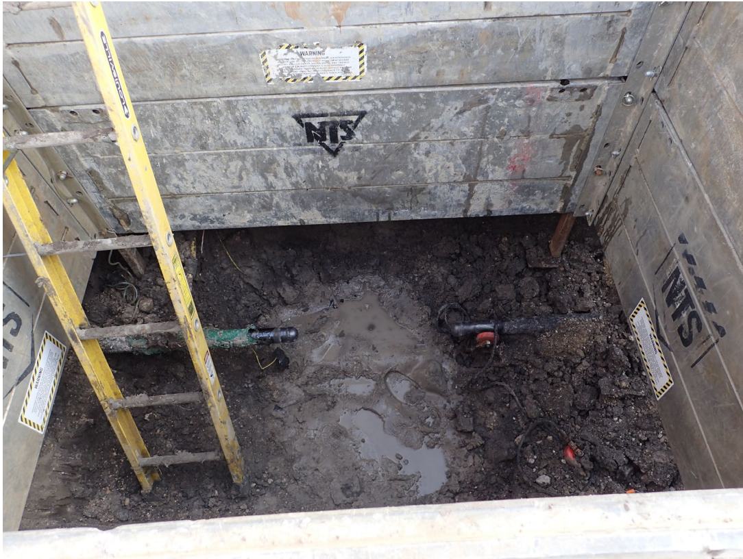
Gas main cut and capped at west end of alley