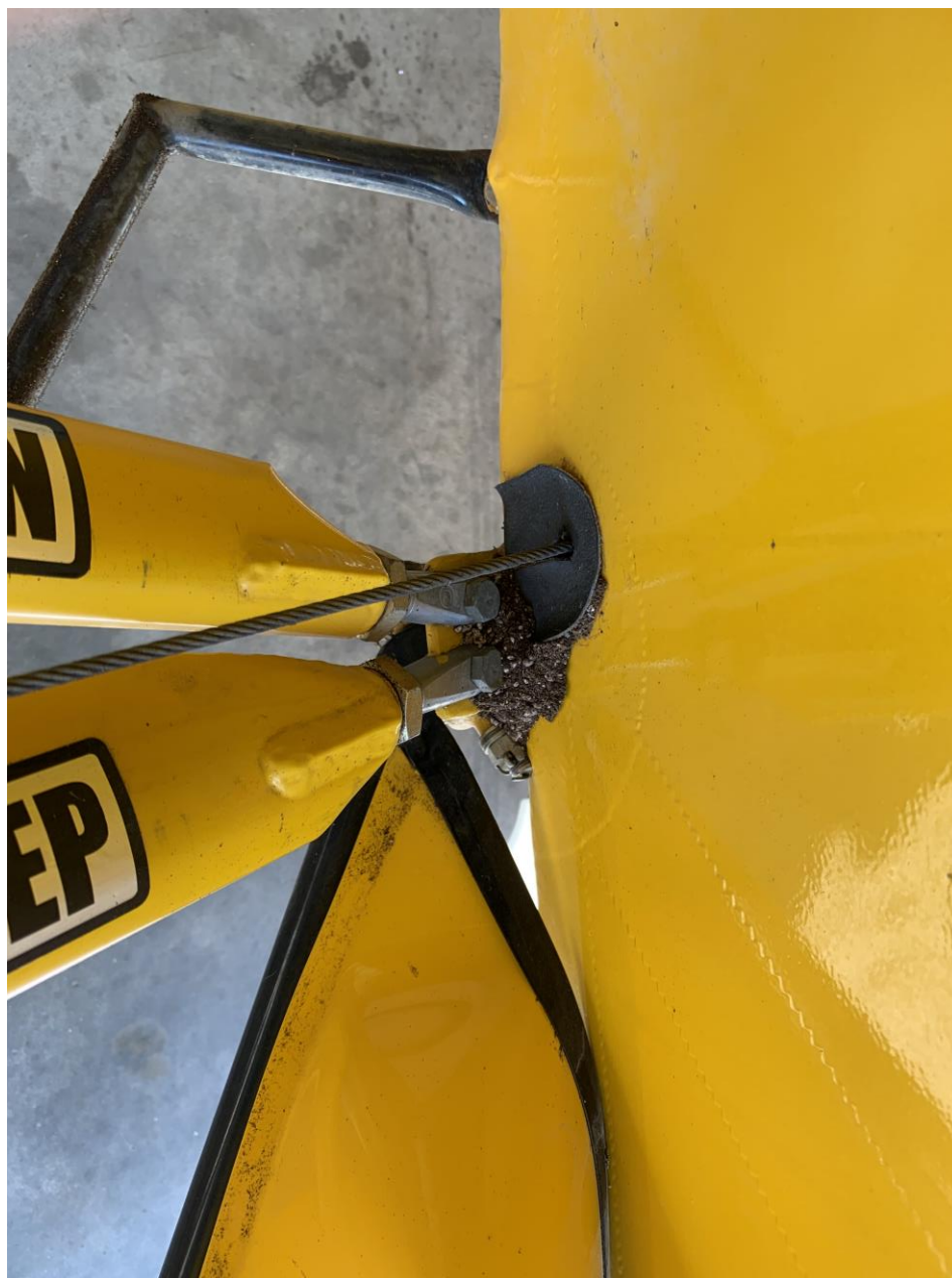
Photo 5 – Accident airplane right main landing gear attachment.