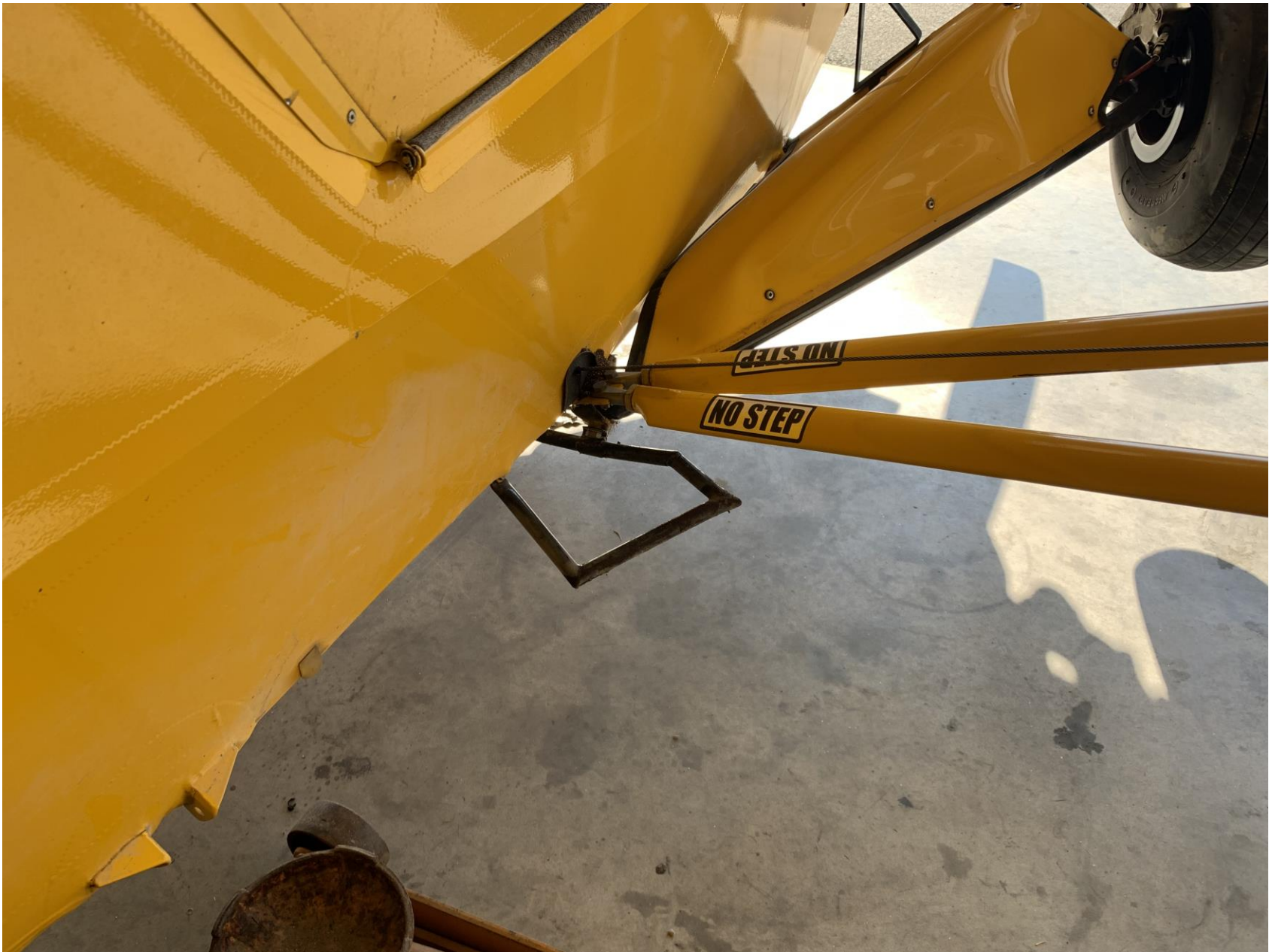
Photo 6 - Accident airplane right main landing gear attachment.