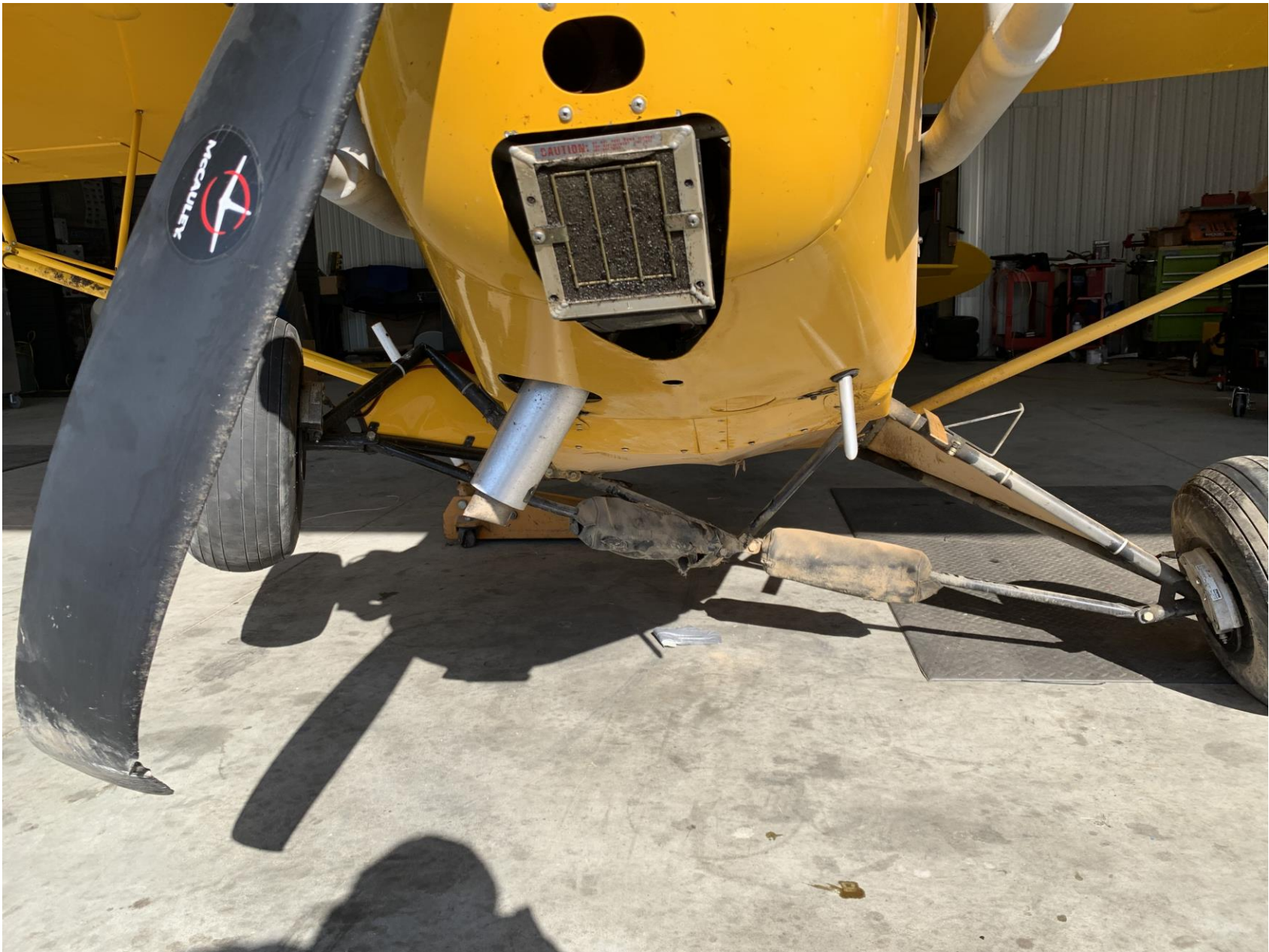
Photo 2 – Accident airplane forward view of main landing gear and fuselage.