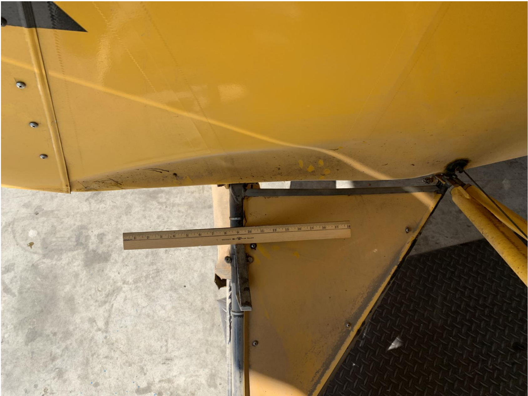
Photo 3 – Accident airplane left main landing gear attachment.