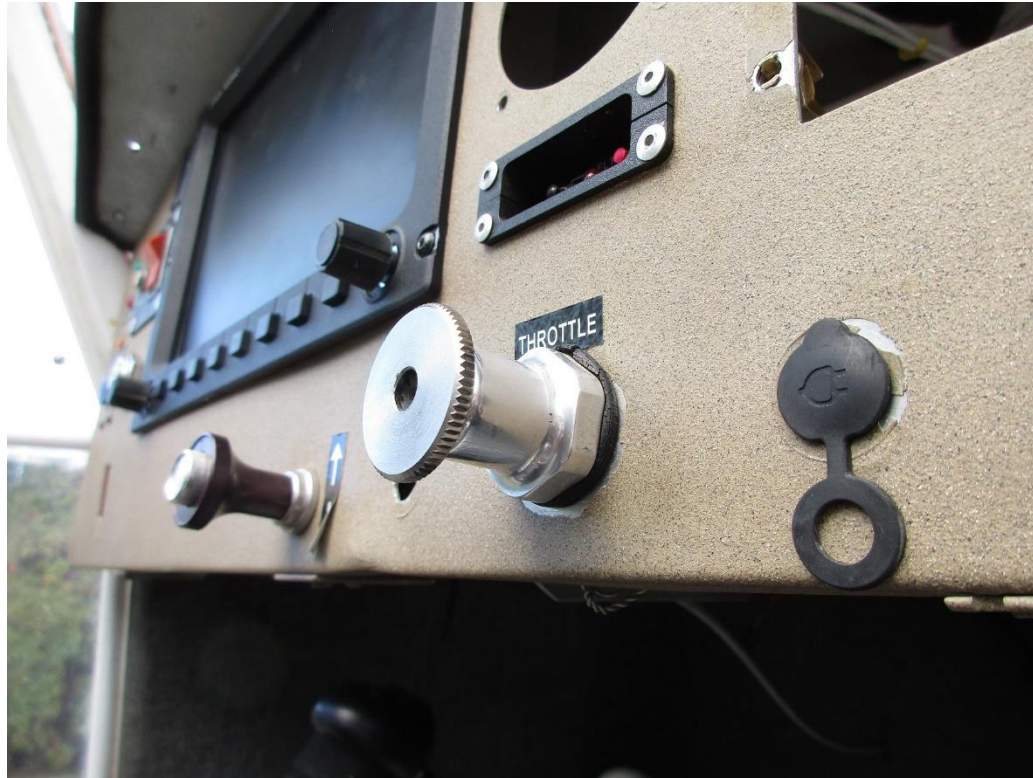
Photo 2 – View of the push-pull throttle control