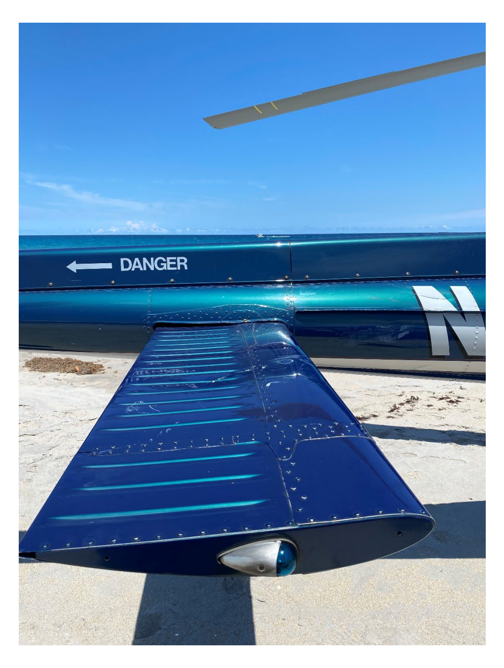
Photo 7 – View of right horizontal stabilizer