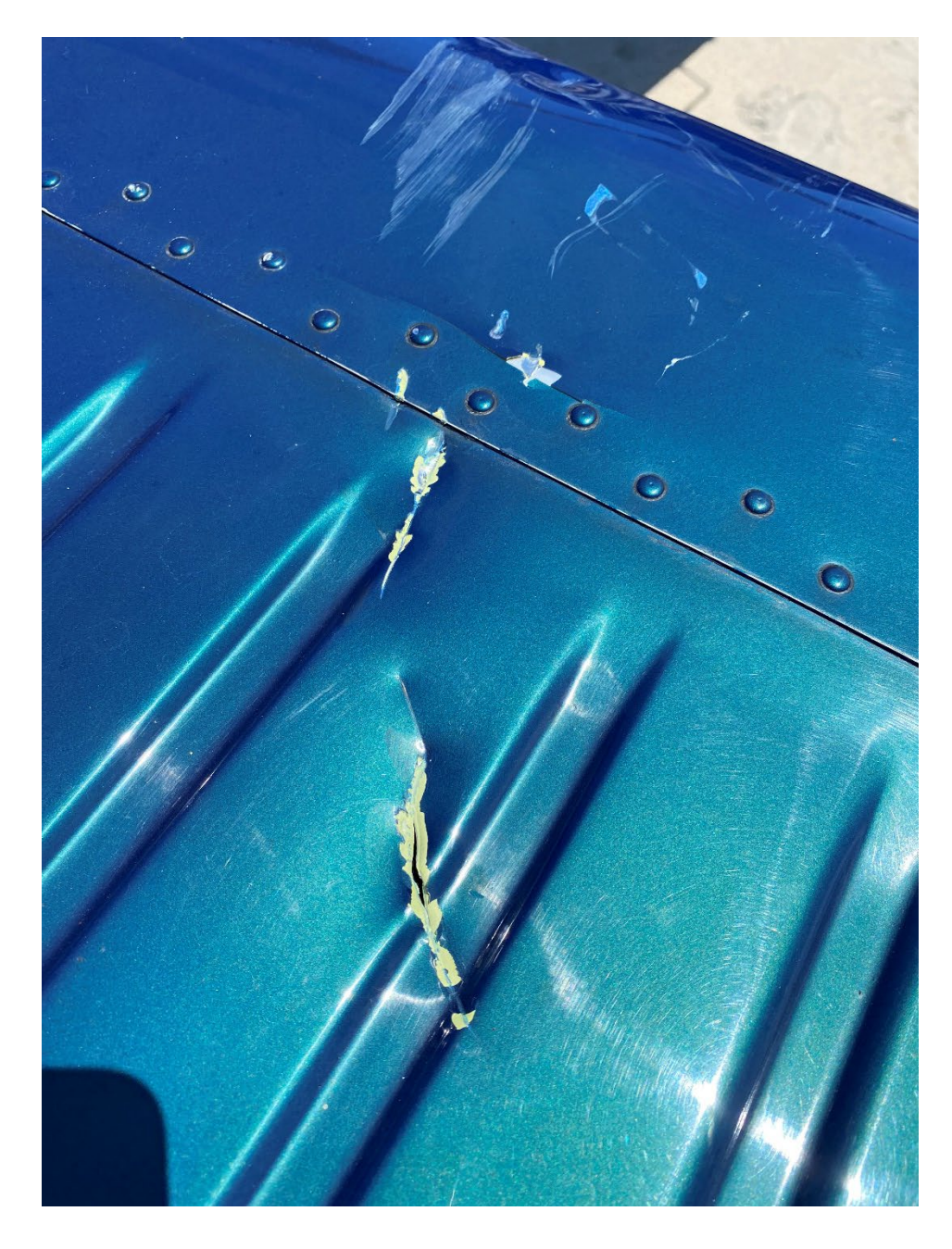
Photo 6 – Close-up view of horizontal stabilizer damage