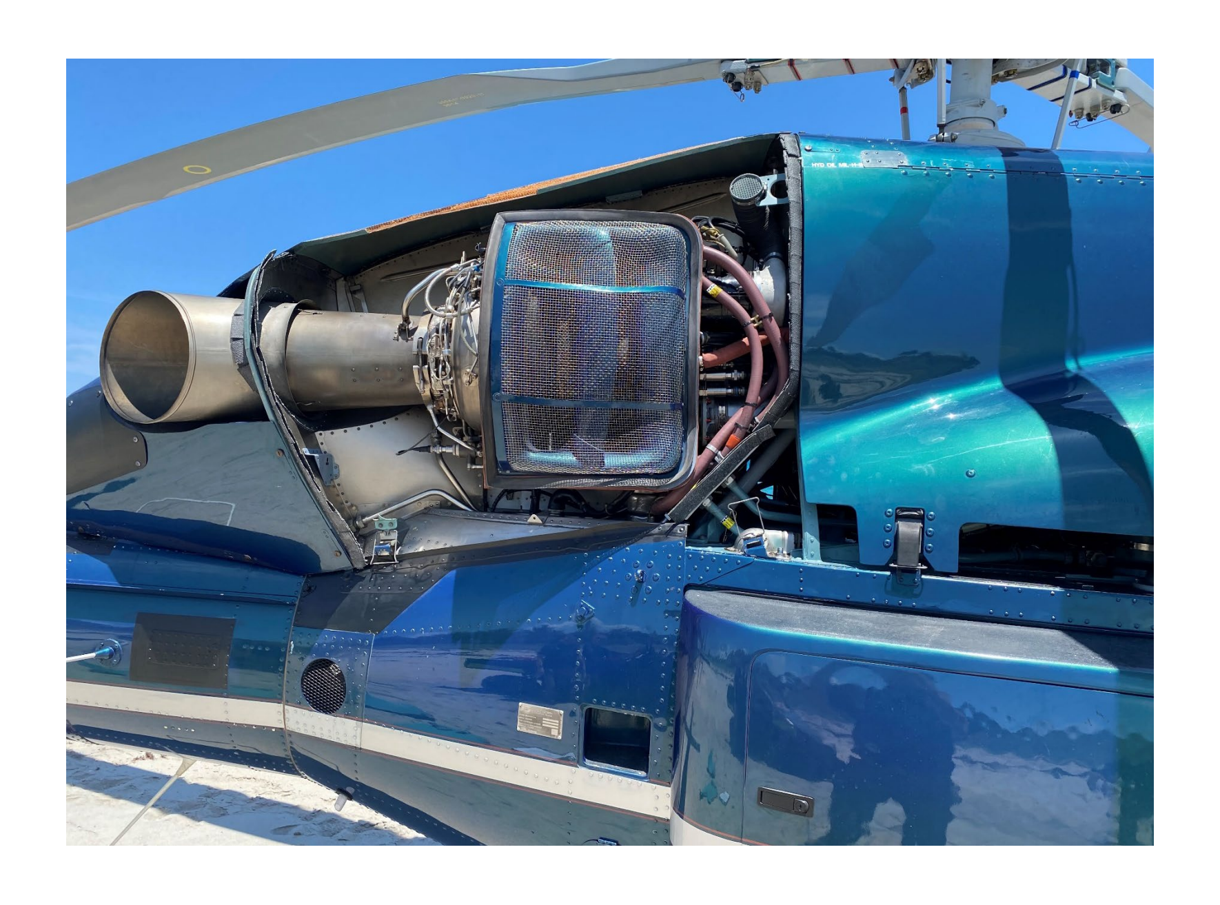
Photo 4 – View of area of missing engine cowl