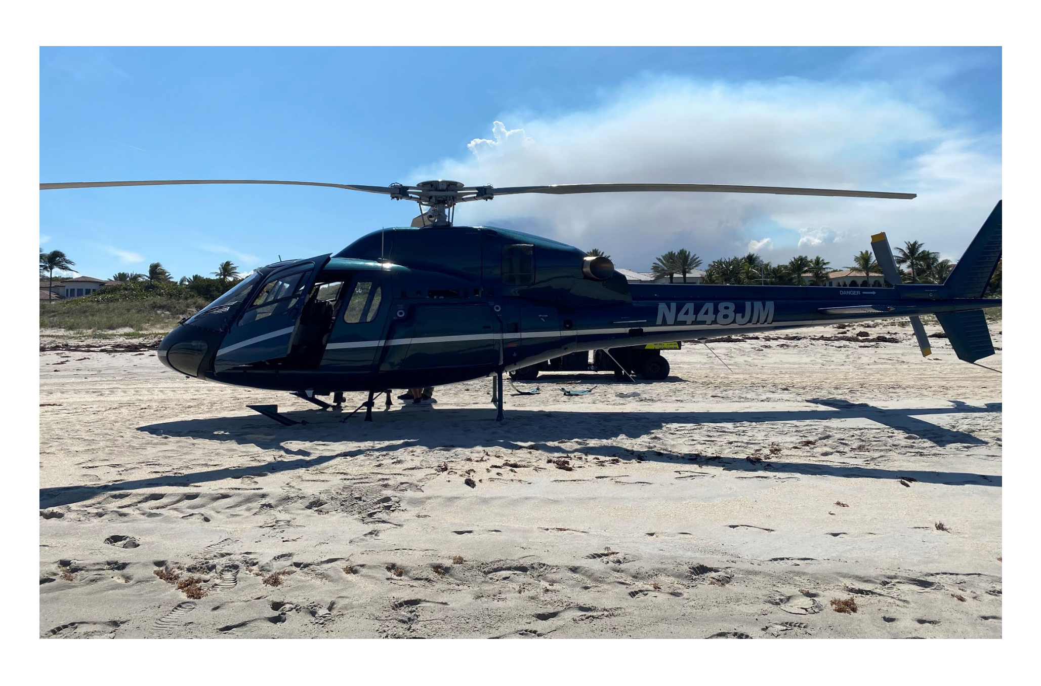
Photo 2 – View of helicopter from left side