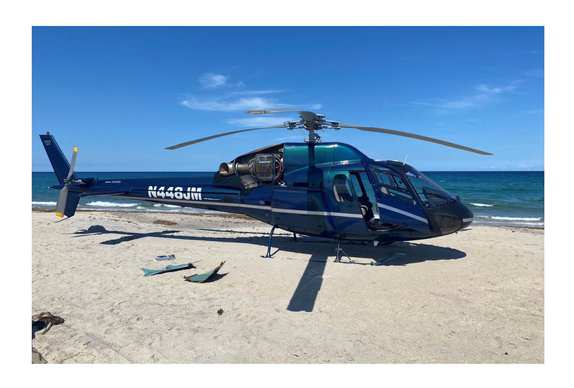
Photo 1 – View of helicopter from right side