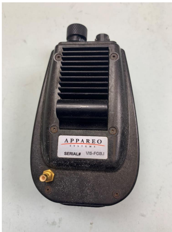
Figure 1. The Appareo Vision 1000 device as received.

The device was attempted to be downloaded using the manufacturer's procedures. The results of the download attempts are outlined below in section 3 of this report.