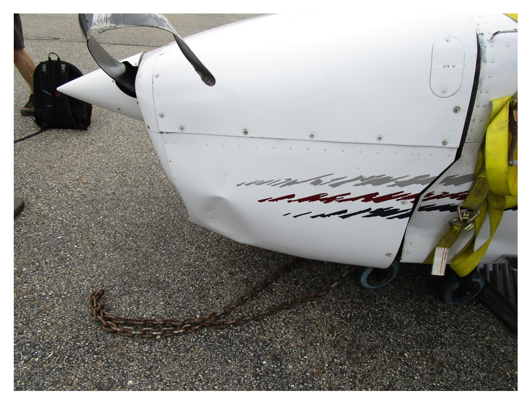
Photo 5 – Close-Up View of Nose Area Damage