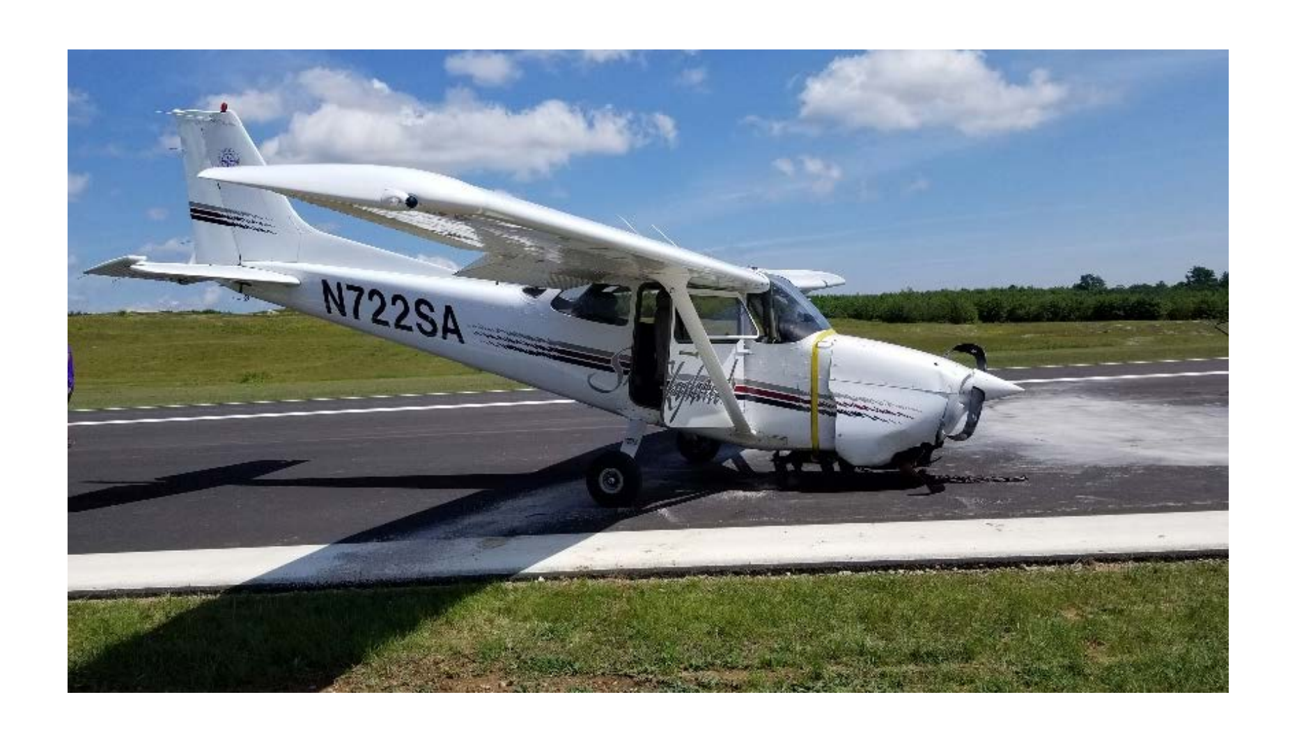
Photo 3 – View of Airplane from Right Wing