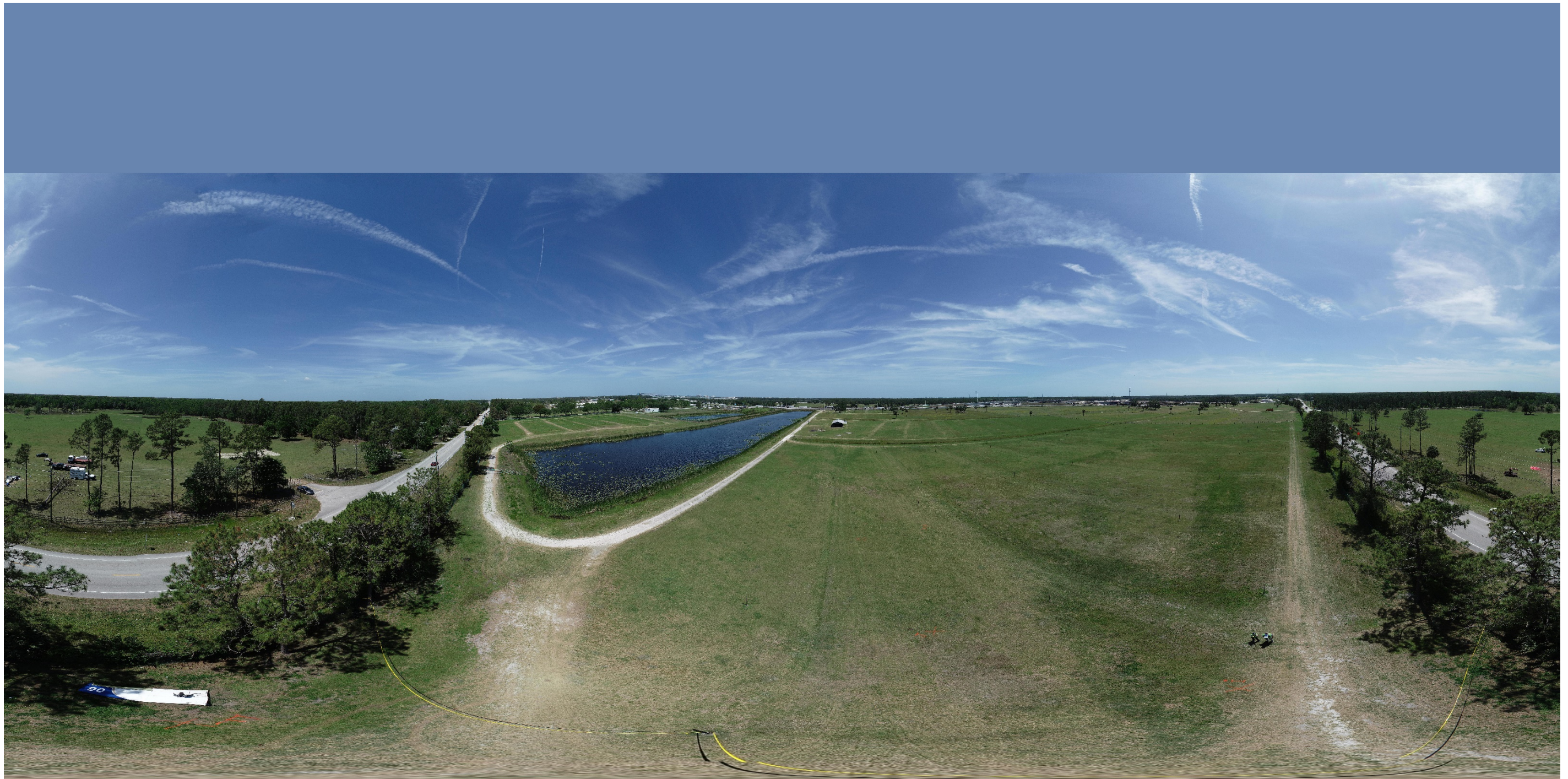
Figure 6 - Panoramic image of wreckage scene (Image contains distortions) 3 .