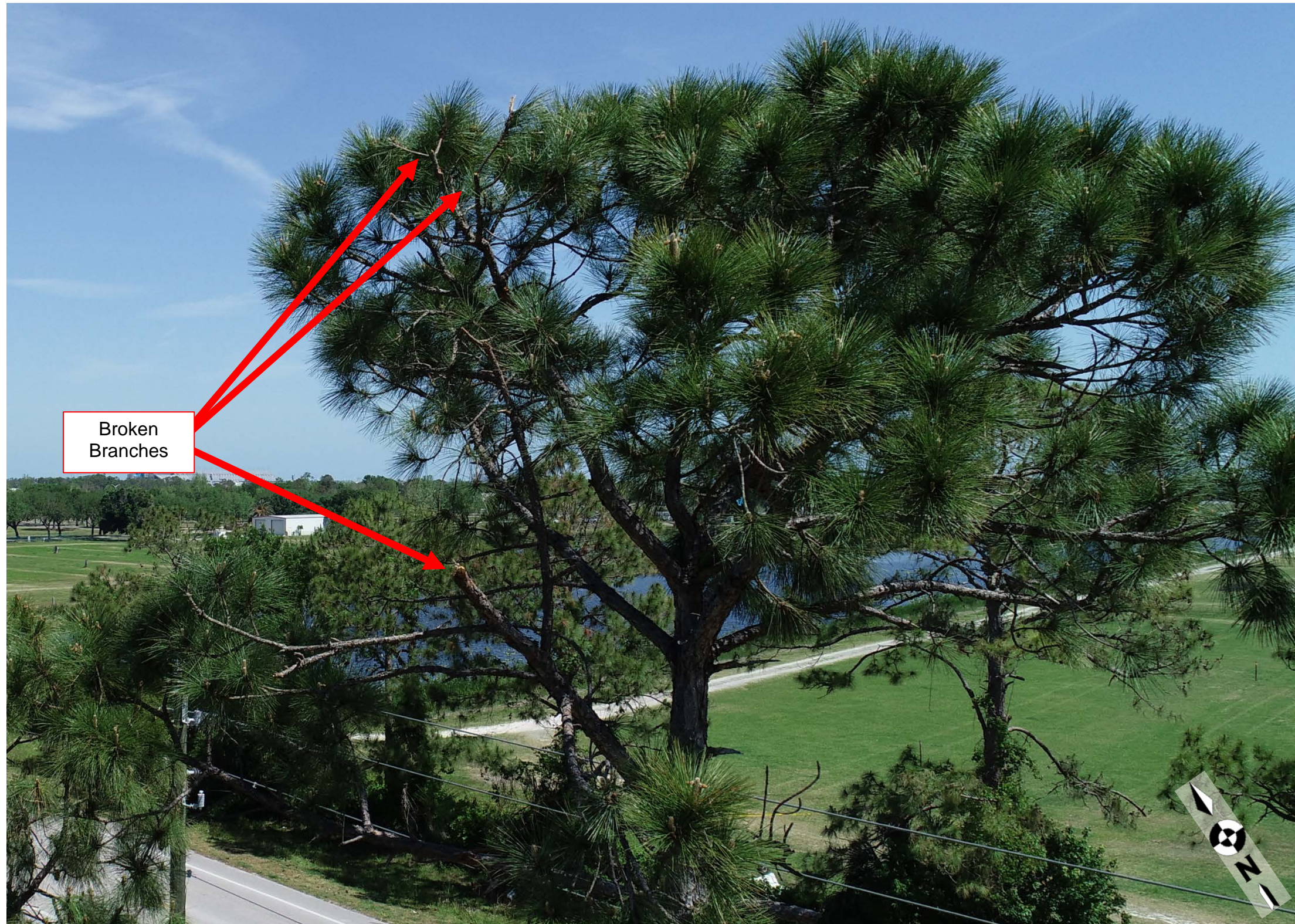
Figure 4 – Photo (Cropped) showing a closeup of tree in flight path with broken branches (directional arrow approximated)