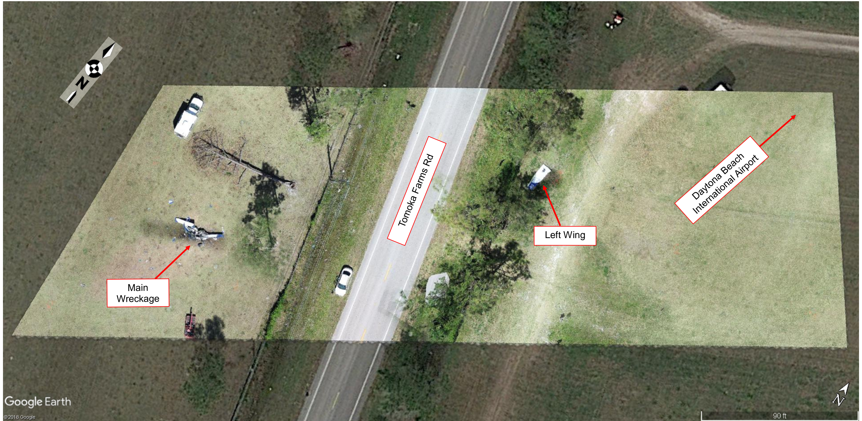
Figure 5 - Orthomosaic of accident site overlaid on Google Earth.