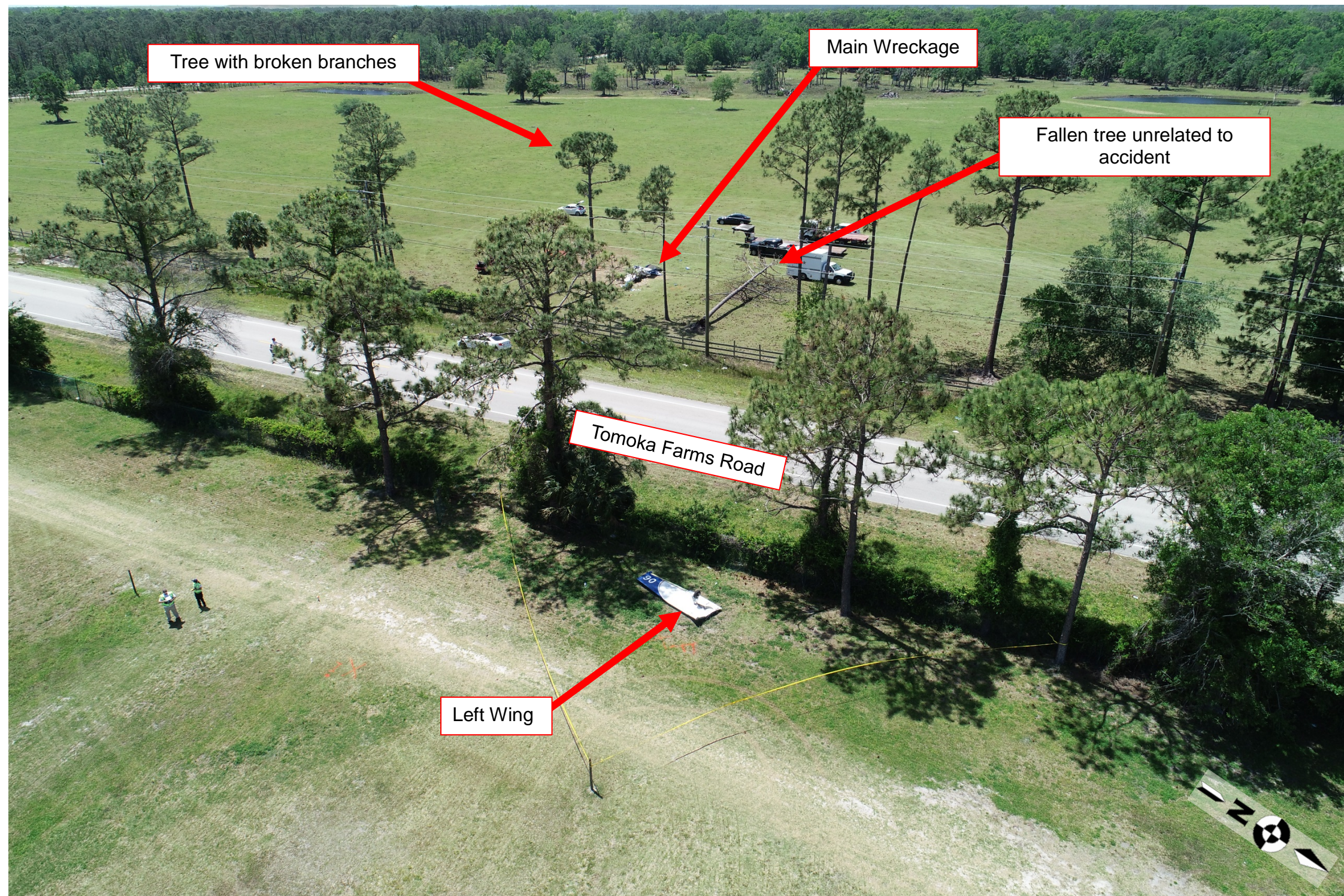
Figure 1 – Photo – Scene Overview (directional arrow approximated)