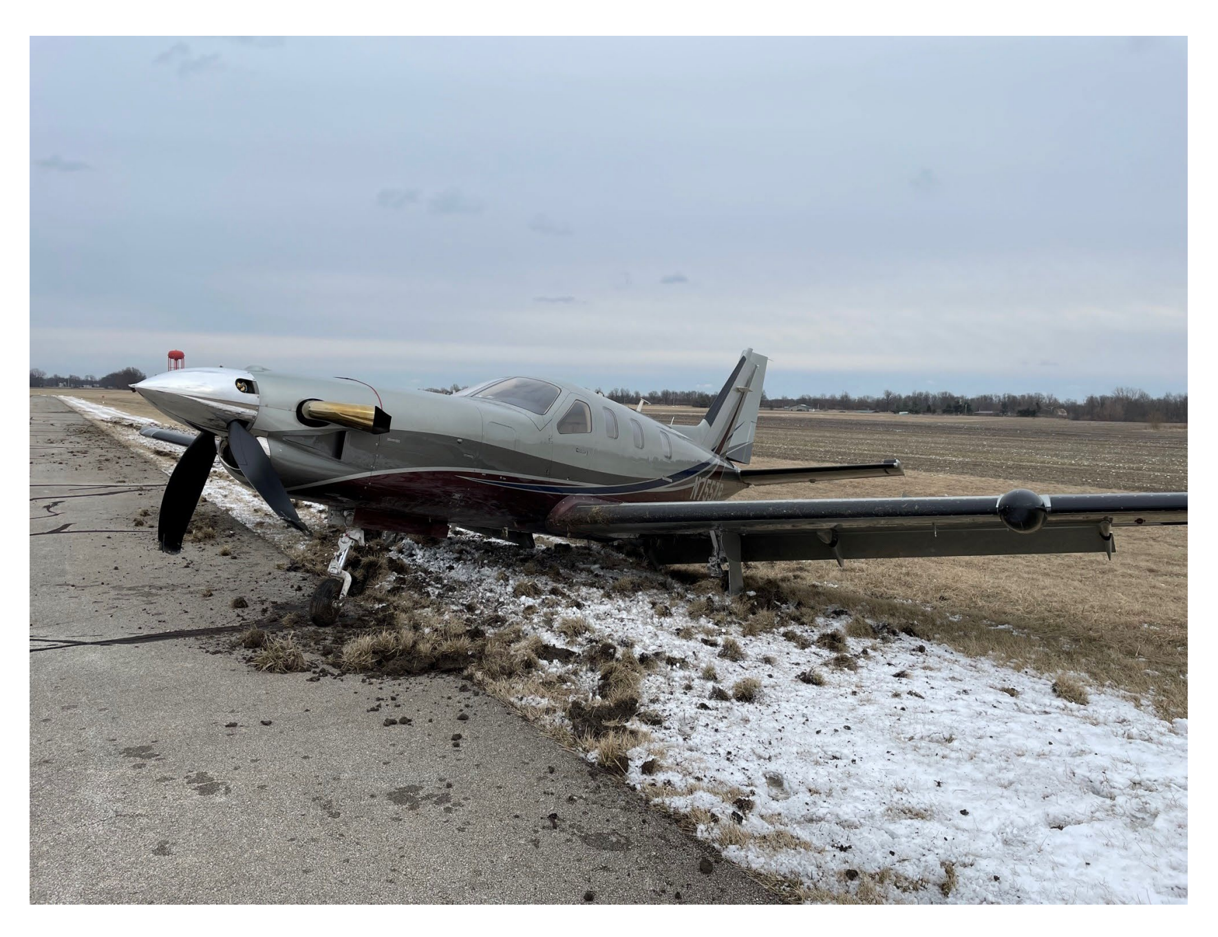
Photo 1 – Engine Damage