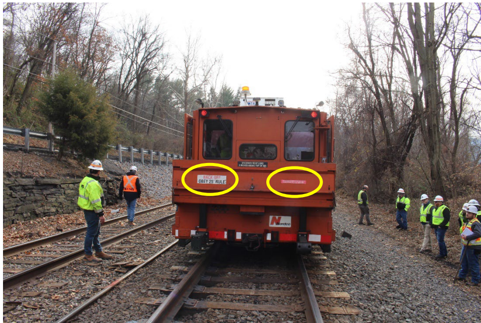
Figure 2 Photograph looking south at the rear of Spiker #2. Standoff warning notices to employees working to the rear of the equipment are highlighted by the yellow circles.