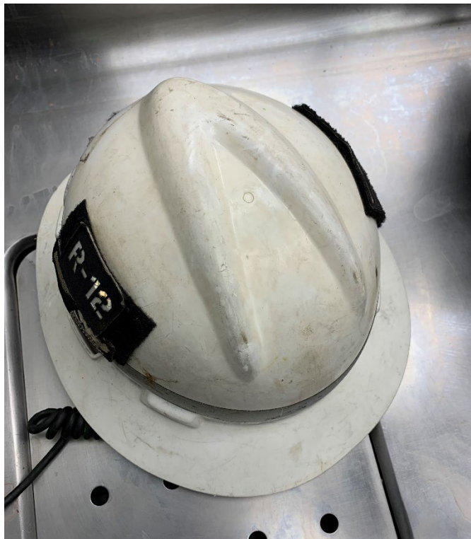
Figure 18 Photograph of the hardhat worn by the worker at the time of the accident. The hardhat was not issued equipment by National Salvage but still met regulatory requirements.