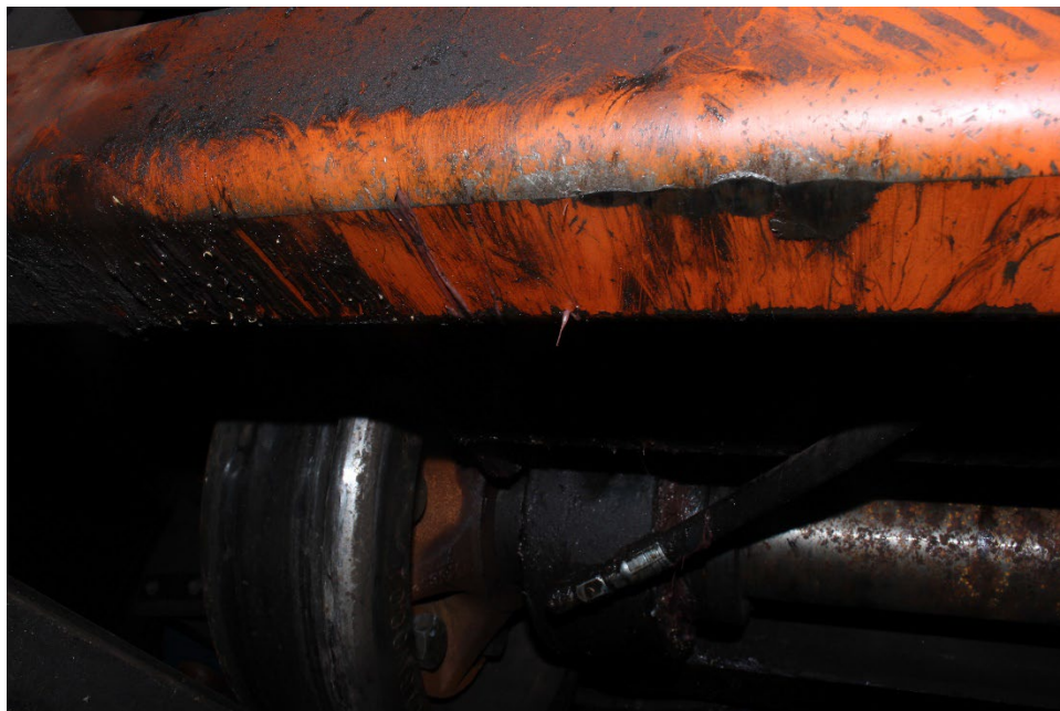
Figure 16 Evidence of the workers presence underneath the equipment which also shows directionality of the worker's body movements during the impact.