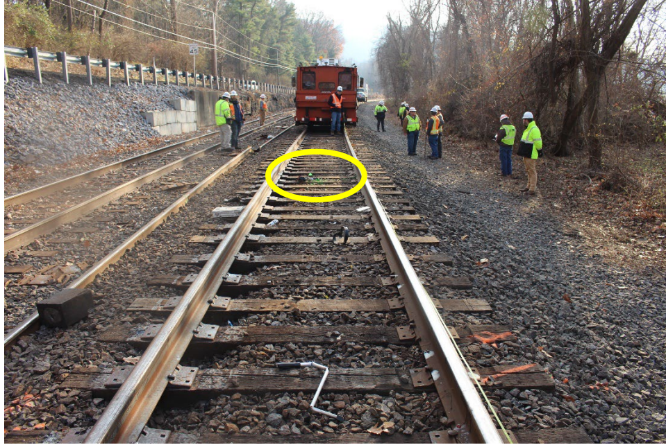
Figure 9 Looking southward down the track at Spiker #2. The final rest position of the worker underneath the equipment is indicated by the orange paint marks in the foreground. In the background, the green paint marks (circled in yellow) indicate the approximate point of contact between the equipment and the worker.