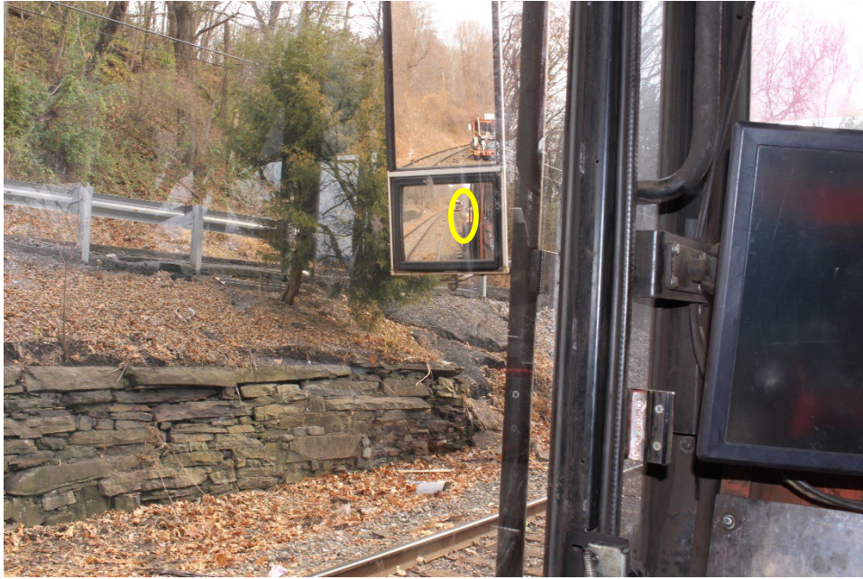
Figure 5 is the view from the left operator's seat of the track behind the spike machine. The yellow circle indicates the image of an individual standing in the center of the track.