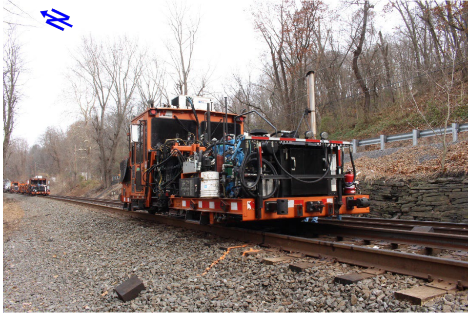
Figure 1 Photograph showing the front and right-side view of Spiker #2 at final rest. Spiker #3, located north of Spiker #2, is visible in the background.