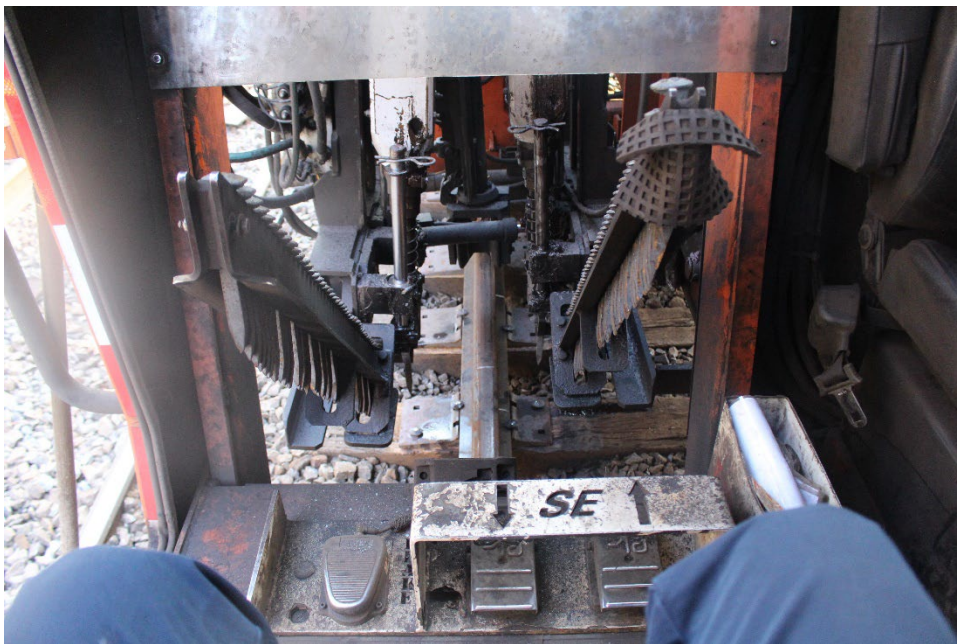
Figure 6 The view of the area underneath the equipment as seen by the operator in the left seat of the spike machine.