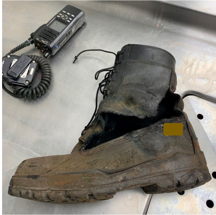
Figure 24 Photograph of left work boot recovered from the worker at the coroner's office.