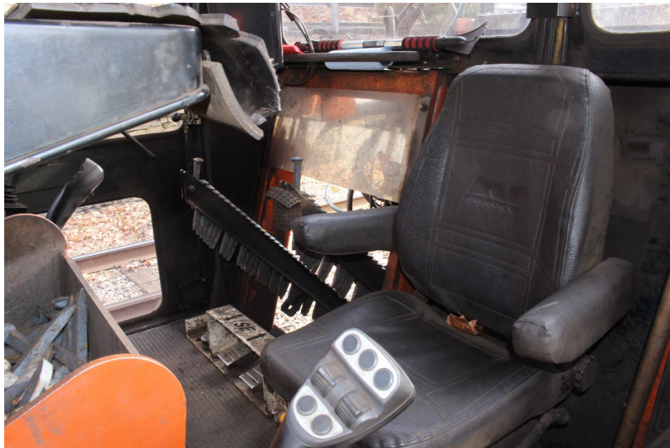
Figure 4 Photograph of the interior of the spike machine looking from the right side towards the left operator seat. The center seat, facing backwards, is for the spike feeder worker.