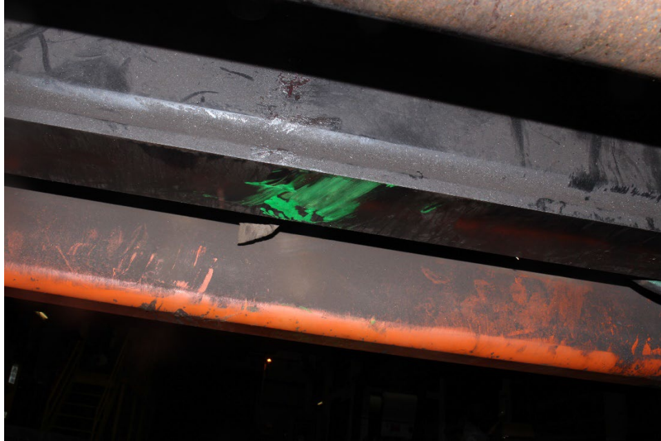
Figure 15 Photograph of the green paint smeared on the metal frame, transferred from the worker's paint covered backpack.