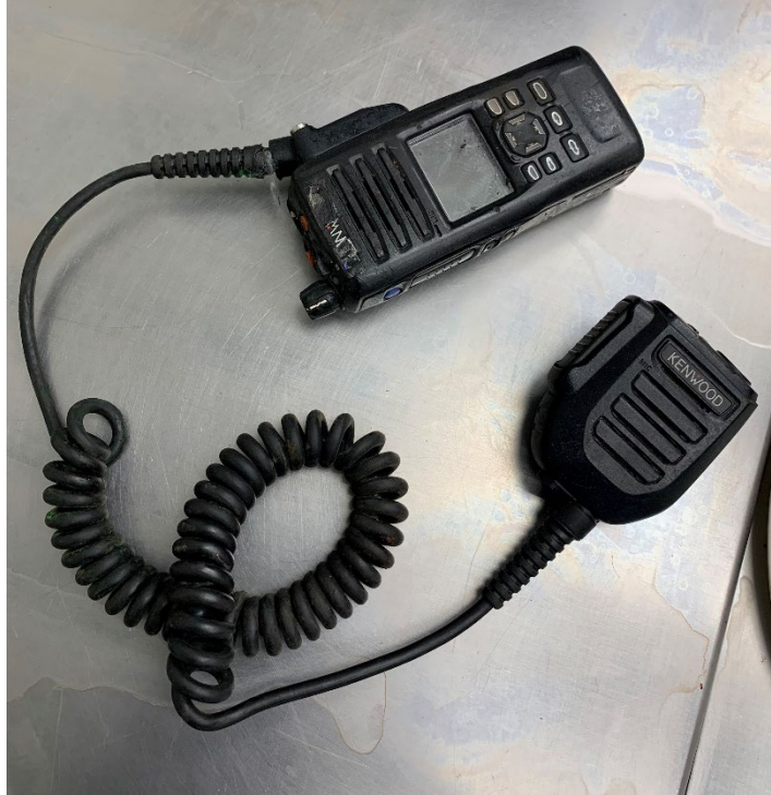
Figure 19 Photograph of radio worn by worker and recovered at the coroner's office.