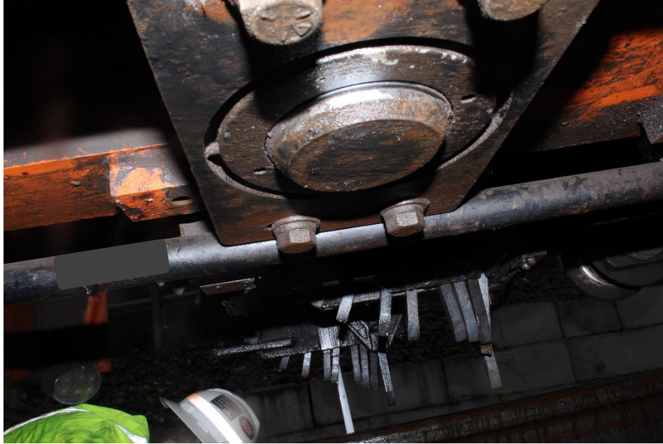
Figure 13 Photograph taken from underneath the spike machine, looking towards the left side of the equipment, showing the final rest position of the worker under the equipment. The spike feeder belt is visible in the background.