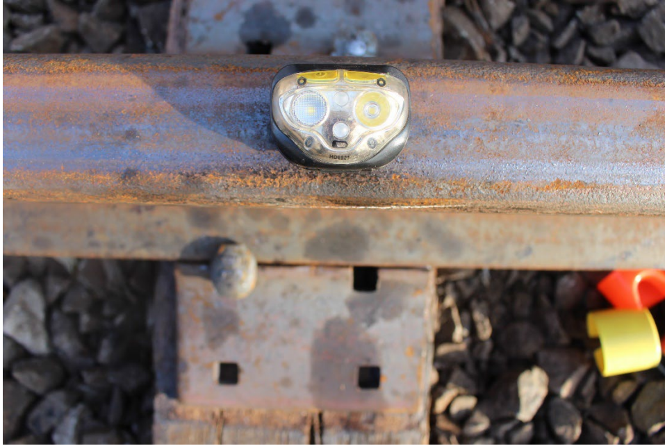
Figure 11 Closeup of the worker's hardhat light found on the scene. Post-accident, the light was still functional.