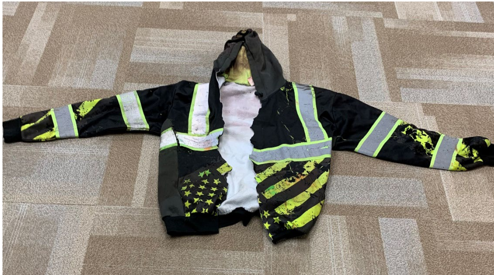
Figure 20 Photograph of the outer hooded jacket worn by the worker at the time of the accident.