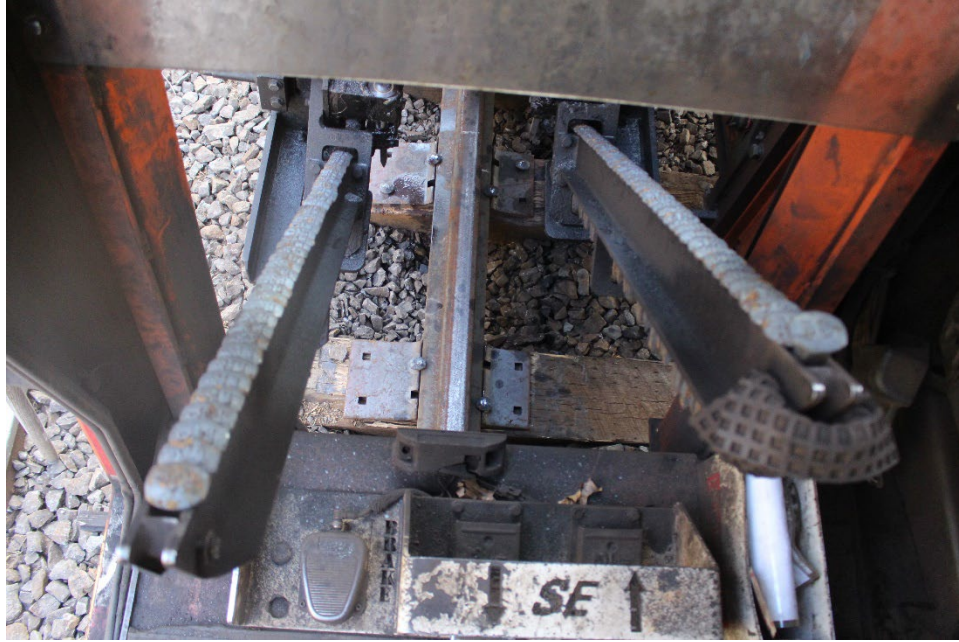
Figure 7 Shows the operator's view of the area underneath the spike machine and how the operator would have seen the worker once he had passed underneath the equipment.