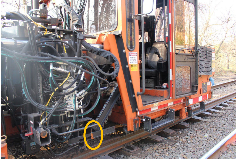
Figure 3 Photograph of the left (operator's) side of Spiker #2. The highlighted mark on the equipment indicates the location underneath the machine where the worker was found.