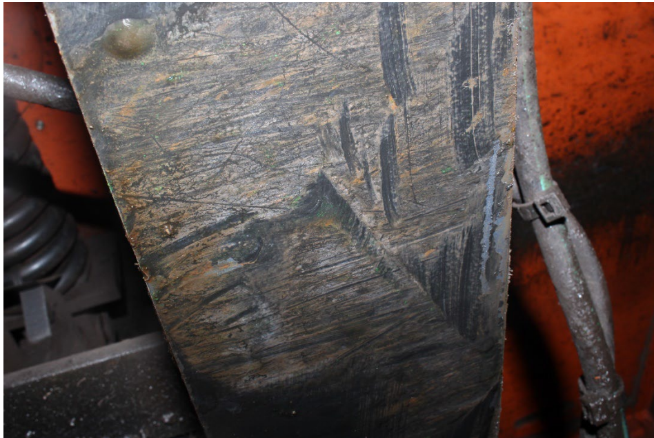
Figure 12 Photograph taken of the undercarriage of the spike machine showing the worker contact with the metal frame as he traveled underneath.