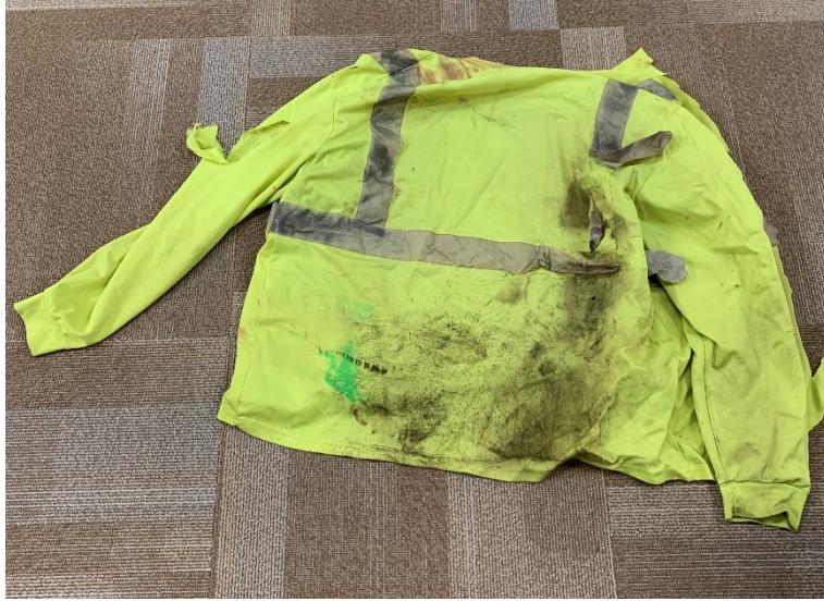
Figure 21 Photograph of the interior shirt worn by the worker. The shirt conforms to the ANSI Class 2 standard.