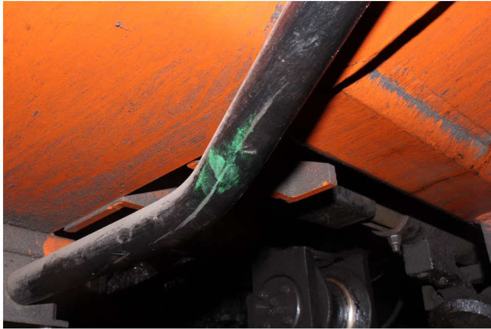
Figure 17 Photograph of more paint transfer from the worker's backpack to the undercarriage of the spike machine.