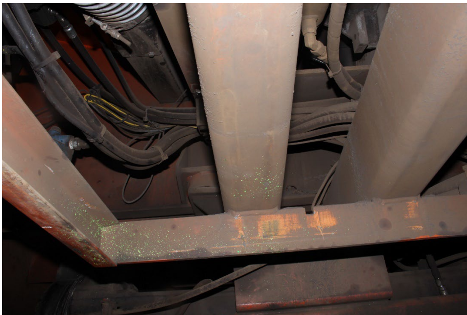
Figure 14 Photograph of the undercarriage of Spiker #2 showing the paint spray on the under frame caused by the exploding can of paint at the time of impact.