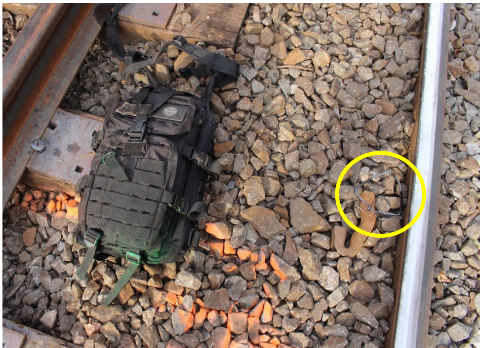
Figure 10 Photograph of the worker's personal effects found on the scene, to include the black backpack he was wearing at the time of the accident and a pair of safety glasses (highlighted by the yellow circle)