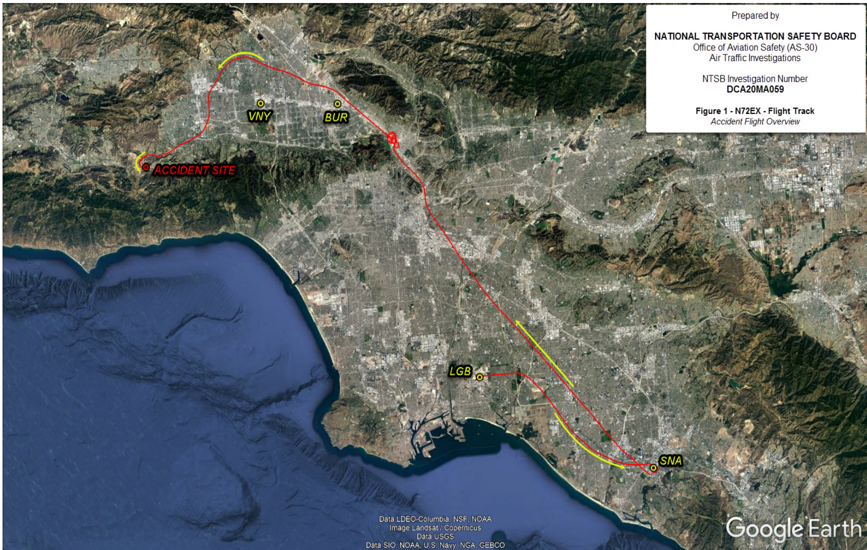
Figure 1 - N72EX flight track indicated in red with yellow arrows showing direction of travel. Also depicted for reference are the airports whose ATC facilities provided services to N72EX on the day of the accident.