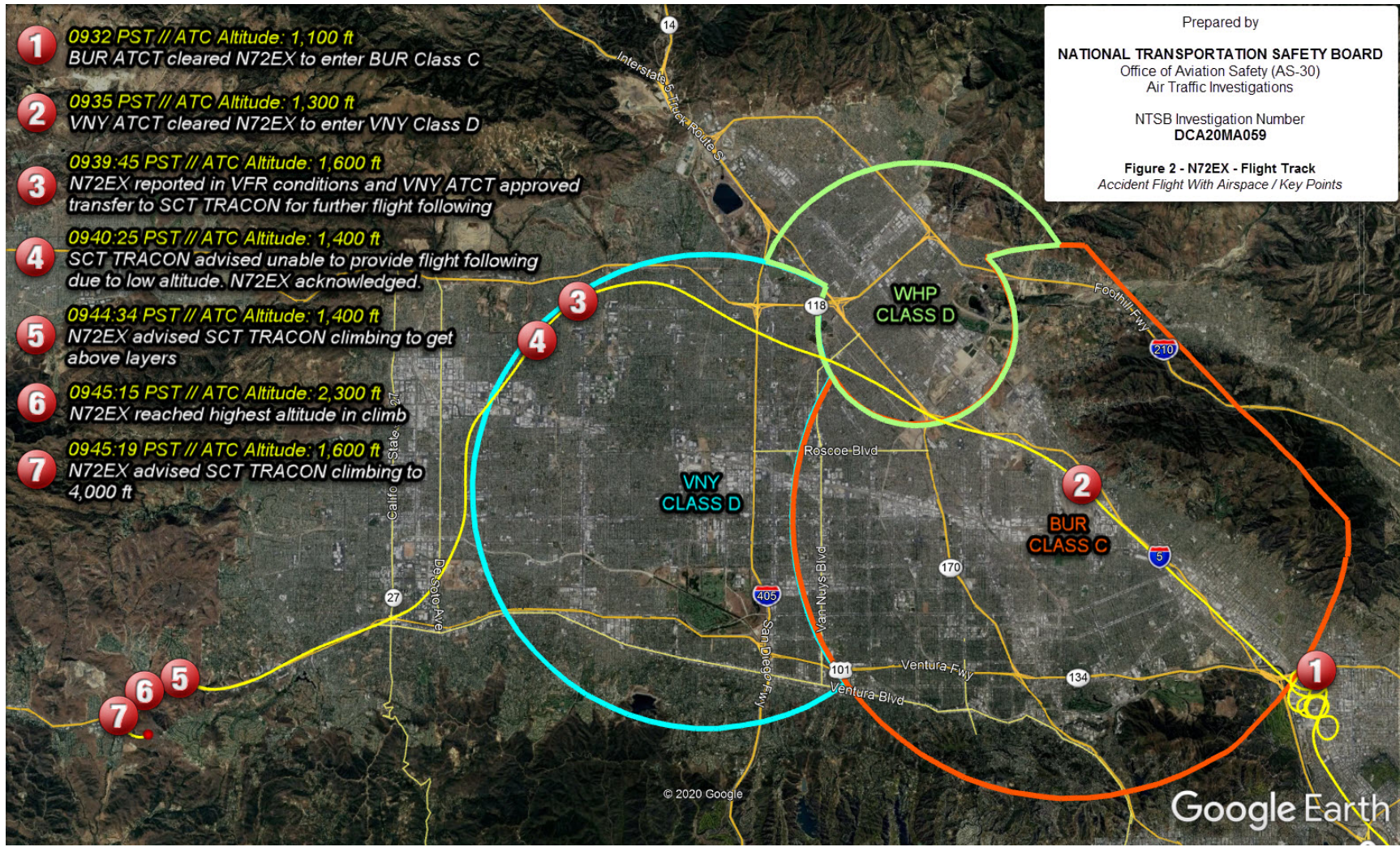
Figure 2 - N72EX flight track depicted in yellow from the time N72EX was in holding outside the BUR class C airspace through the accident time. Also depicted for reference are the BUR class C, VNY and WHP class D airspace, as well as key points.