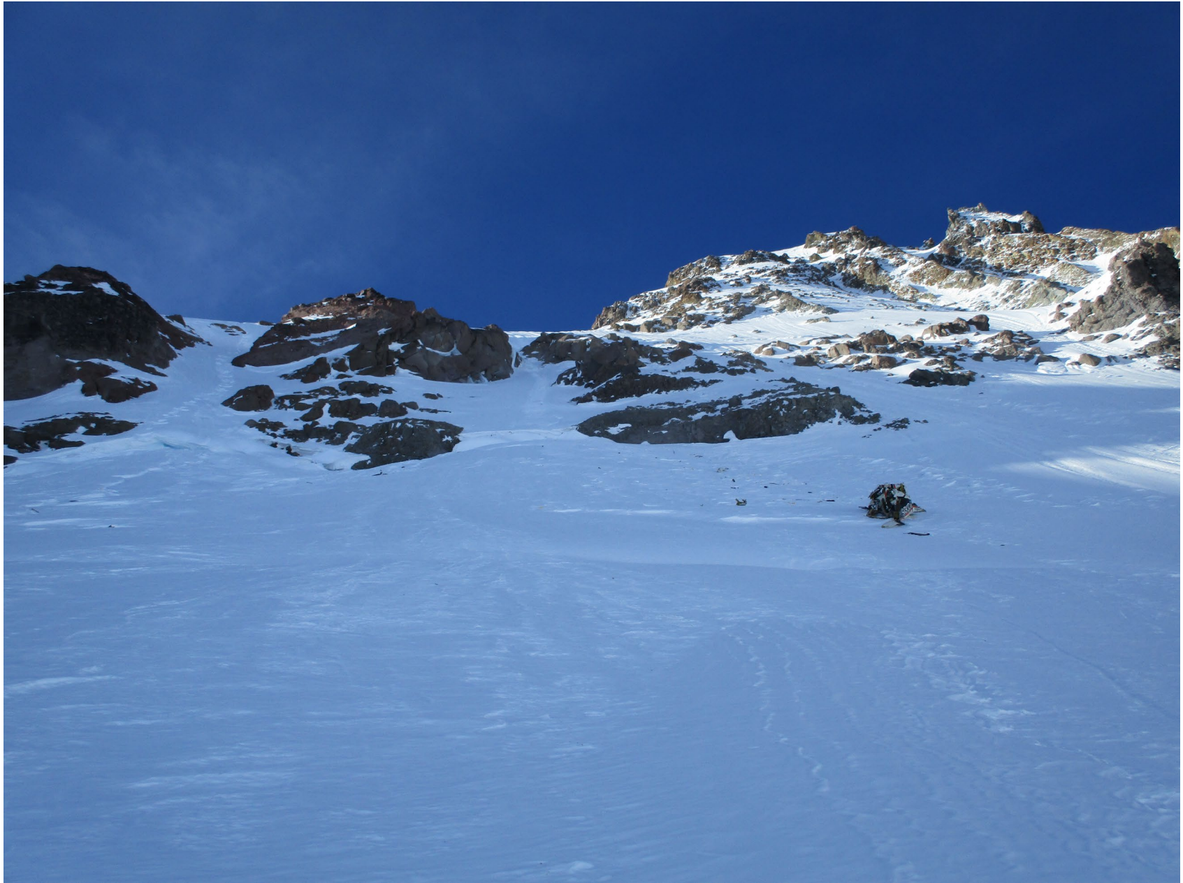
Photo 4 – Fuselage