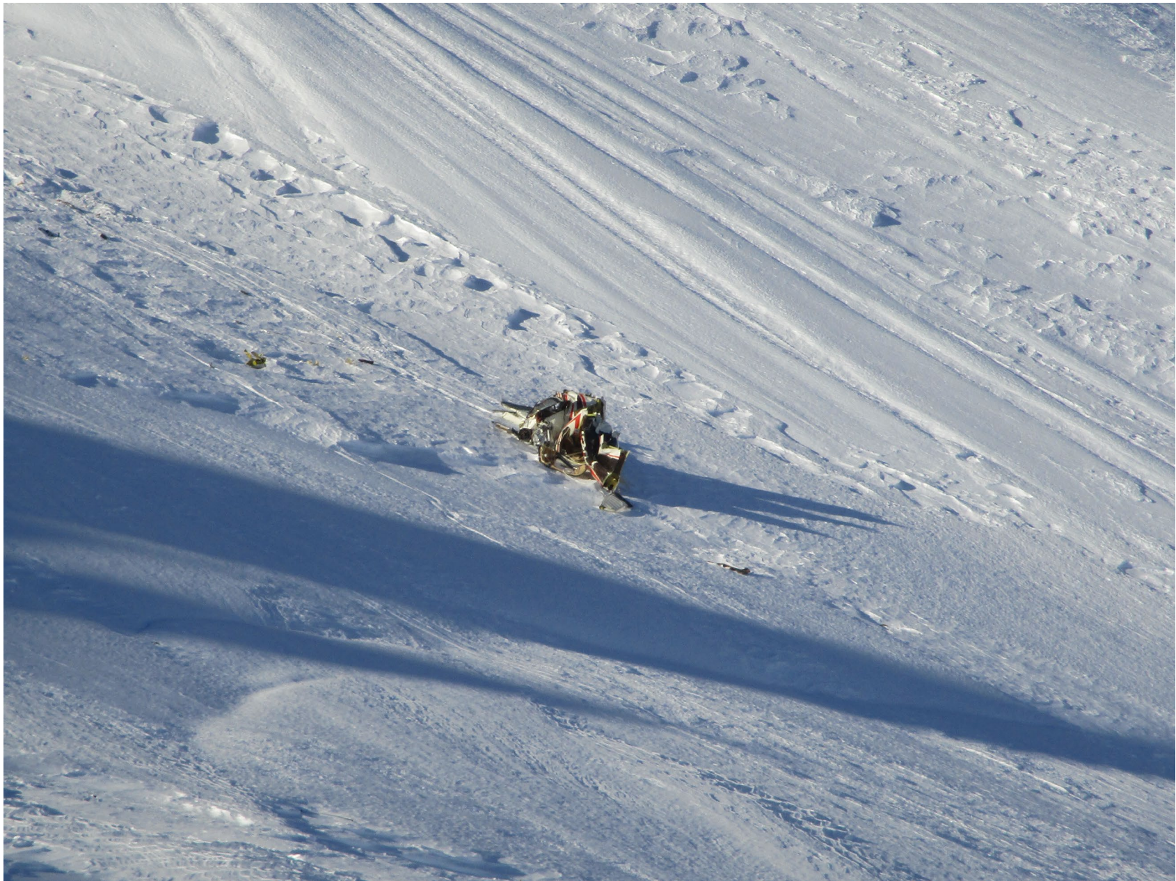
Photo 3 – Fuselage