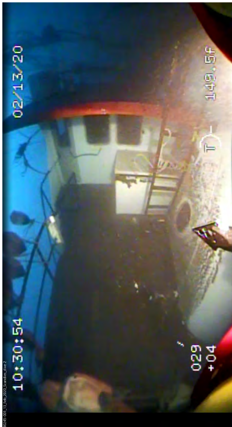
Screencapture of ROV Footage taken by Global Diving & Salvage, Inc., dated February 13, 2020