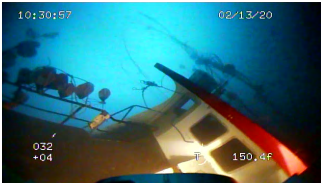
Screencapture of ROV Footage dated February 13, 2020

No part of a report of a marine casualty investigation shall be admissible as evidence in any civil or administrative proceeding, other than an administrative proceeding initiated by the United States. 46 U.S.C. §6308.