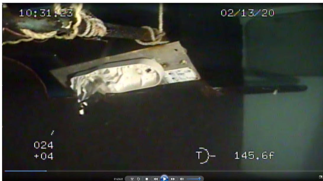
Screencapture of ROV Footage taken by Global Diving & Salvage, Inc., dated February 13, 2020