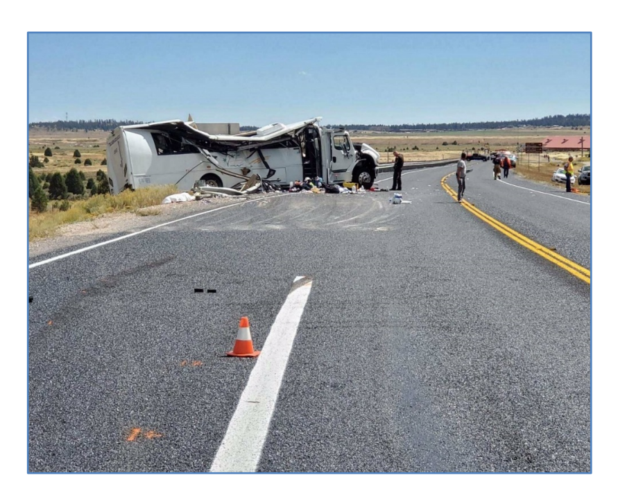
Figure 2. Postcrash scene.

At its final rest, the bus straddled the damaged guardrail, with its front partially blocking the westbound traffic lane of SR-12 (figure 2). According to preliminary information, 11 passengers were completely ejected and 2 passengers were partially ejected during the rollover. Four passengers sustained fatal injuries, 15 passengers suffered serious injuries, and 11 passengers and the bus driver received minor injuries.