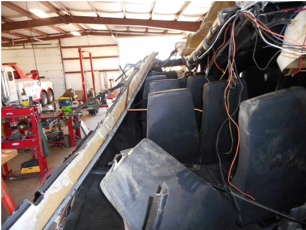
Photo 4 – View looking from rear to front showing roof shift and integrity loss.