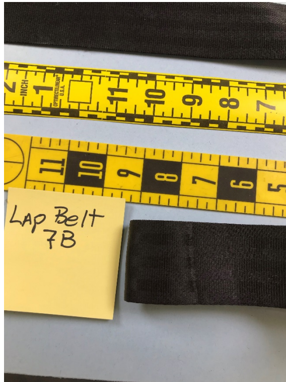
Figure 13. Close-up view of loading evidence to 7B lap belt webbing.