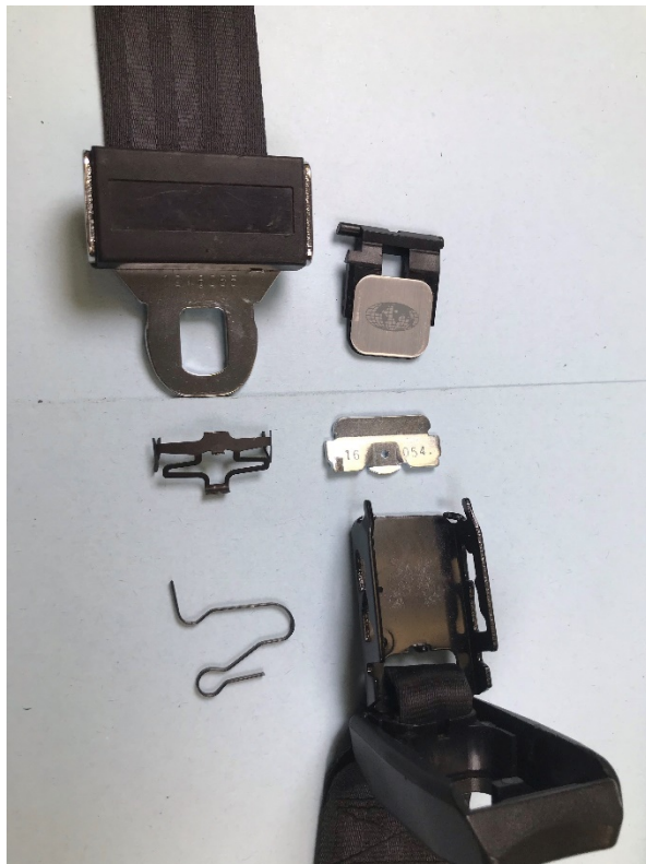
Figure 16. View of undamaged lap belt components removed and examined.