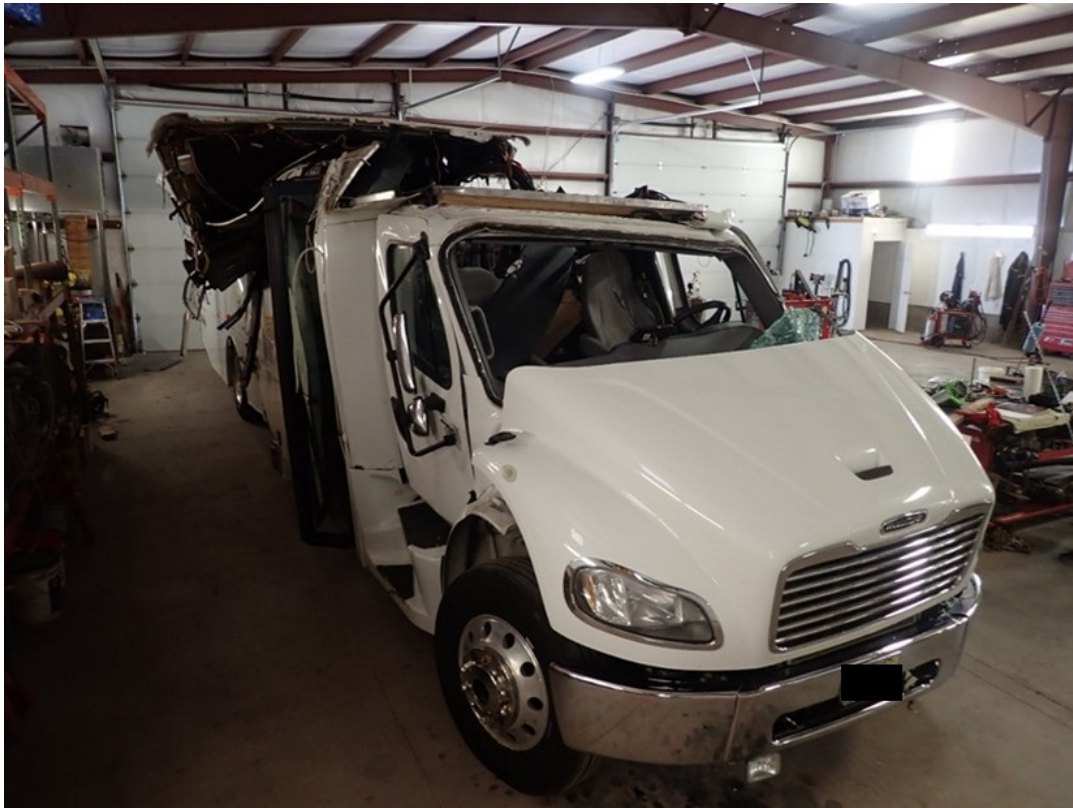
Photo 5 – Front right-angle view of deformation and roof shift to 2017 Freightliner, Embassy bus body.