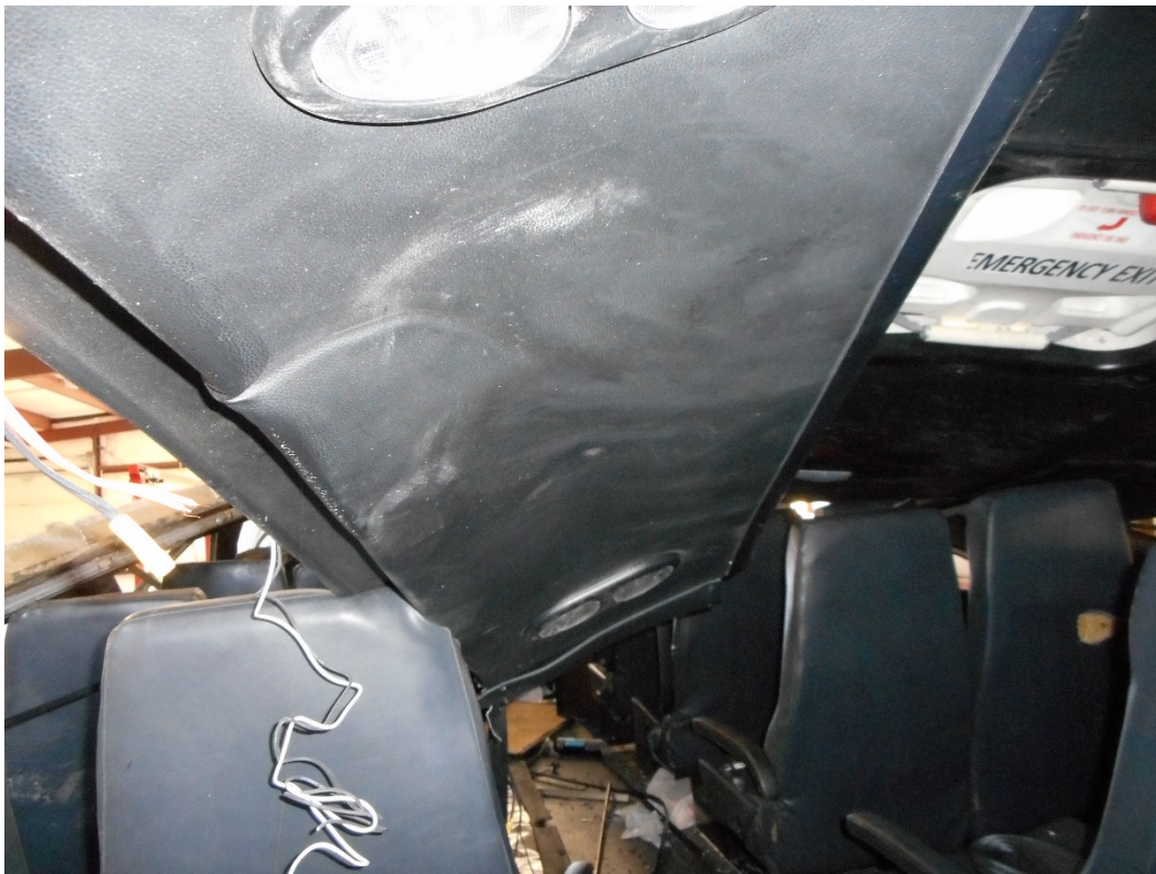
Photo 11 – View of roof collapse on top of Row 7 left side seatbacks.