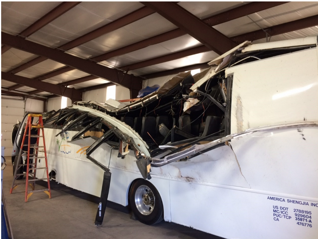
Photo 2 – Rear left angle view of deformation to roof of 2017 Freightliner, Embassy bus body.