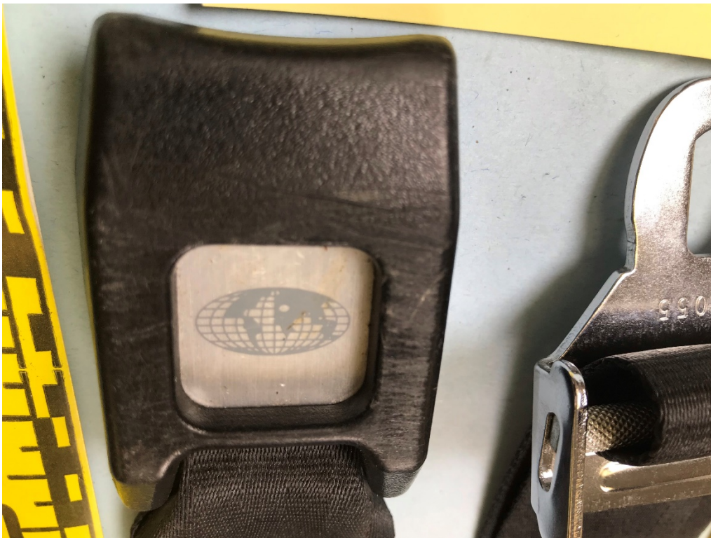
Figure 14. Close-up of 7B lap belt buckle showing evidence of roadway contact to top of plastic housing and latch plate cover broken off.