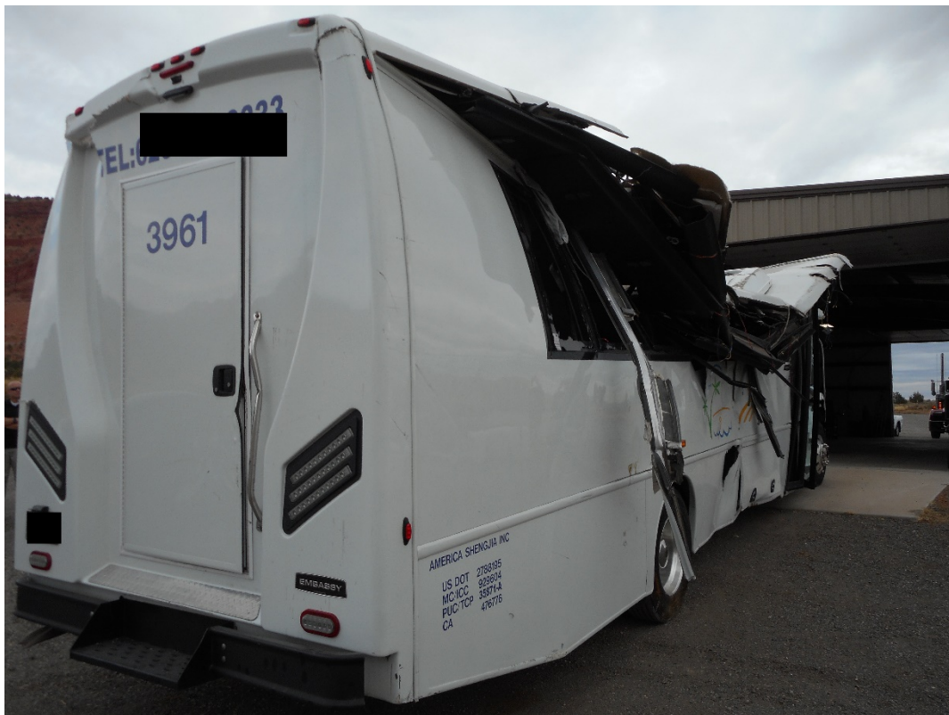
Photo 6 – Rear right angle view of deformation and roof shift to 2017 Freightliner, Embassy bus body.