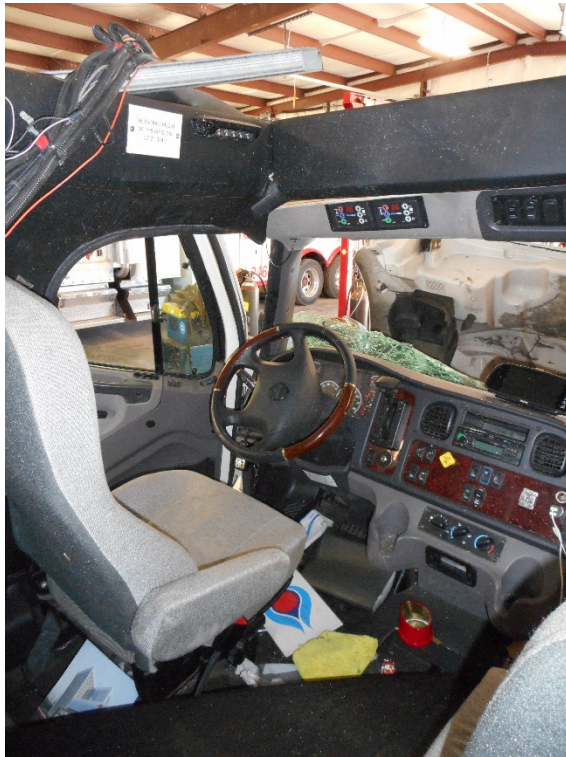
Photo 7 – Interior view looking at undamaged driver seating area. Note: Missing roof structure.