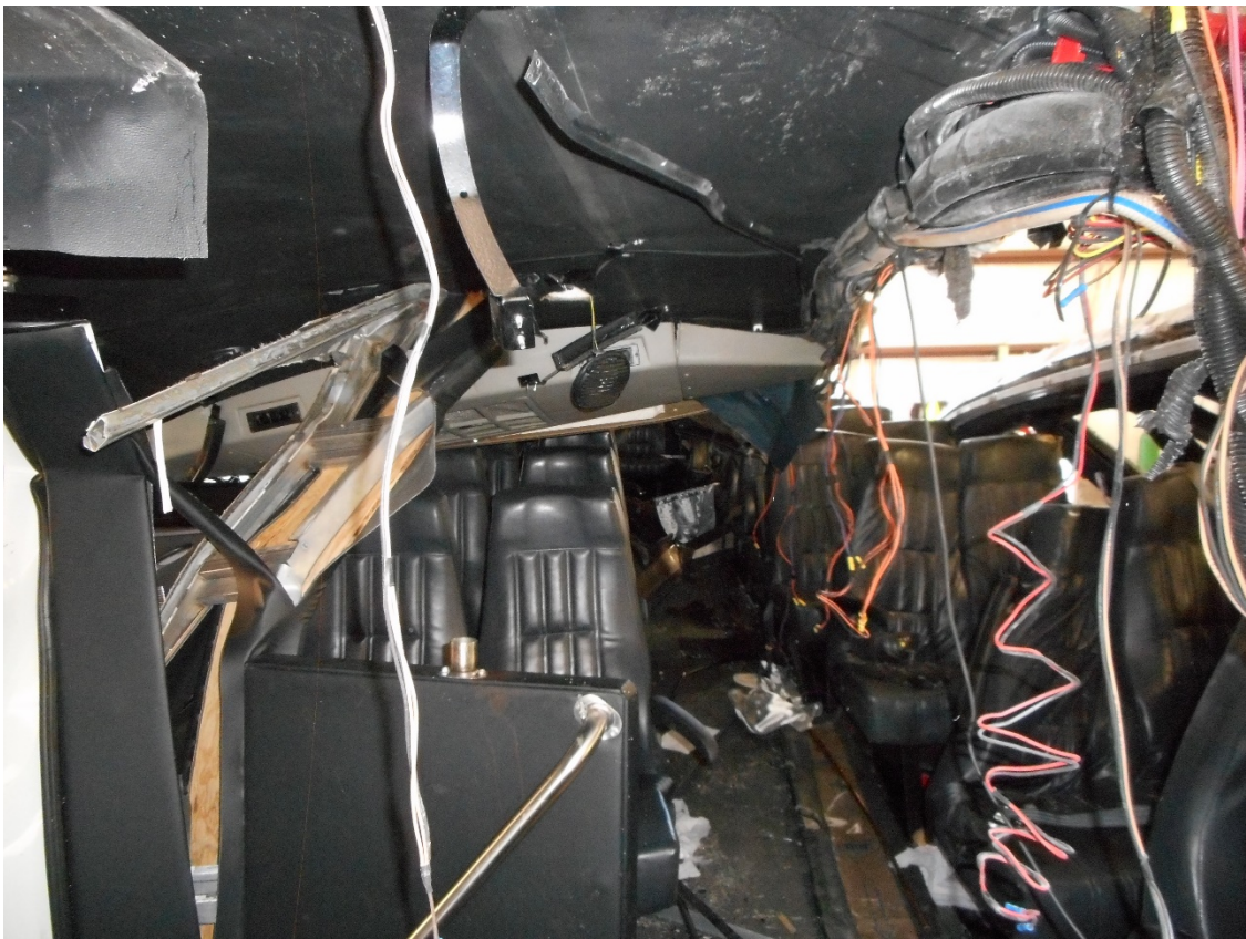
Photo 9 – Interior view of roof collapse looking from front to rear.