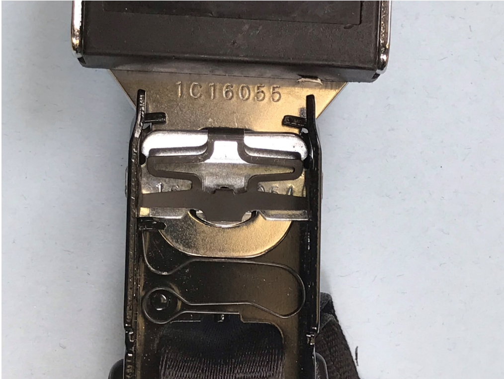
Figure 15. View inside lap belt buckle 7A prior to removal of interior components.