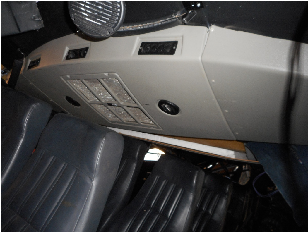
Photo 12 – View of roof collapsed on top of Row 3 left side seatbacks.