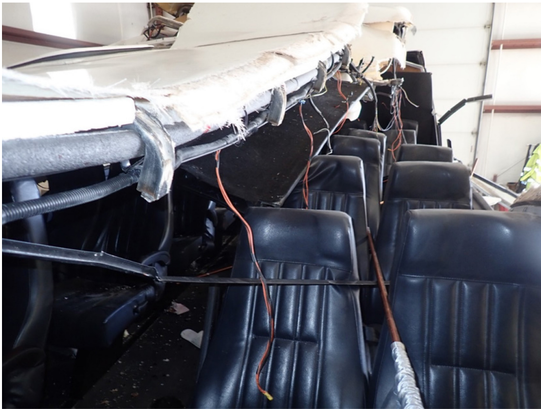
Photo 3 – View looking from front to rear showing roof shift and integrity loss.