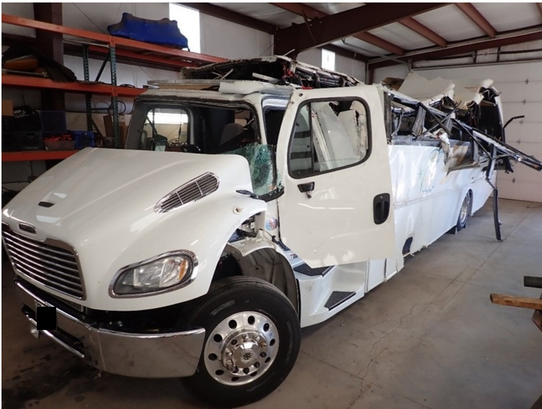
Photo 1 – Front left angle view of deformation to 2017 Freightliner, Embassy bus body.