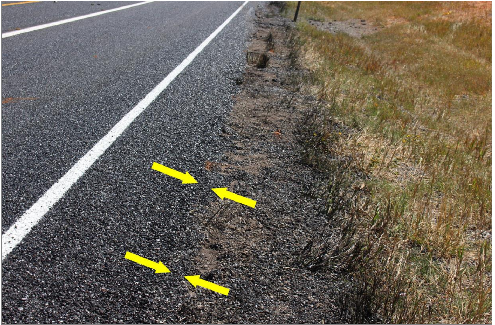
Highway Photograph 5 – Eastbound Pavement Edge Drop-off in Area of Collision – Facing East-Southeast

(The edge drop-off is indicated between the sets of yellow arrows.)