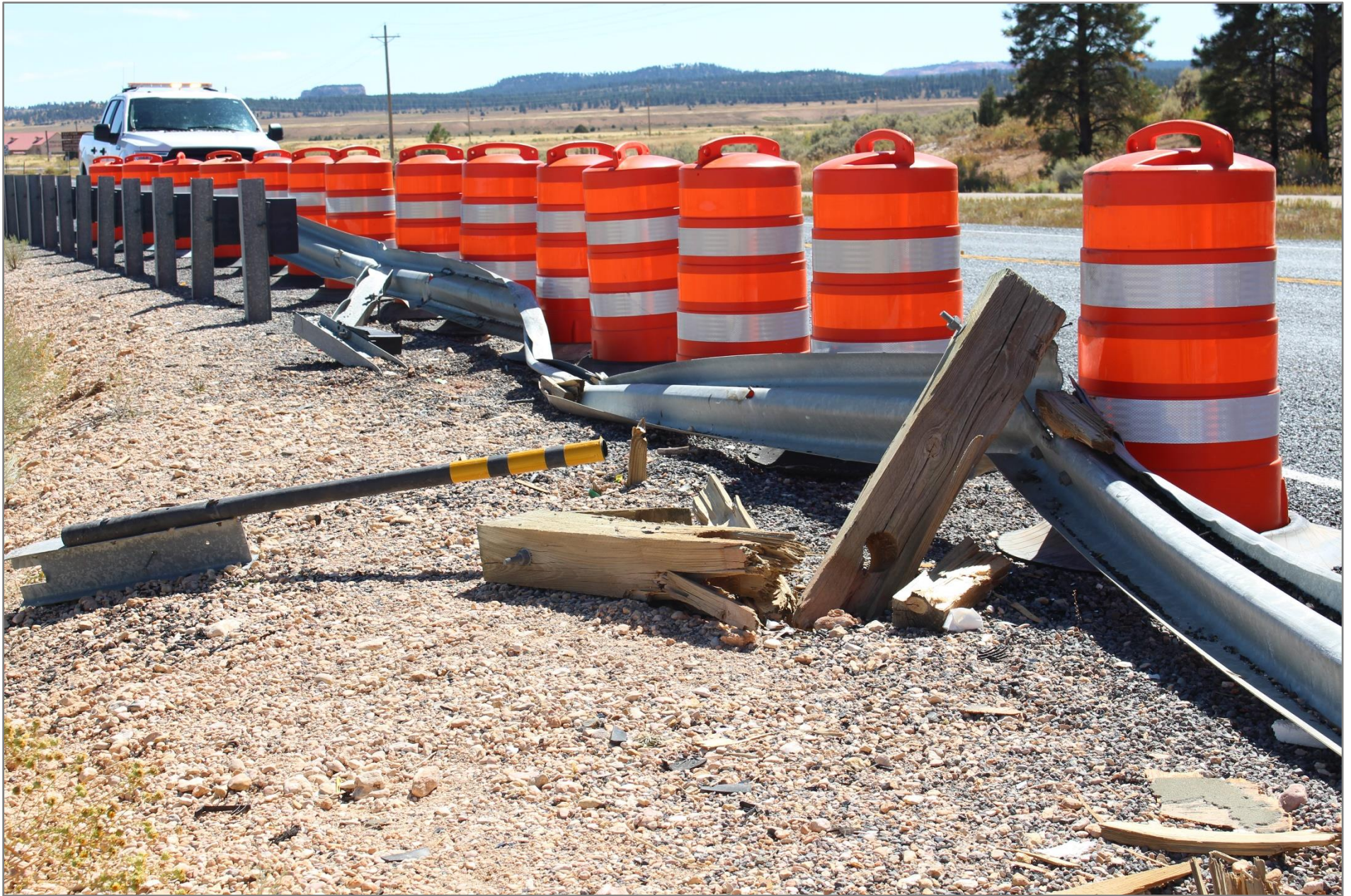
Highway Photograph 8 – Collision Damage to West End of Blocked-Out Strong-Post W-Beam Guardrail