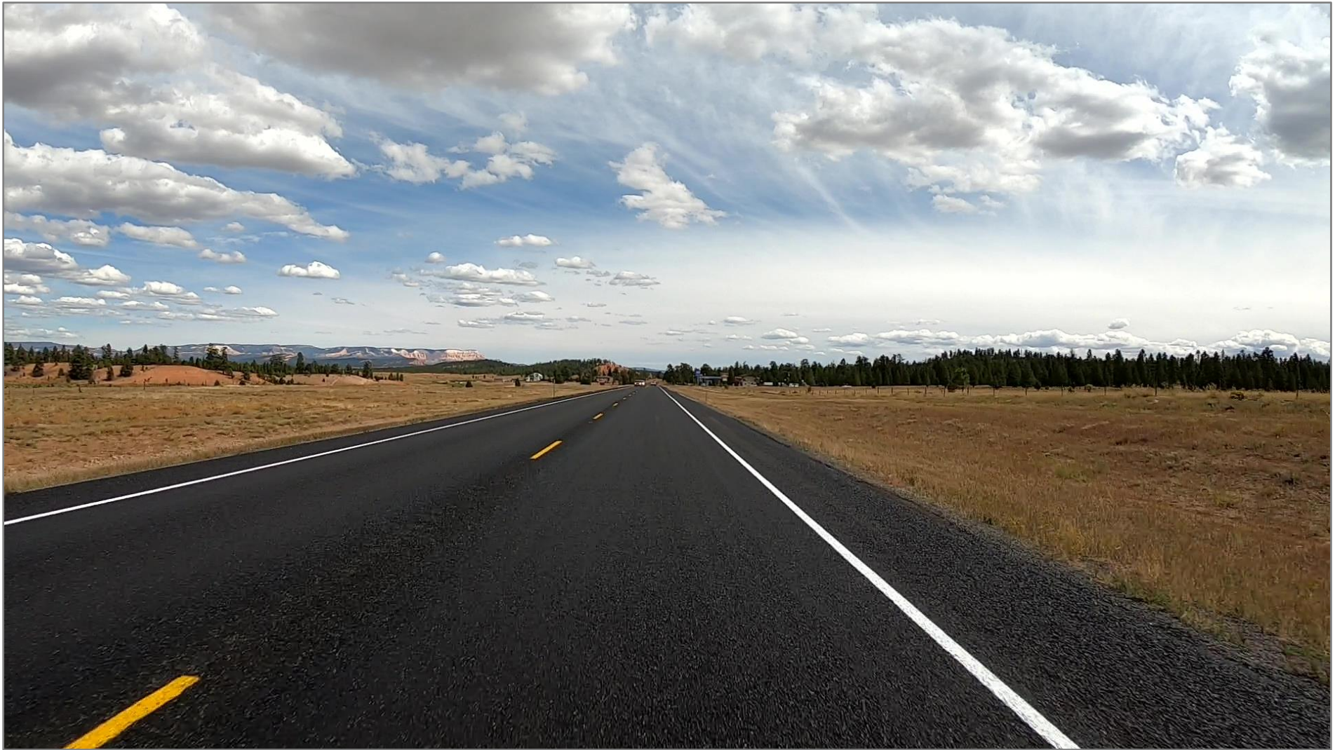
Highway Photograph 2 – SR-12 Eastbound Travel Lane Prior to Crash Location – Facing East