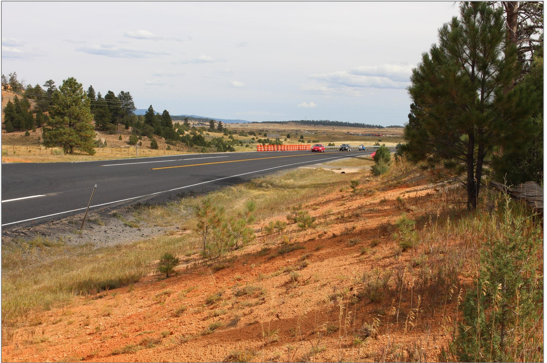
Highway Photograph 4 – Eastbound Clear Zone Along South Side of SR-12 in the Area of the Collision – Facing East