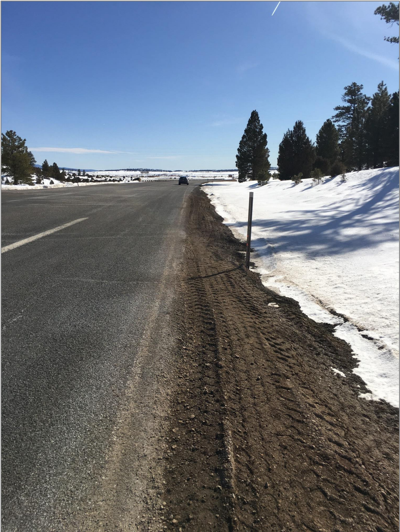
Highway Photograph 6 – Repaired and Re-graded Eastbound Shoulder in Area of Collision – Facing East-Southeast