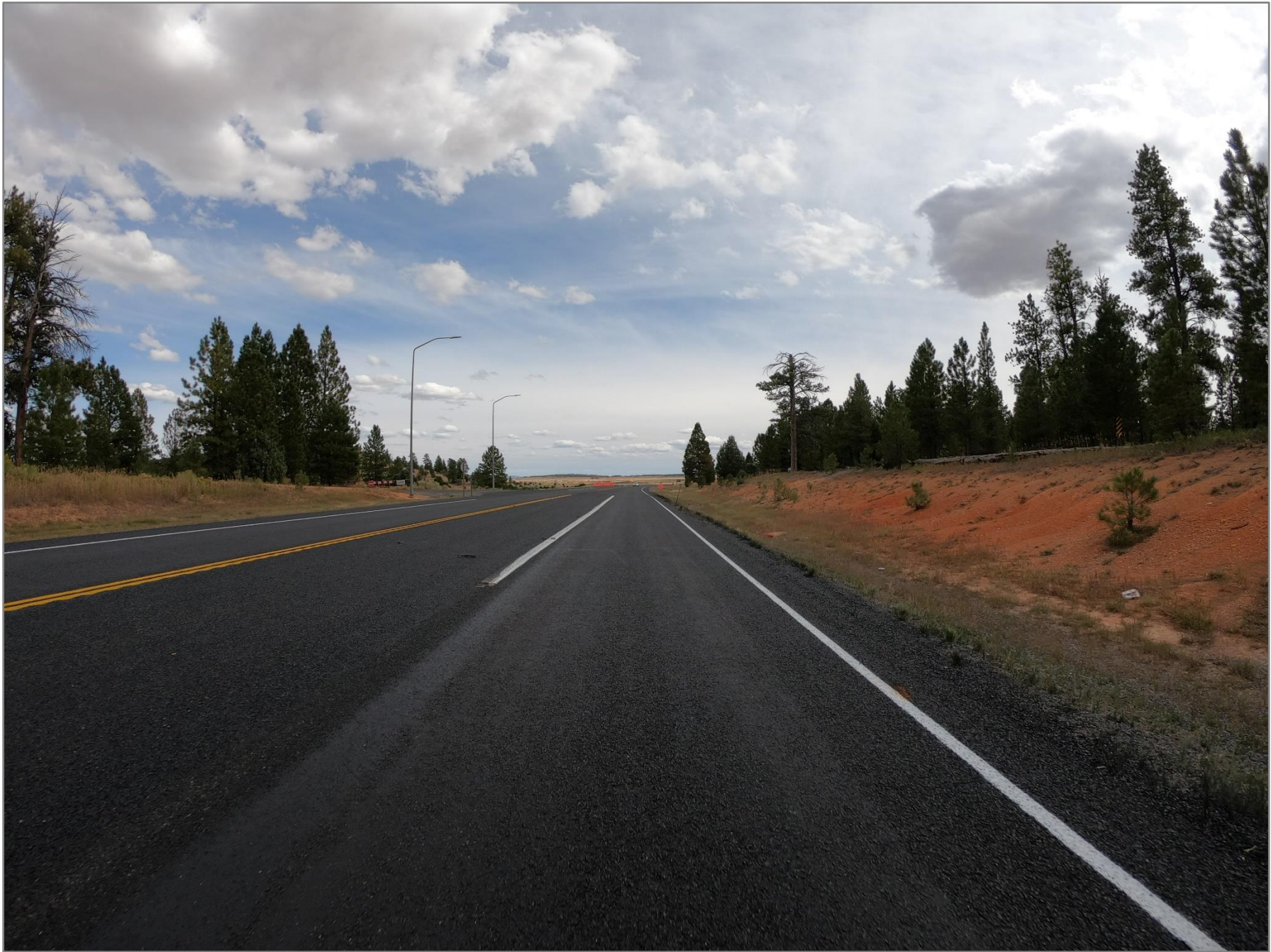
Highway Photograph 3 – SR-12 Eastbound Travel and Dedicated Left Turn Lanes Near Crash Location – Facing East