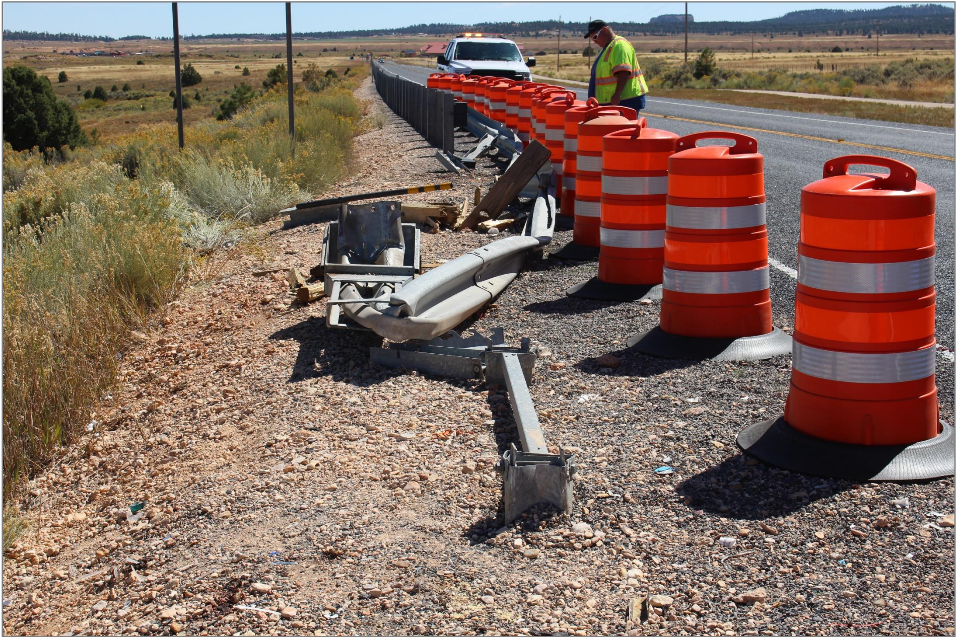
Highway Photograph 7 – West End of Guardrail and End Terminal Showing Collision Damage