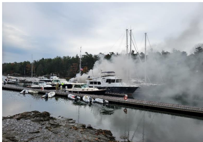
Figure 5 B dock at 0923. Note fire hose running down the dock.