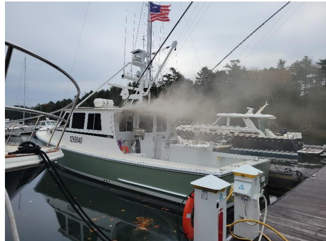
Figure 2 Smoke from Whiskey Business at 0911

0911: Smoke was streaming from the partially open window (aft port corner of the main cabin) on Whiskey Business. The marina staff member and I discussed how we could move other boats away from Whiskey Business. Most boats were winterized and we could not use their engines. We planned to untie them and push them out into the fairway away from the fire.