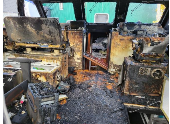
Figure 6 Interior of Whiskey Business

(Note this my personal observation and is not an official determination.)