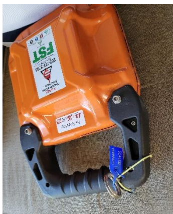
Figure 7 Pin #2 painted yellow