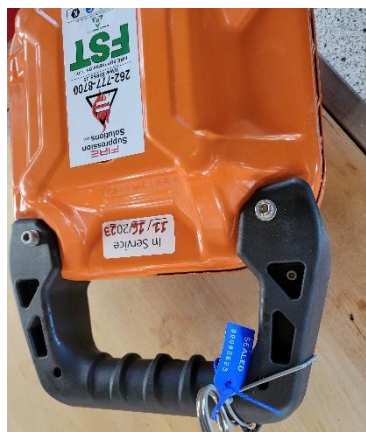
Figure 8 original metal pin #2

I have modified my FST by painting the clip for pin #2 yellow so that it is obvious and hopefully will be more obvious that pin #2 must be also removed to activate the device.