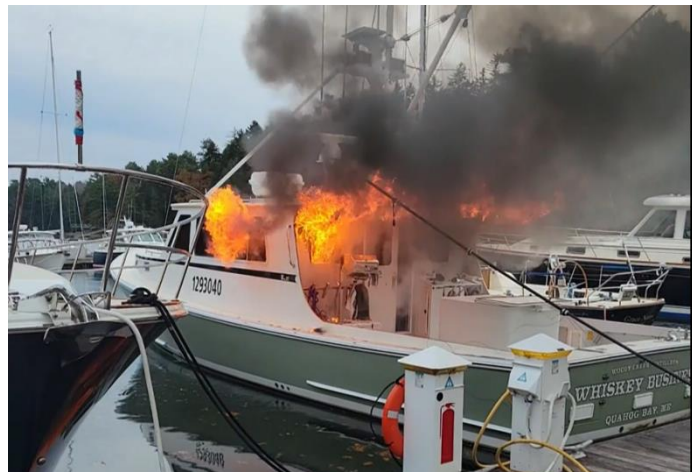
Figure 4 Whiskey Business at 0918