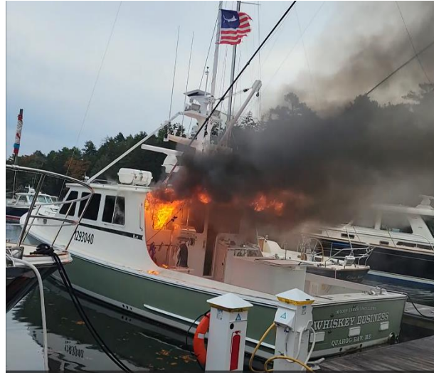
Figure 3 Whiskey Business about 0915

0923 (about): Fire department started fighting the fire with a 2 ½” fire hose that had been run down the docks to the scene. Flames were streaming out of the salon and across the aft deck of Whiskey Business. Most windows had shattered. Heavy smoke had engulfed the 5 boats around Whiskey Business. Only firefighters in protective gear with air tanks could approach Whiskey Business. All others evacuated from the dock.