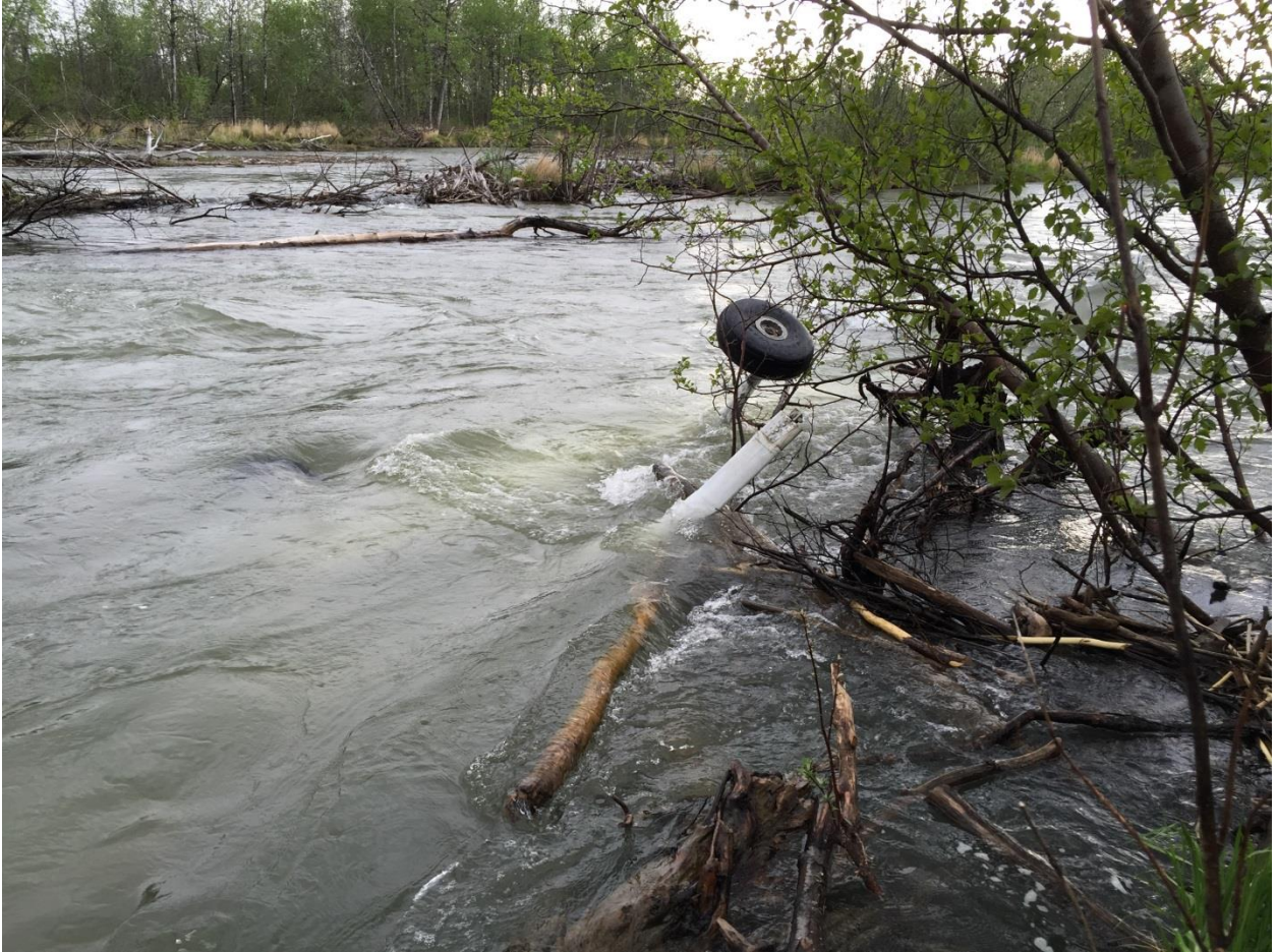
Figure 3: Left main landing gear sticking out of the water