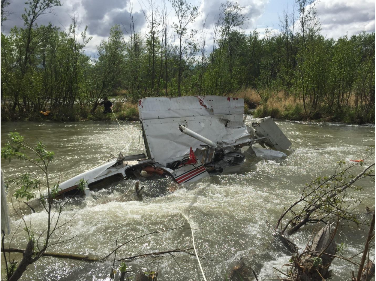
Figure 5: Side view of aircraft partially submerged in river