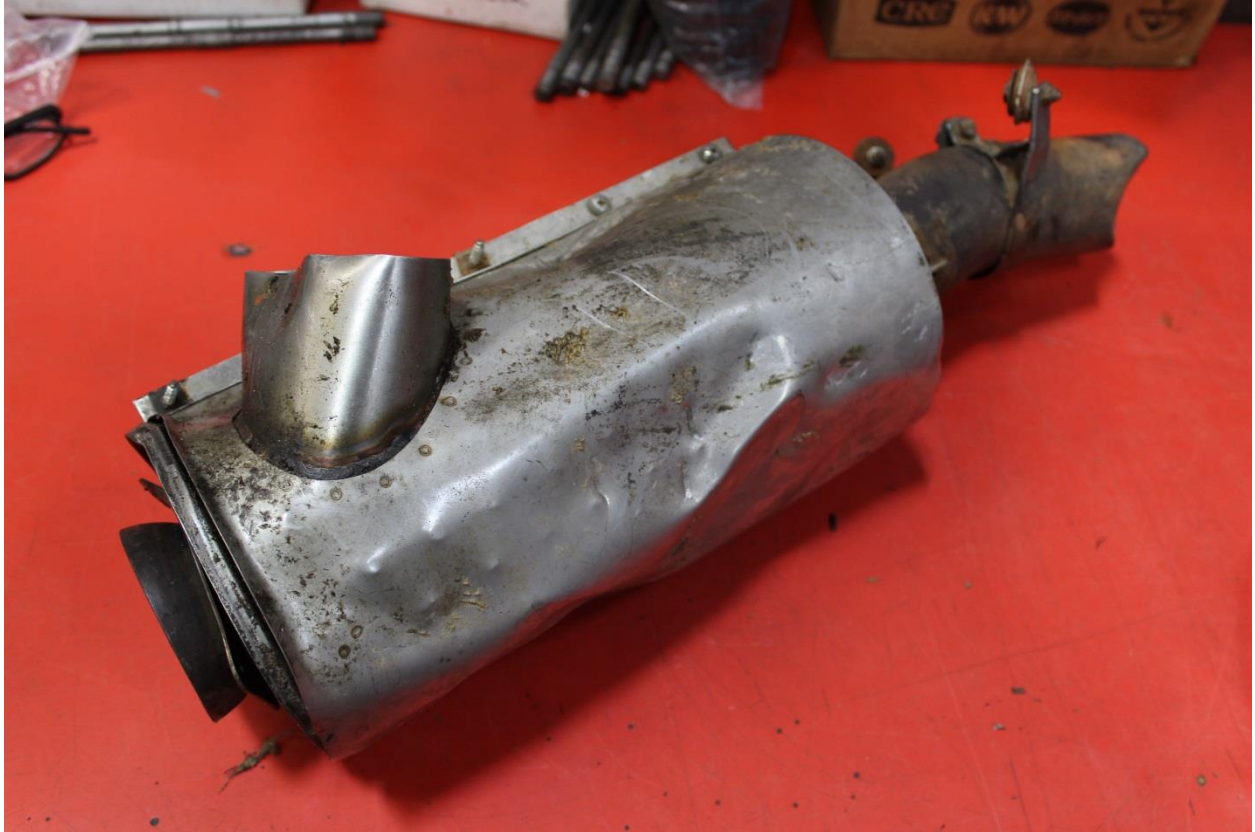
Figure 8: Right side exhaust muffler and heat shroud