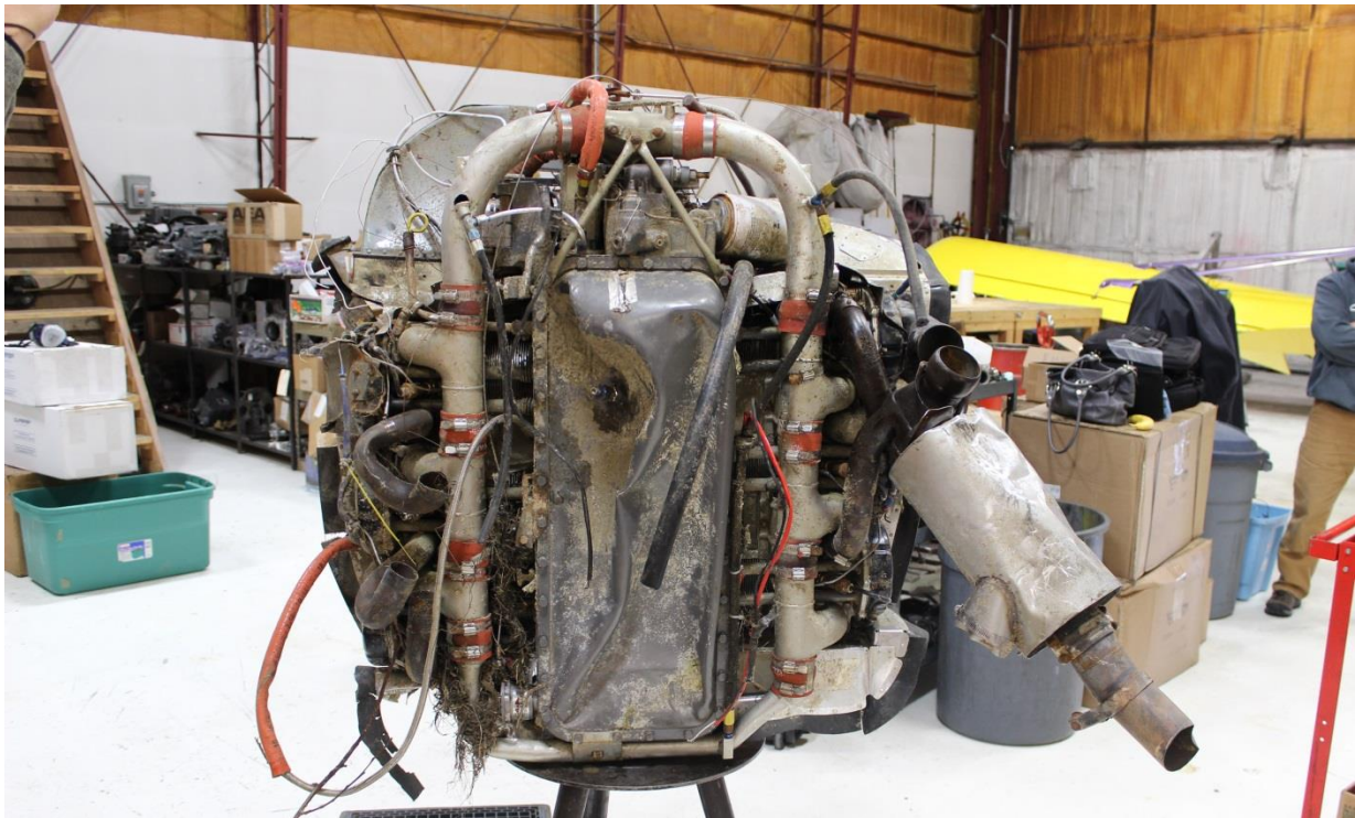
Figure 10: Bottom view of engine on stand