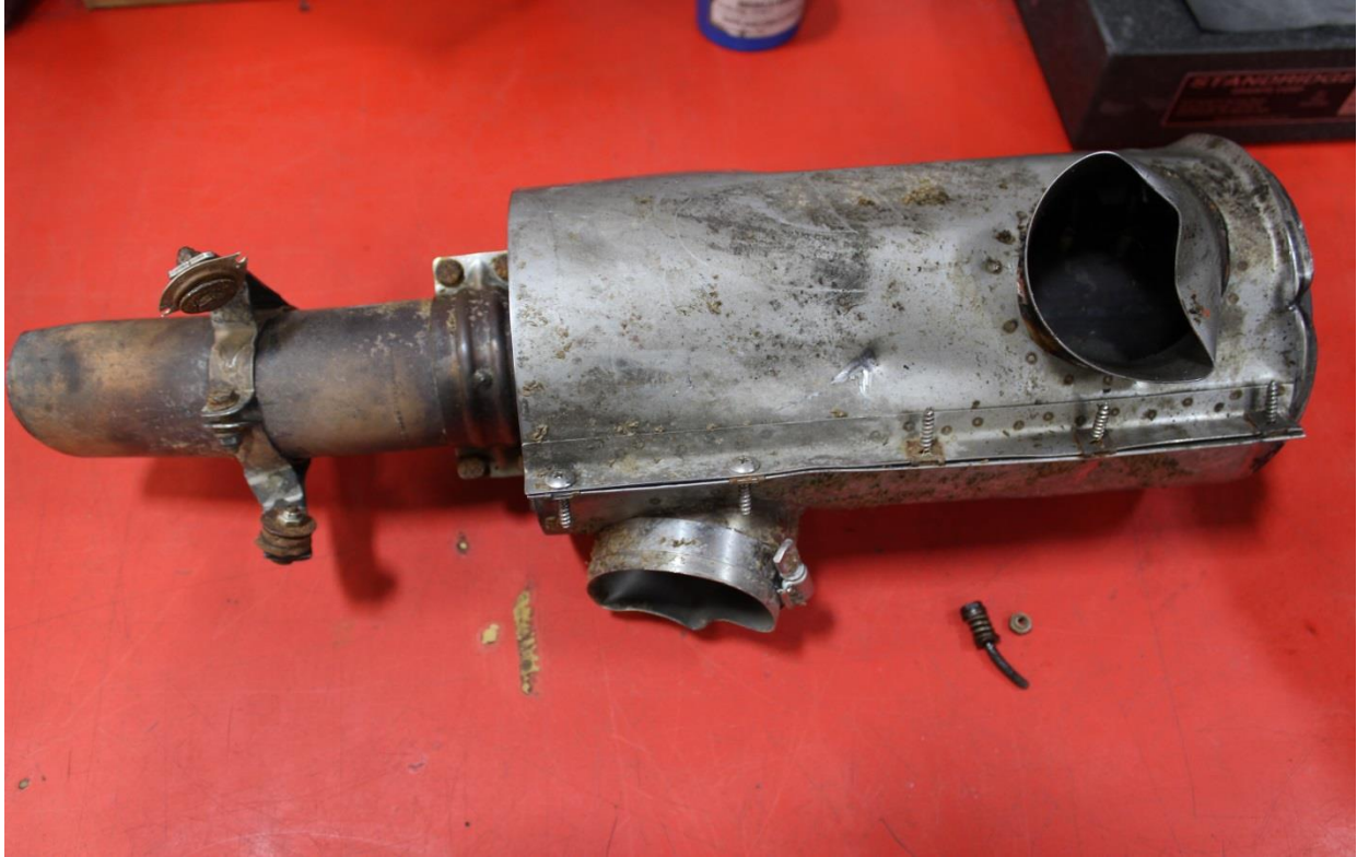
Figure 9: Right side exhaust muffler top view