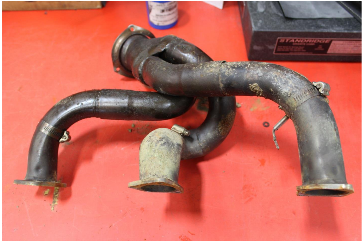
Figure 7: Right side exhaust stack