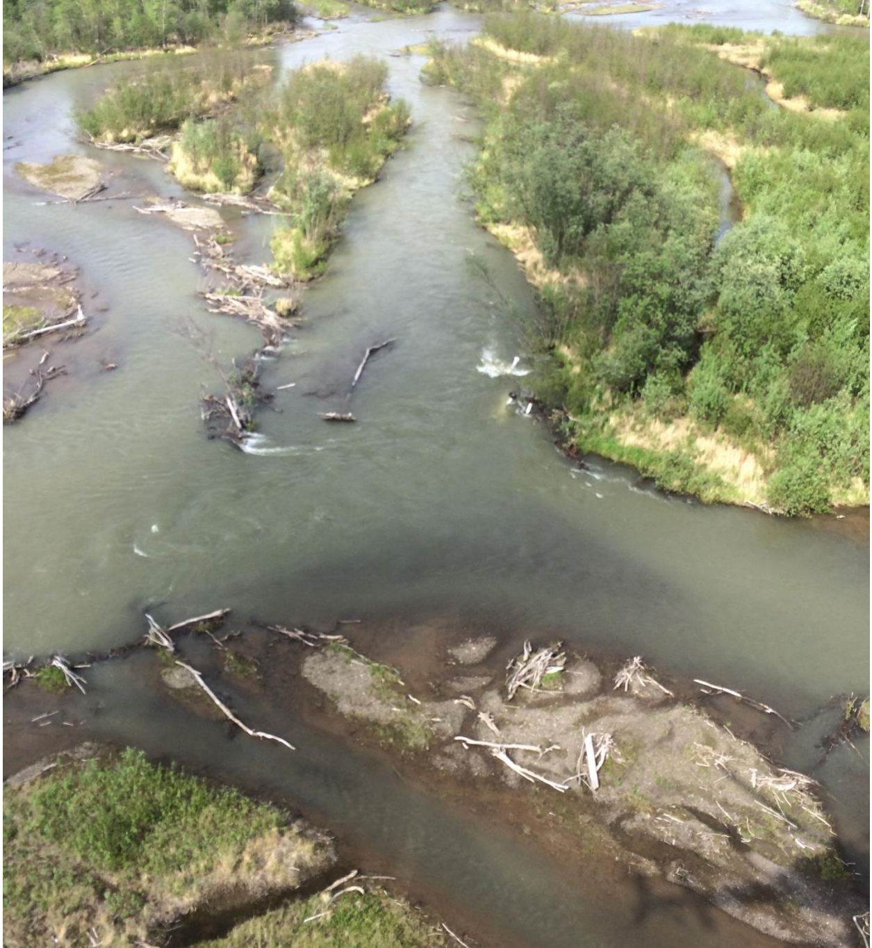
Figure 2: Aerial view of the airplane submerged in river