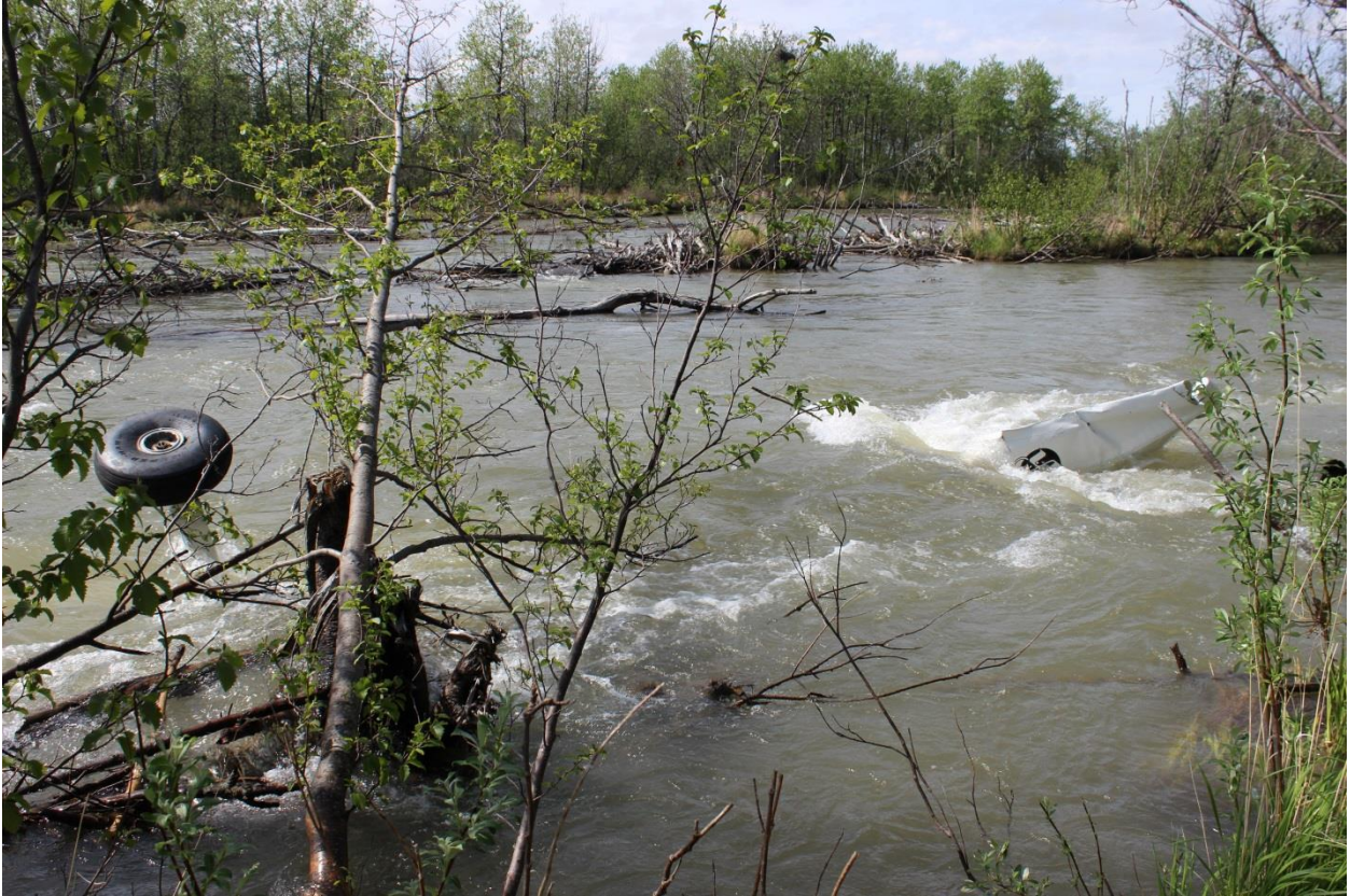
Figure 1: Aircraft submerged in river