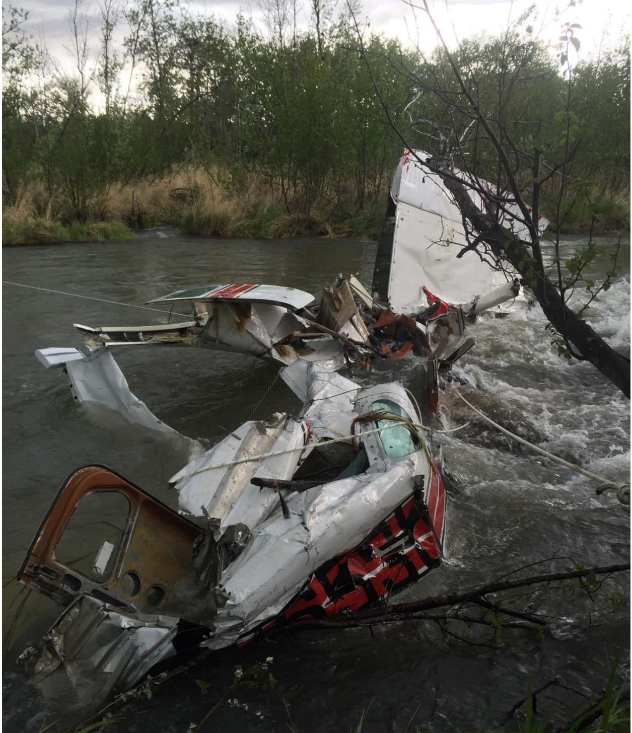
Figure 4: Aircraft partially submerged in river