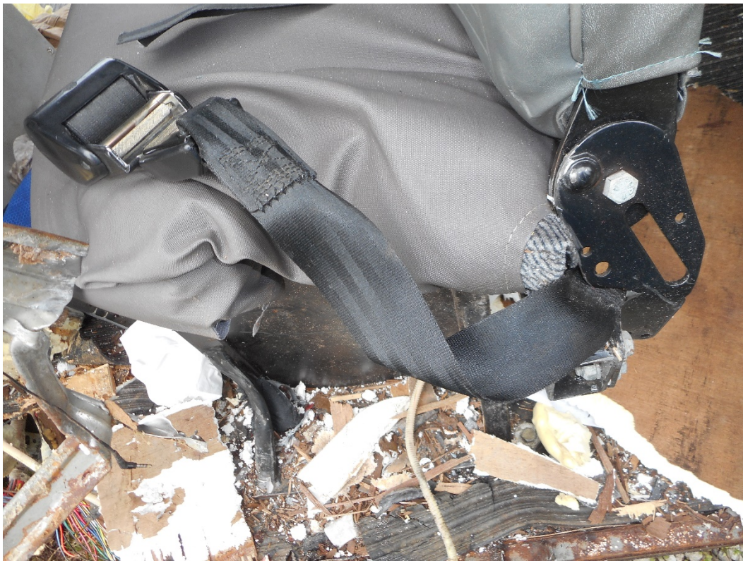
Photo 11 – View of seat damage and cut lap belt for partially ejected passenger.