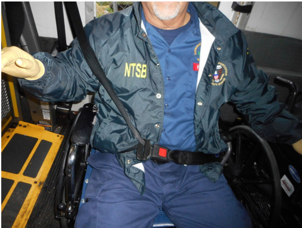
Photo 24 – Interior view looking at improper restraint placement for right rear wheelchair passenger in Goshen bus.