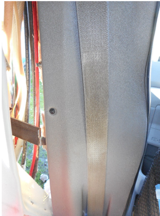
Photo 8 – View of heat abrasion mark on shoulder belt webbing of bus drivers seat belt.