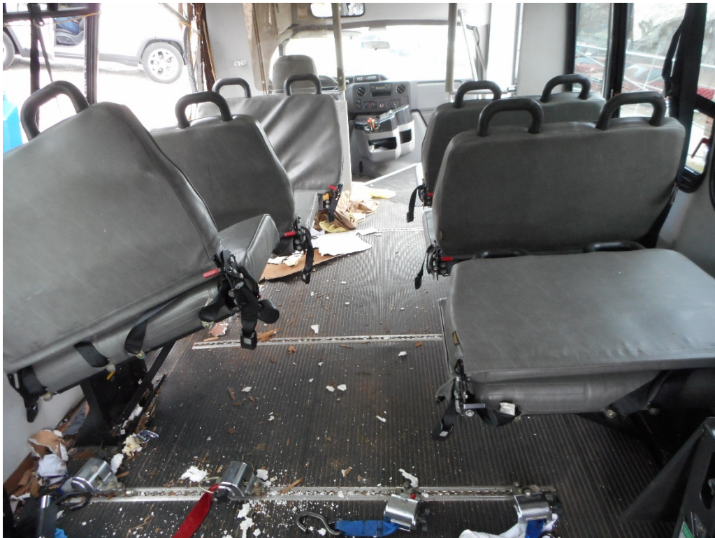
Photo 14 – Interior view looking from rear to front in Goshen bus showing seat damage.