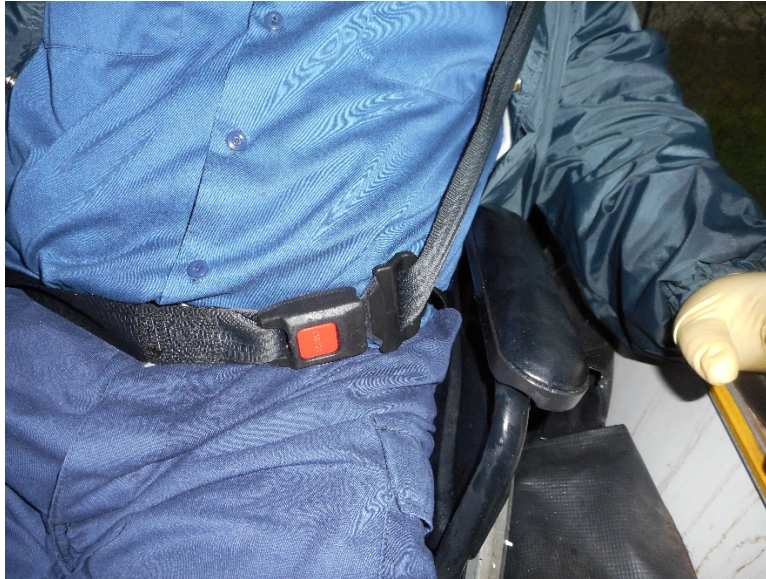
Photo 19 – Interior view looking at improper placement of lap/shoulder restraint for left rear wheelchair in Goshen bus.