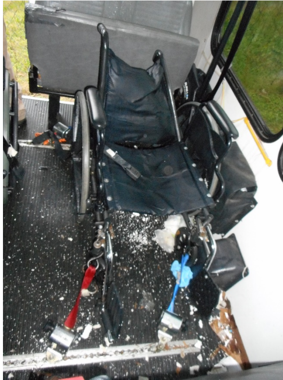
Photo 15 – Interior view looking from front at left side wheelchair securement positions in Goshen bus.