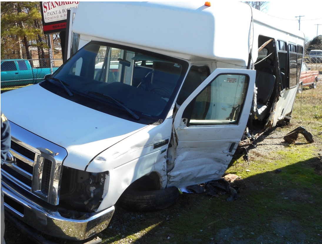
Photo 1 – Frontal left angle view of deformation to left side of 2009 Ford E350 with Goshen 14-passenger medium-size bus body.