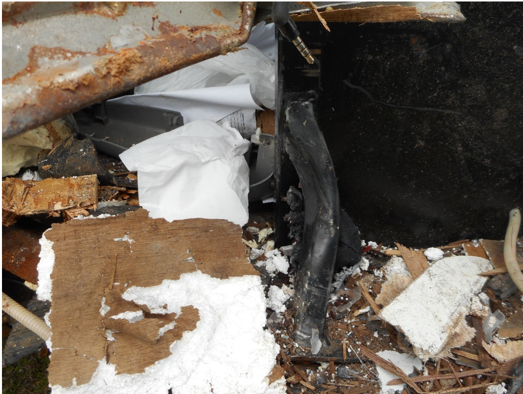
Photo 4 – Close-up of deformation to first row seat anchor. (NOTE: rusted metal with Styrofoam insulation attached to thin particle board illustrates inadequate construction of sidewalls in medium-size buses.)