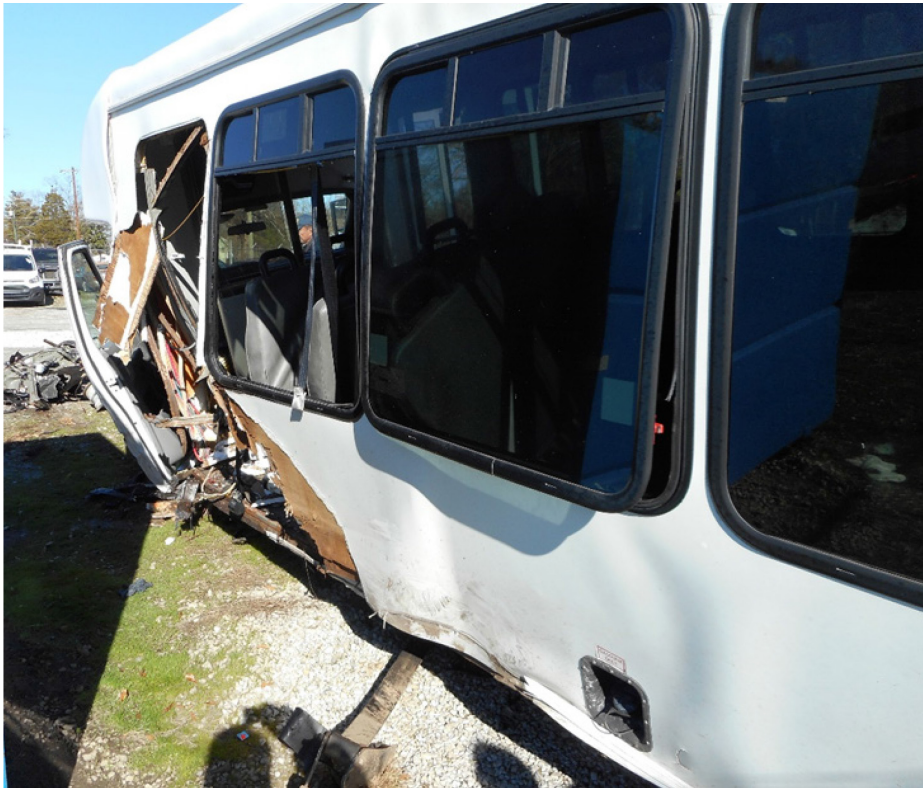
Photo 5 – Left rear angle view of left side damage to Goshen 14-passenger medium-size bus body.