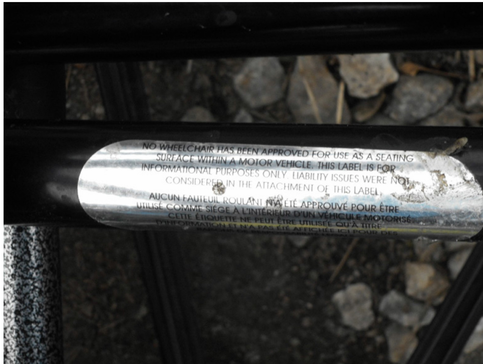
Photo 29 – View of label on wheelchairs stating they are not to be used for seating in a motor vehicle.