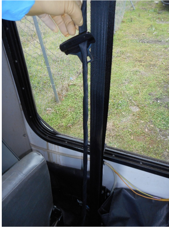
Photo 17 – Interior view looking at severely twisted left side wheelchair shoulder restraint in Goshen bus.