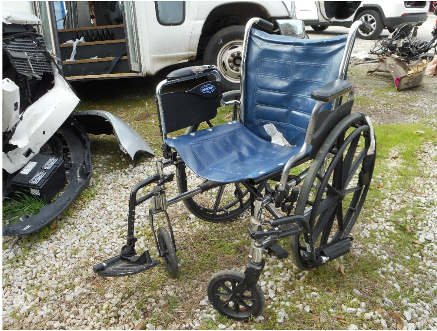
Photo 27 – View looking at damaged left swing away leg rest on wheelchair.