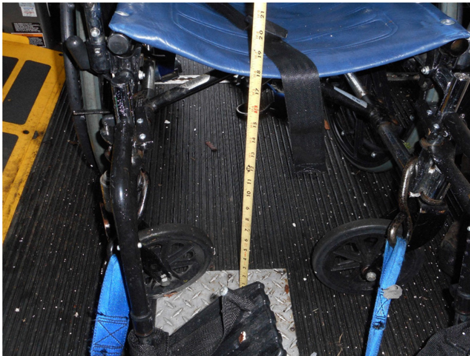
Photo 21 – Interior view looking at right wheelchair securement straps in Goshen bus.