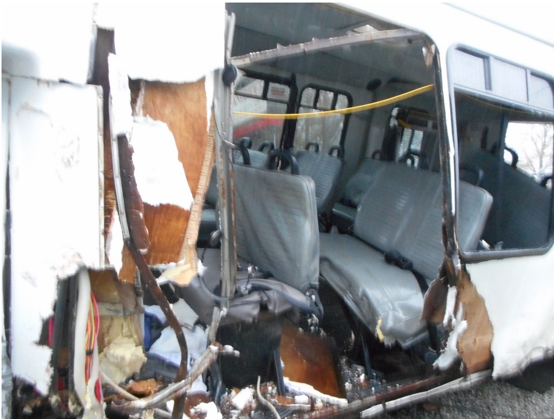
Photo 3 – Left side close-up view of damage and integrity loss to Goshen bus body.