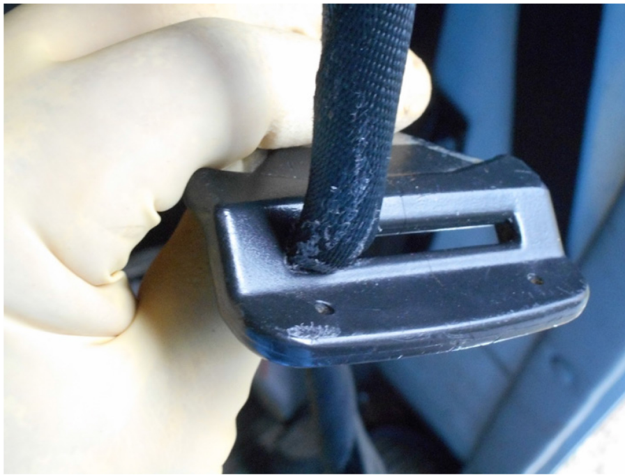
Photo 23 – Interior close-up view looking at heavy heat abrasion to shoulder restraint for right wheelchair passenger. (NOTE: webbing twisted similar to left side wheelchair shoulder restraint.)