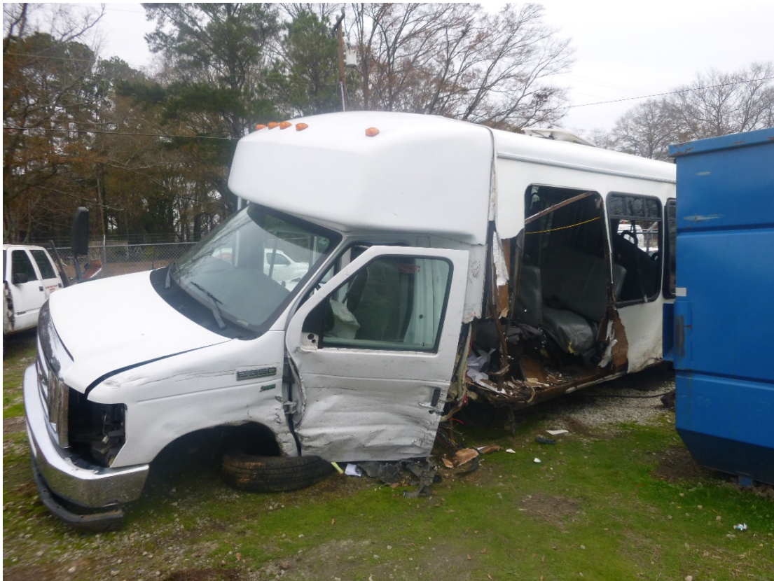
Photo 2 – Left side angle view of deformation and integrity loss to left side of bus chassis and body.