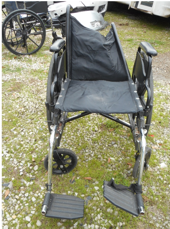
Photo 26 – Frontal view looking at damaged left hand grip on wheelchair.