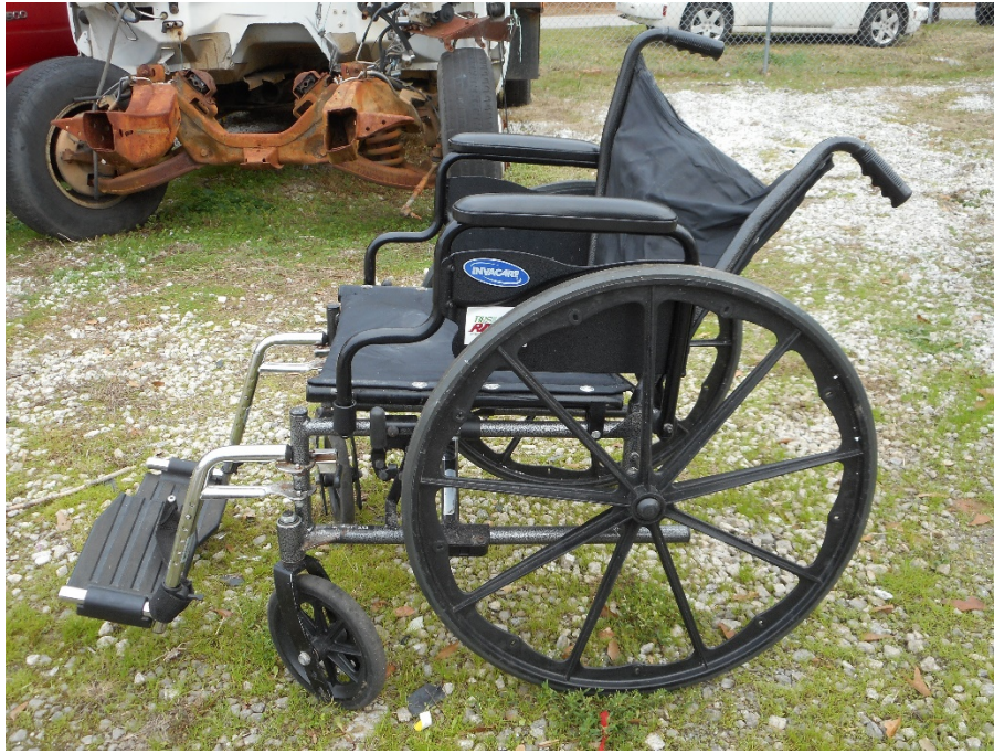
Photo 25 – Side view looking at damaged left hand grip on wheelchair.