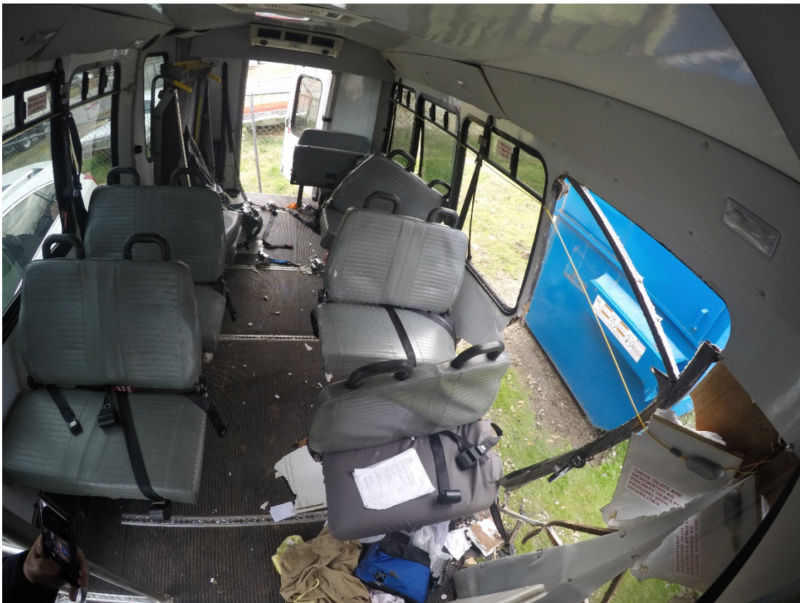
Photo 9 – Interior fisheye view looking from front to rear at interior bus damage.