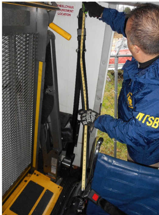
Photo 22 – Interior view of right rear wheelchair shoulder restraint on back wall in Goshen bus.