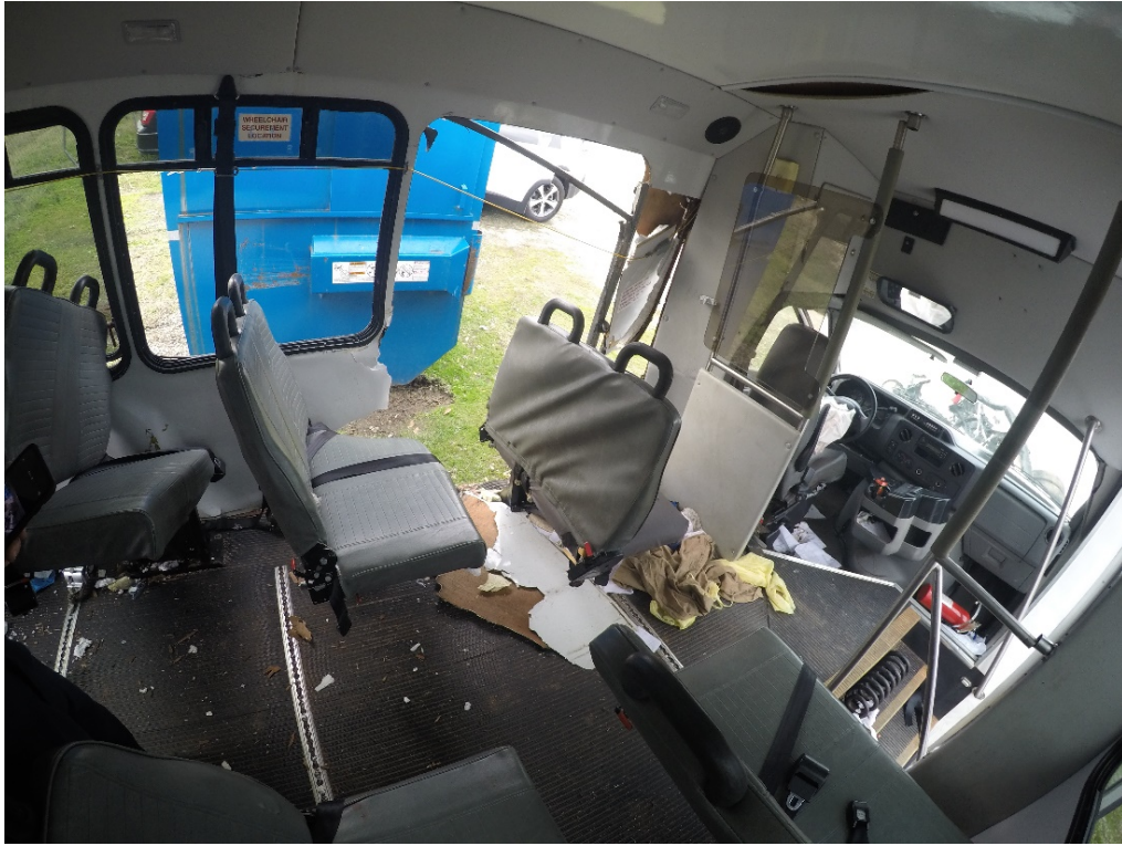
Photo 13 – Interior view looking at damage and area of integrity loss in Goshen bus.