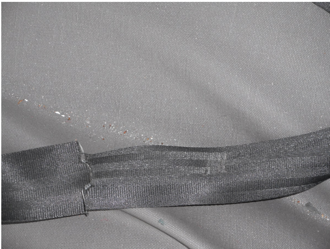
Photo 12 – Close-up view of cut lap belt webbing showing area of heat abrasion.