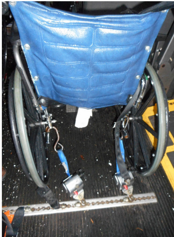
Photo 20 – Interior view looking at right wheelchair rear securement positions in Goshen bus.