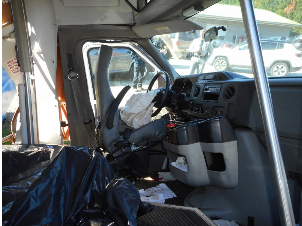
Photo 7 – Interior view of driver seating area showing seat damage from ACM removal and deployed airbag.