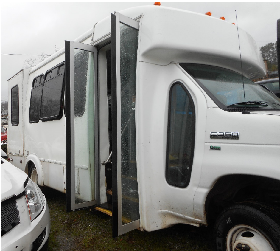
Photo 6 – Right side view of 2009 Ford E350 chassis with a Goshen Coach, Inc. 14-passenger medium-size bus body. (NOTE: wheelchair lift door in rear).