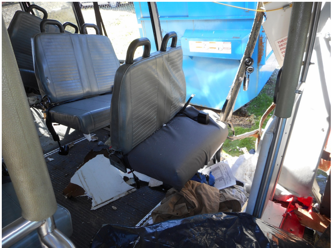
Photo 10 – Interior view of first row seat damage and area of integrity loss to bus.