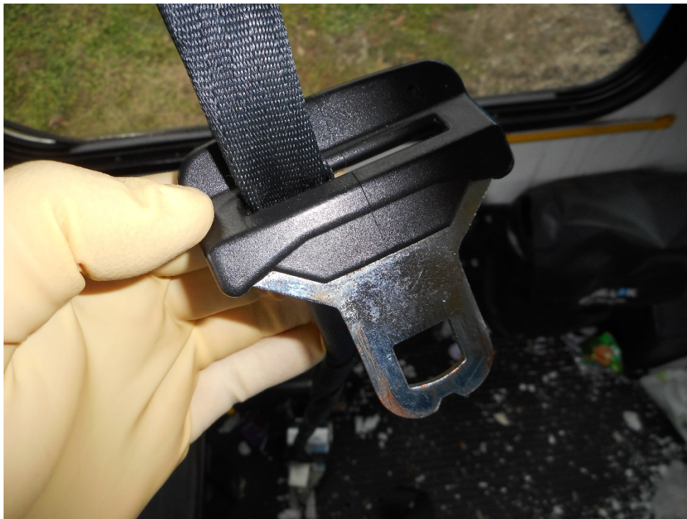
Photo 18 – Interior close-up view of left side wheelchair shoulder belt latchplate in Goshen bus.