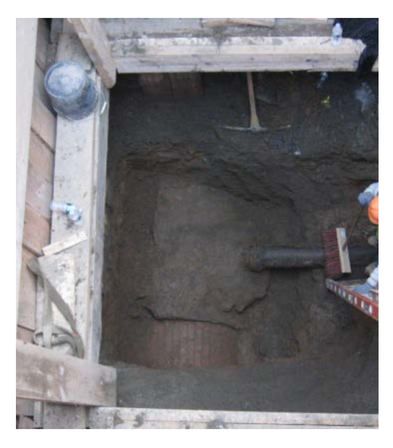
Figure 3: Direct Connection of 1642 Park Avenue lateral into the combined Sewer Main without "a riser".