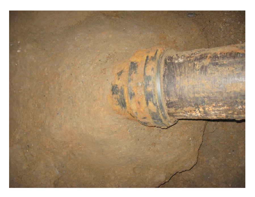
Figure 4: Close north side view of direct connection of 1642 Park Avenue Sewer lateral into the combined Sewer Main without "a riser".