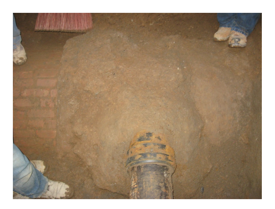
Figure 5: Close top view of direct connection of 1642 Park Avenue Sewer lateral into the combined Sewer Main without "a riser".