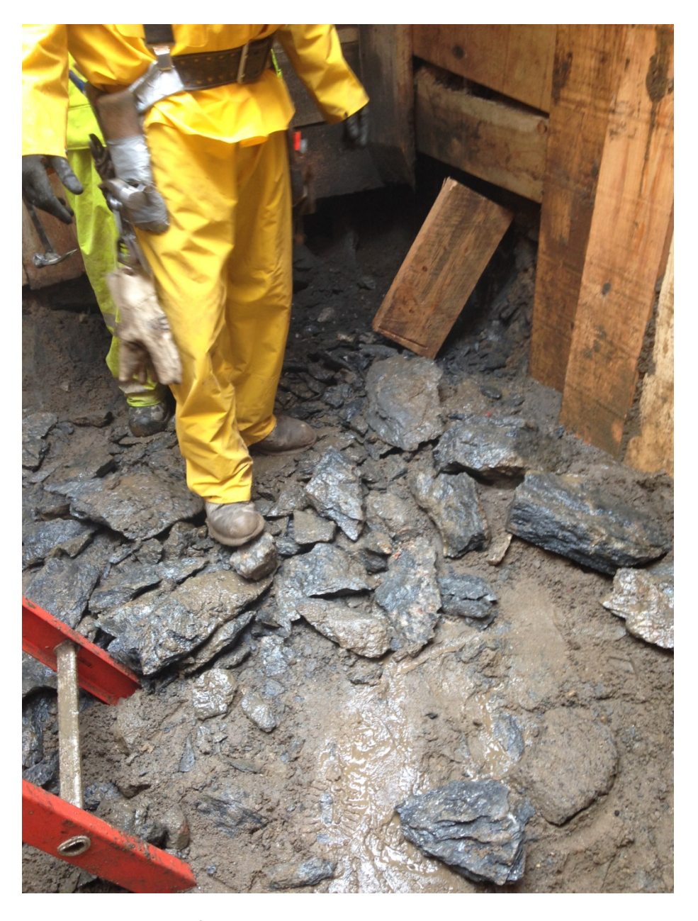
Figure 1: Excavation for the sewer connection at 1642 Park Avenue revealed presence of boulders in the backfill materials.