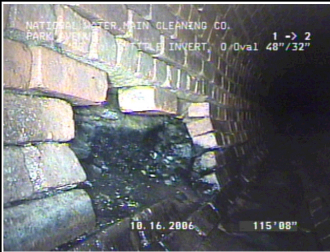
NY DEP Sewer video Pre-accident inspection October 16, 2006