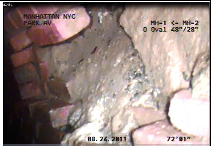
NY DEP Sewer video Pre-accident inspection August 24, 2011