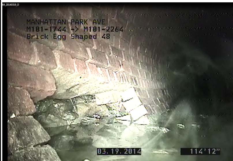
NY DEP Sewer video Post-accident inspection March 19, 2014

Camera inspection of the sewer was performed after the accident