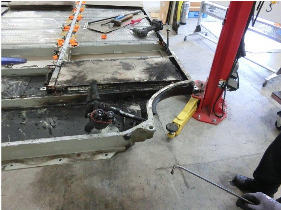
Sunnyvale Inspection Photo 10: view showing the left front of the battery pack with some components removed