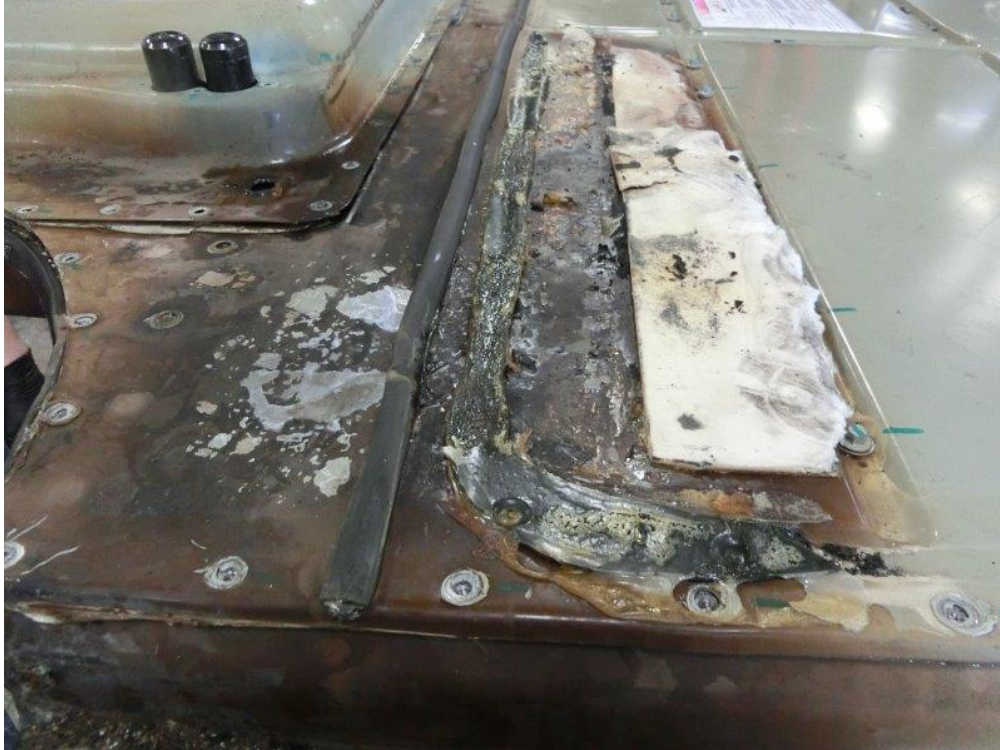
Sunnyvale Inspection Photo 6: view showing the upper left front of the battery pack at beginning stage of cover removal