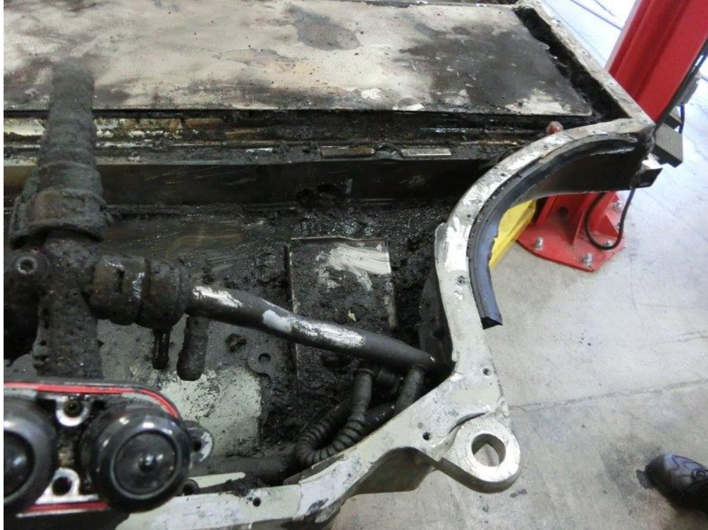
Sunnyvale Inspection Photo 11: detail view of the left front of the battery pack