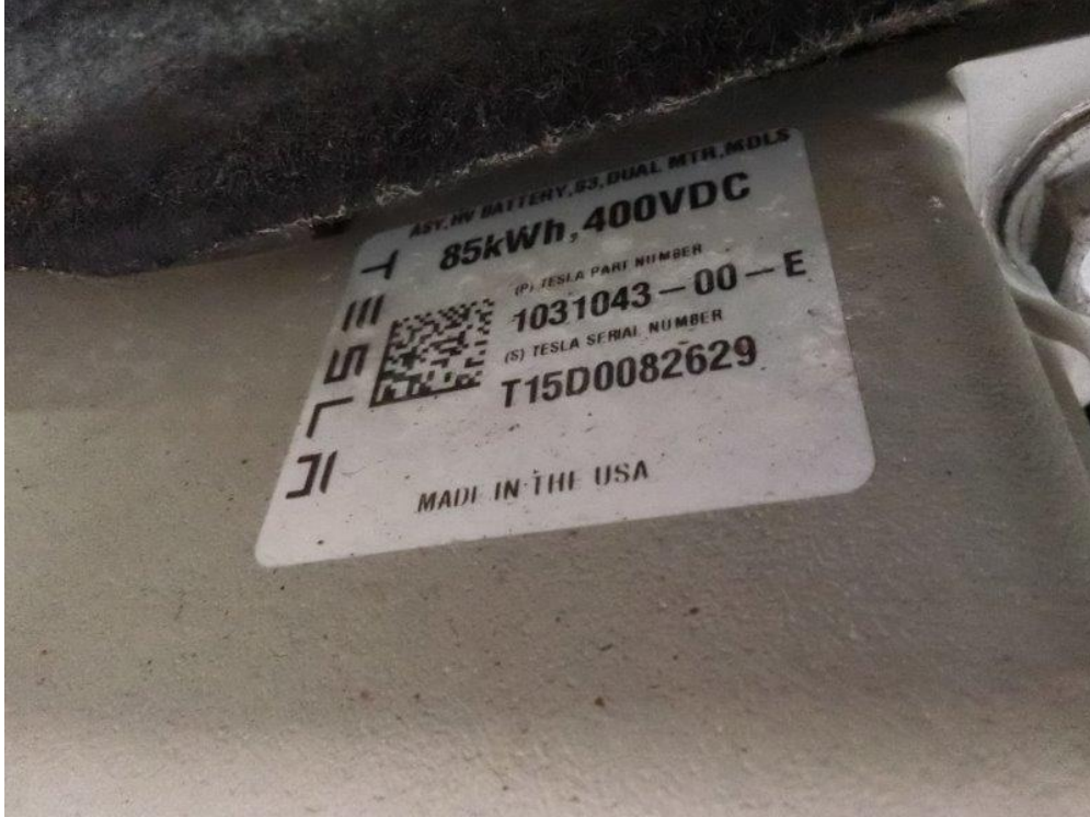
Sunnyvale Inspection Photo 2: view showing the battery pack label