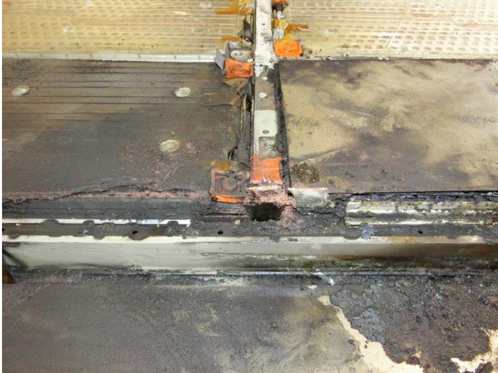
Sunnyvale Inspection Photo 9: view showing a detailed view of the front center of the battery pack with front modules removed