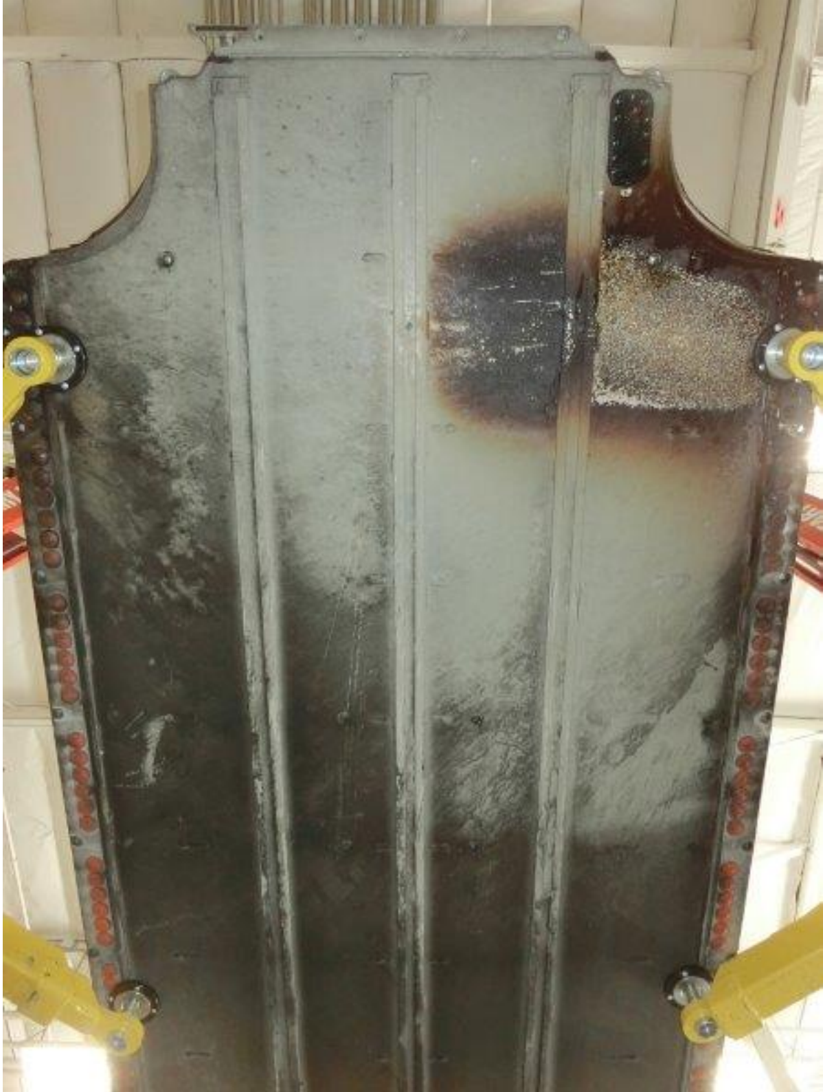
Sunnyvale Inspection Photo 3: view showing underside of Tesla battery pack