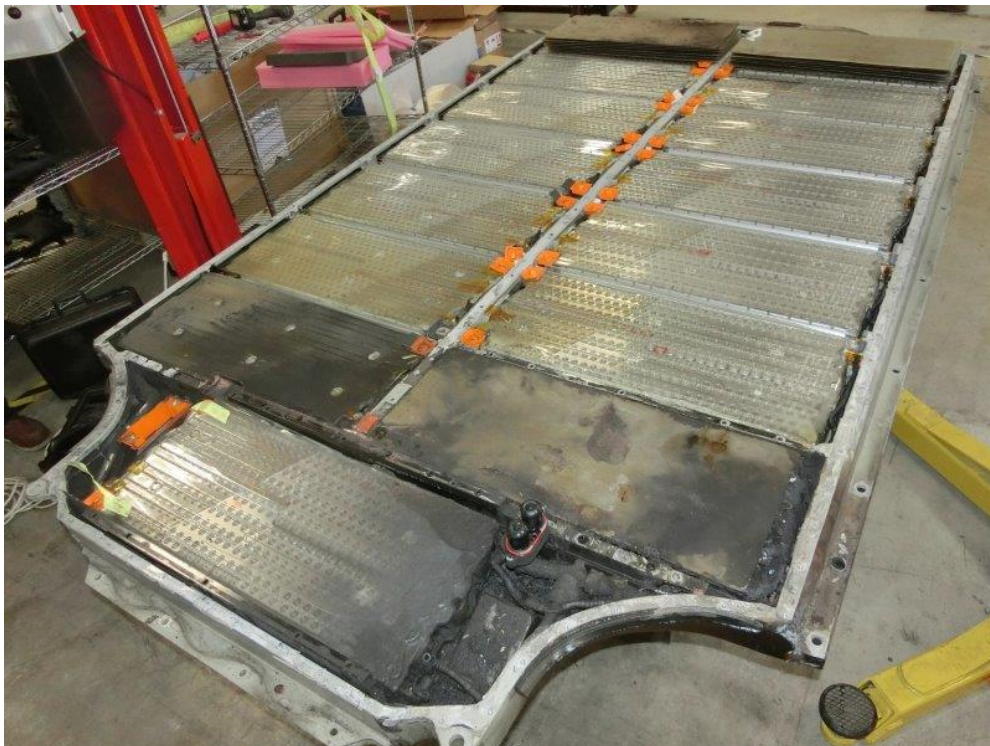
Sunnyvale Inspection Photo 7: view showing the upper side of battery pack with covers removed