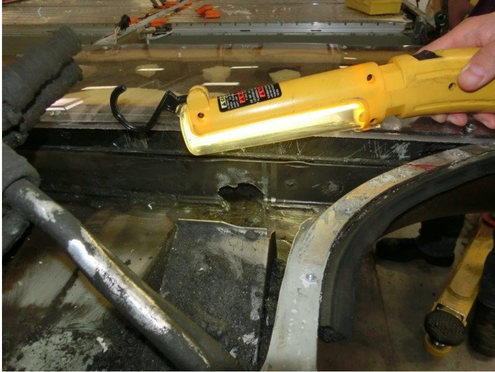
Sunnyvale Inspection Photo 13: detail view of damage to the left front battery case