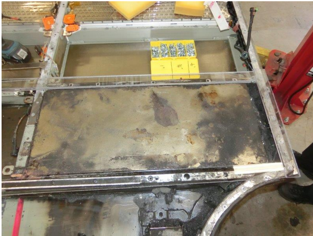
Sunnyvale Inspection Photo 14: view of left front battery case