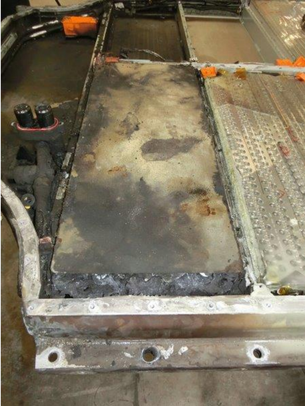
Sunnyvale Inspection Photo 8: view showing the front of the battery pack with some modules and components removed