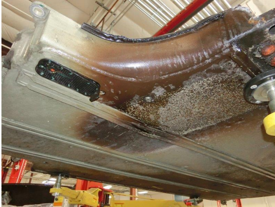
Sunnyvale Inspection Photo 4: view showing underside left front corner of battery pack