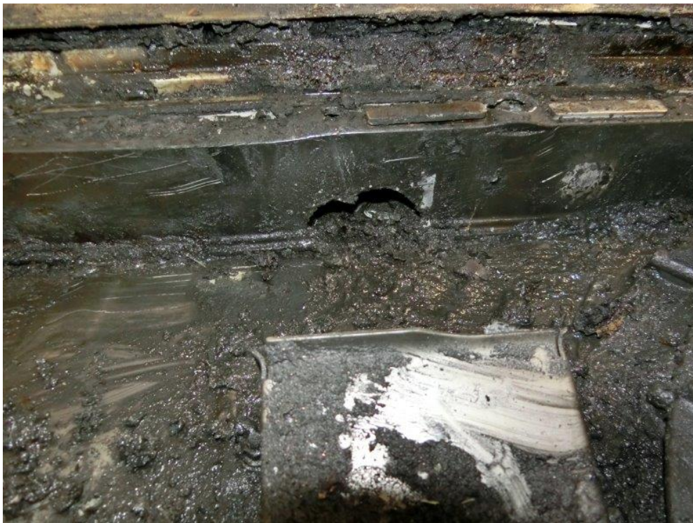
Sunnyvale Inspection Photo 12: detail view of damage to the left front battery case