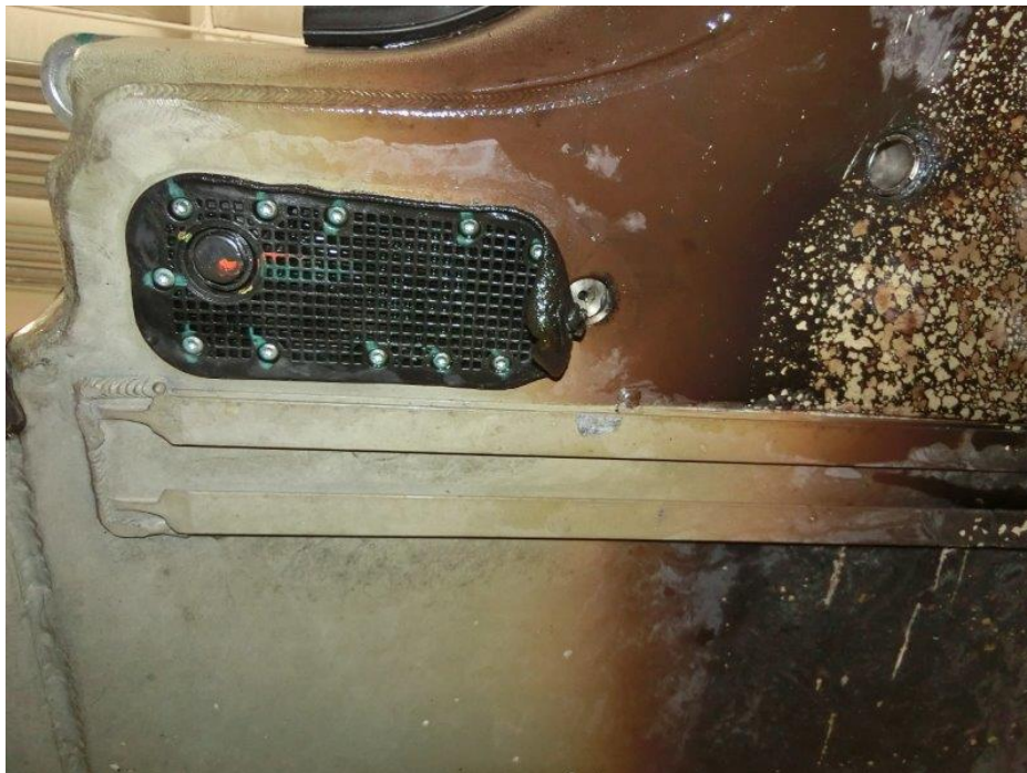
Sunnyvale Photo 5: view showing detail of the underside of the battery pack