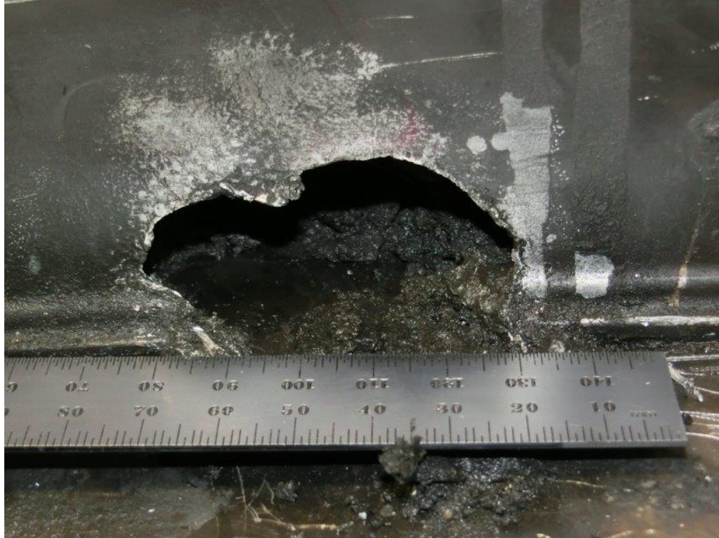
Sunnyvale Inspection Photo 15: detail view of the damage to battery case