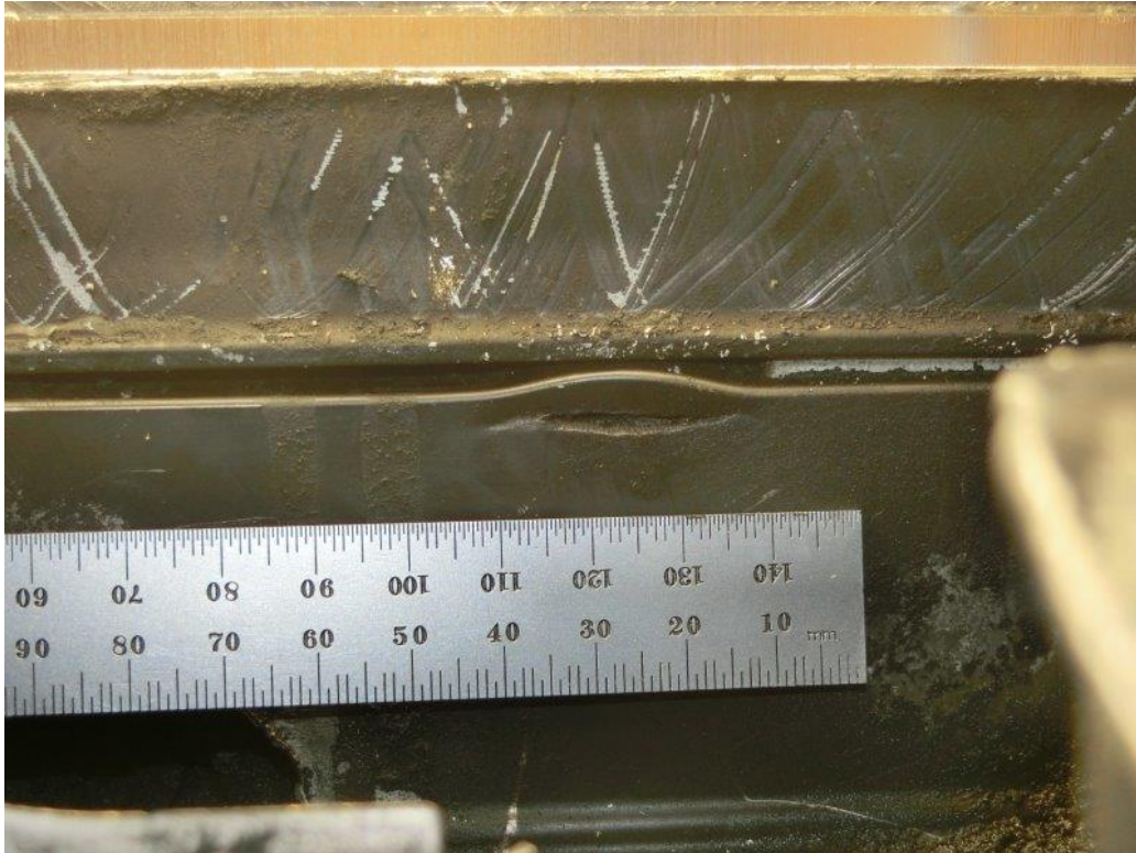
Sunnyvale Inspection Photo 16: detail view of damage to battery case