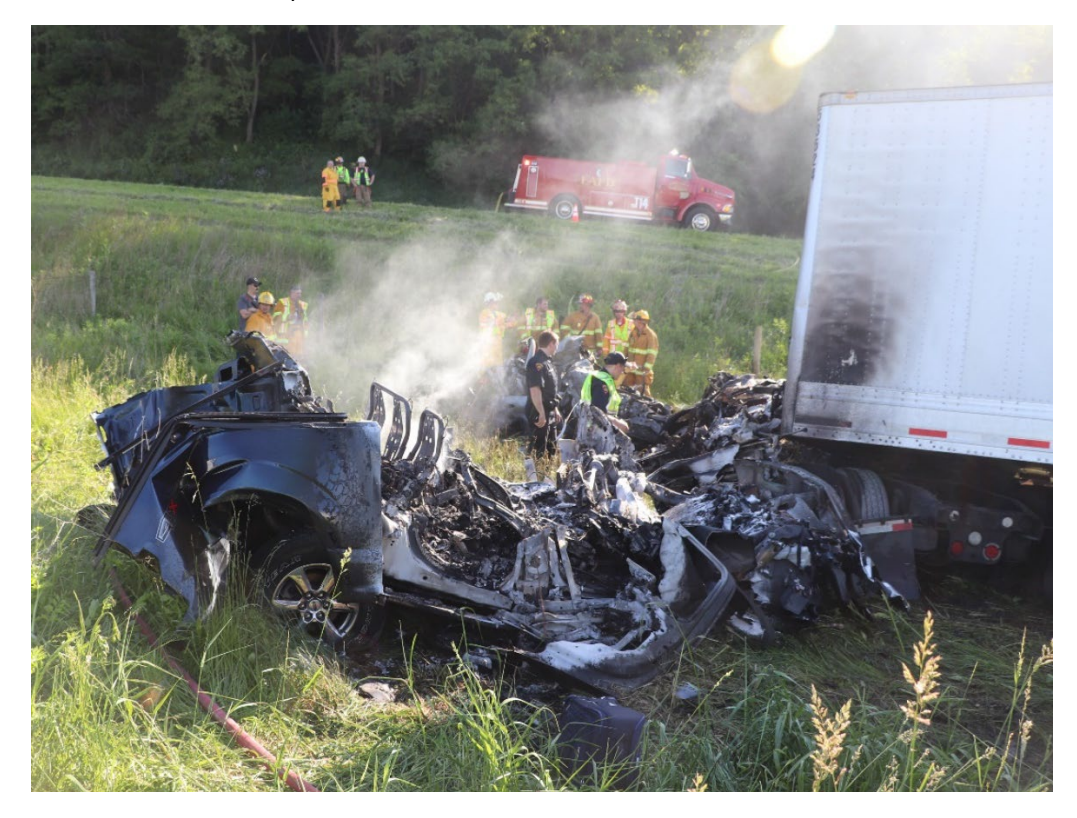
Photograph 6: Scene photograph showing the 2018 Mack truck at point of final rest.