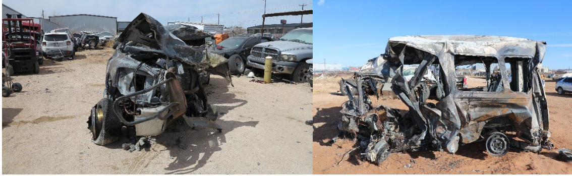
Figure 1. Damage to pickup truck (left) and transit van (right) from impact and postcrash fire.