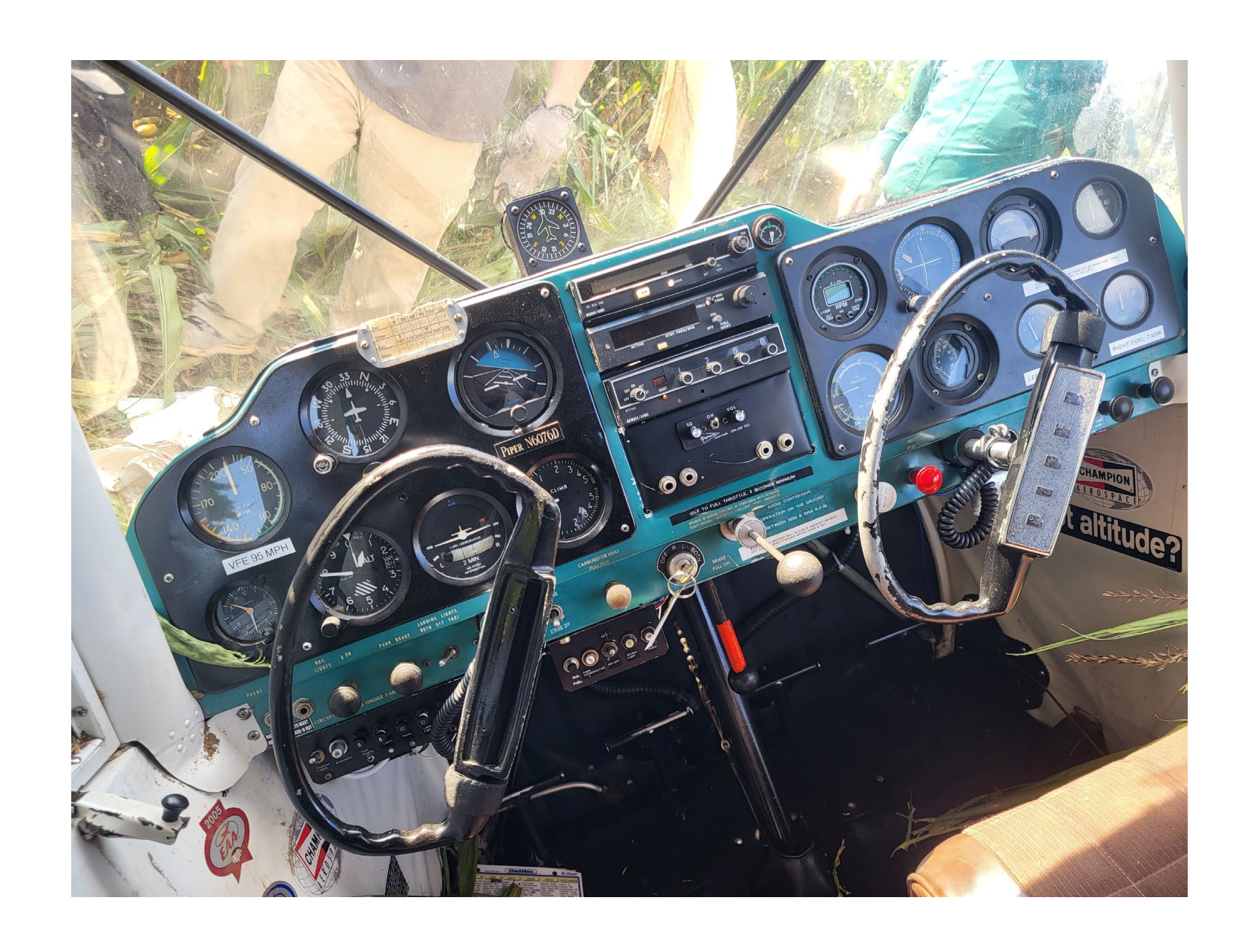
Photo 4 – Cockpit controls and instrument panel view.