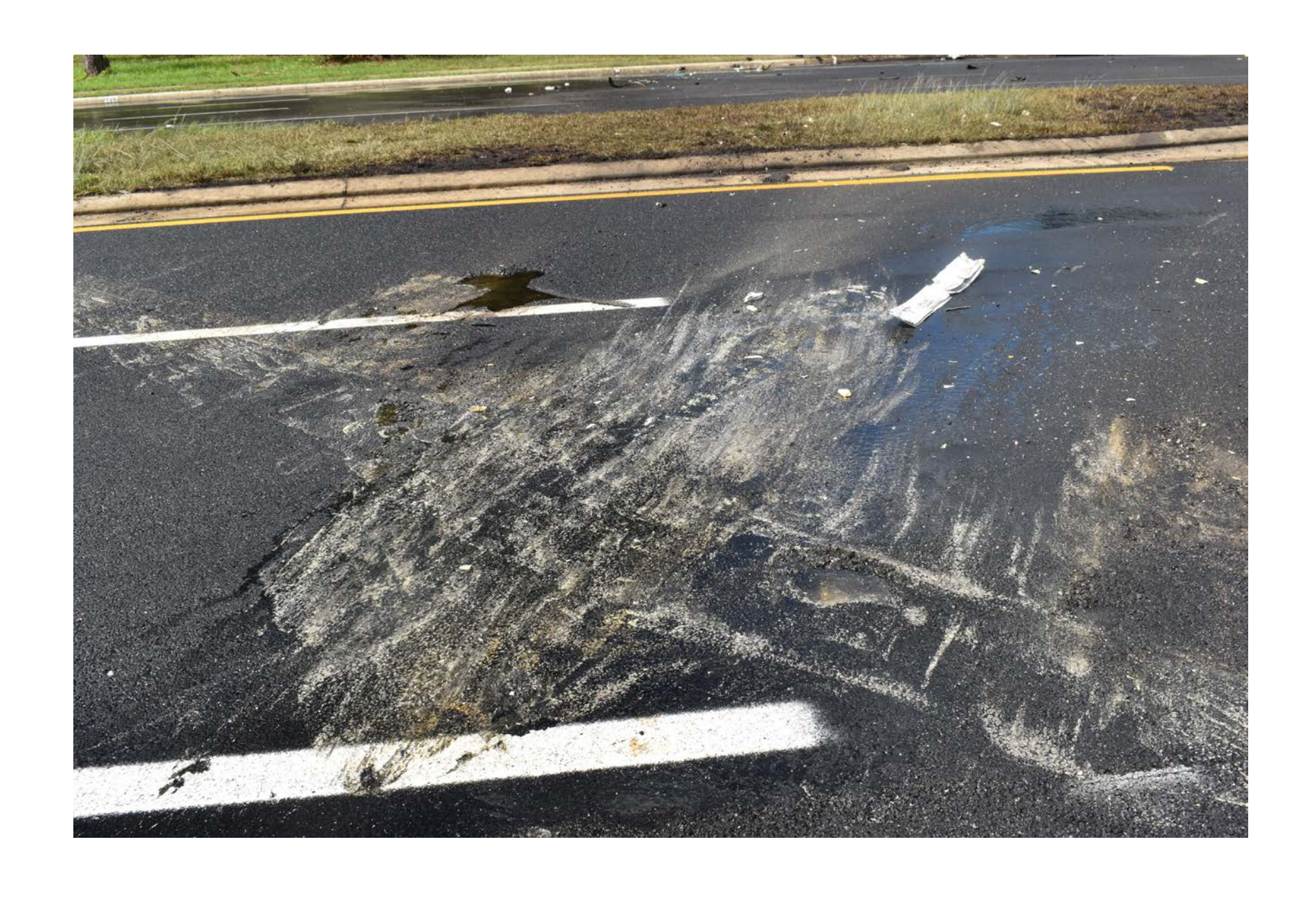
Photo 3 – Imprint of Airplane on Highway. Final Wreckage Location in Background