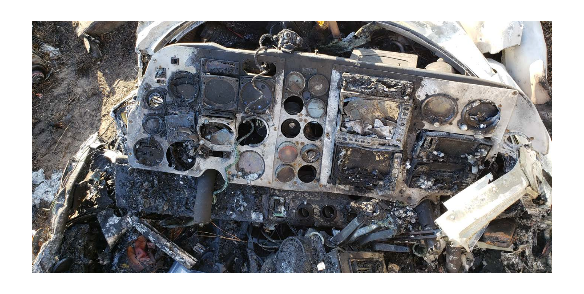
Photo 9 – View of Damaged Instrument Panel and Throttle/Control Levers.