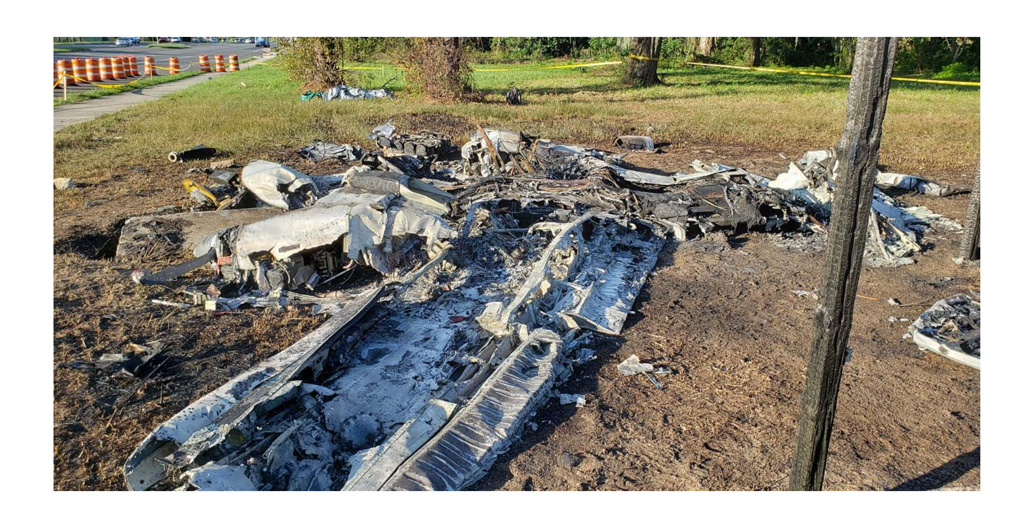
Photo 5 – View of Airplane Wreckage Looking Down Left Wing to the Fuselage.