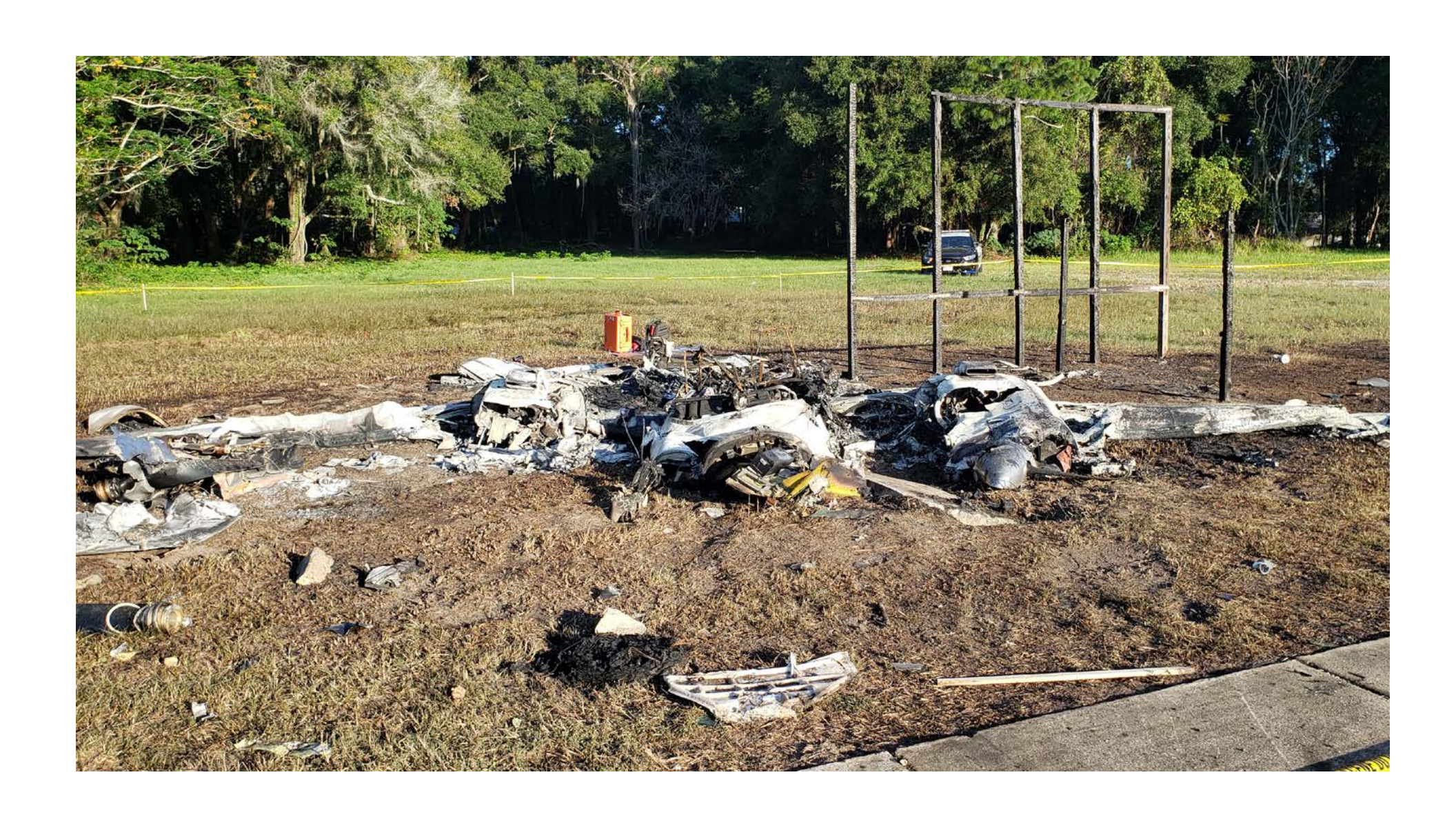
Photo 4 – Airplane Wreckage at Final resting Site; View Looking from Nose to Tail.