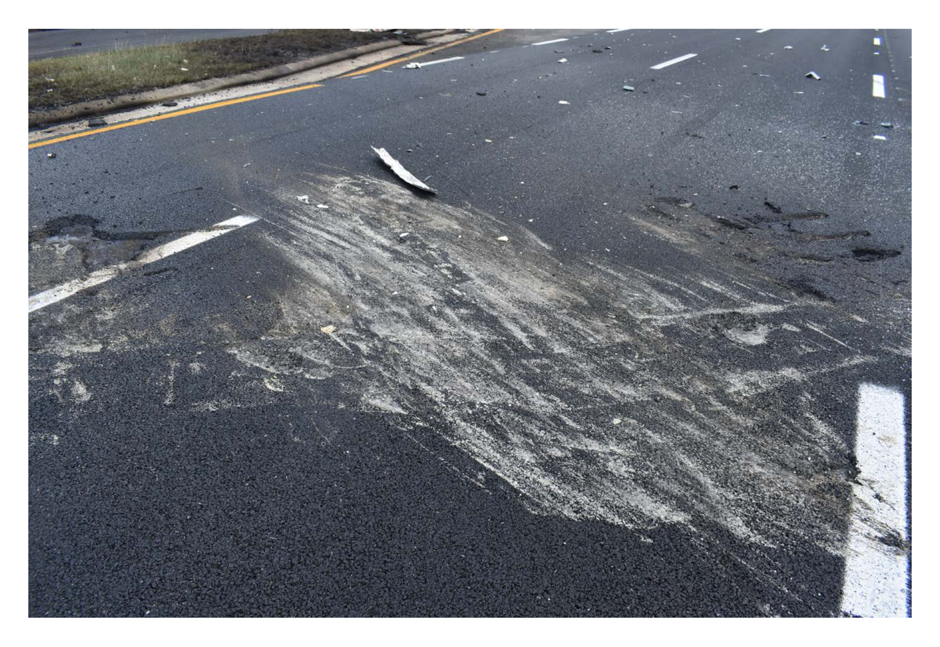
Photo 2 – Imprint of Airplane on Highway. Note Left and Right Propeller Marks in Asphalt.