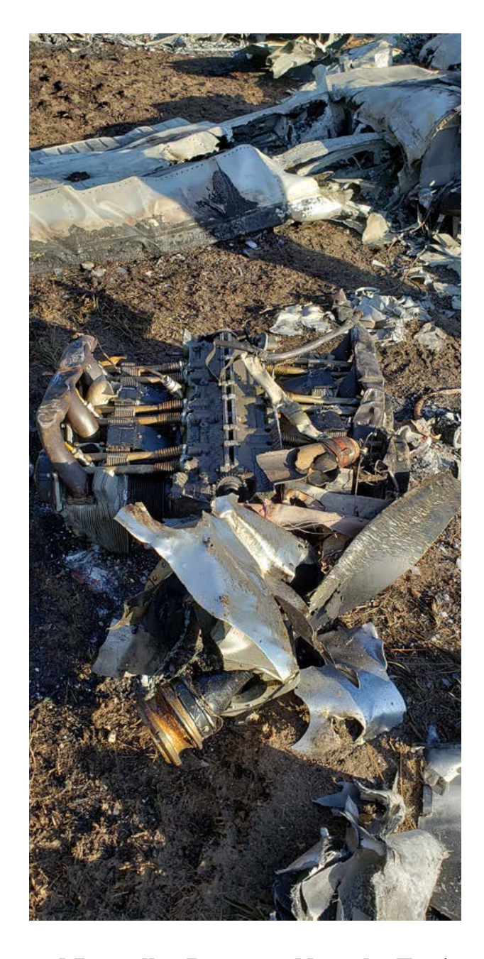
Photo 8 – View of Right Engine and Propeller Damage; Note the Engine is Detached and Upside Down.