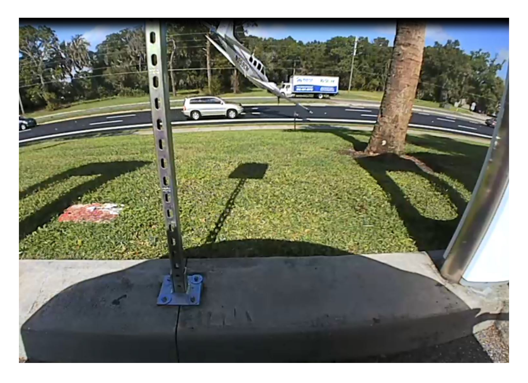
Photo 1 – Automobile Video of Airplane Immediately Before Impact.